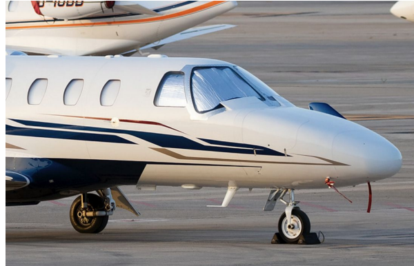
Cessna Citationjet 525, CJ-I, CJ1+, & M2 Cockpit Heatshields