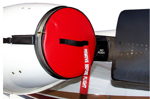
Engine Exhaust Plug