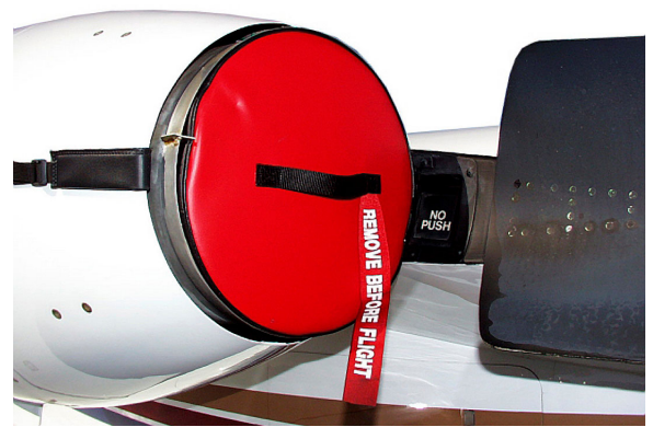
Engine Exhaust Plug