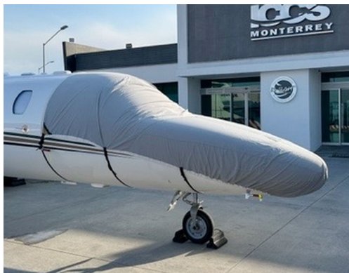
Cessna Citationjet 525B Travel Weight Cockpit/Nose Cover

This cover type is made from Silver Acrylic Sunbrella canvas and is 100% lined with a soft and smooth microfiber. Bruce's Custom Covers developed this material combination especially for aircraft protection. The outer material is medium weight and treated for water resistance, UV resistance and anti-static buildup. The inner lining is a very soft and smooth microfiber to prevent scratching. The material is very reflective, and tests show that the cabin interior temperature can be reduced to near-ambient temperature on the hottest of days. It is water, ice and snow repellent, yet breathable to allow moisture to escape from between the cover and the aircraft surface.