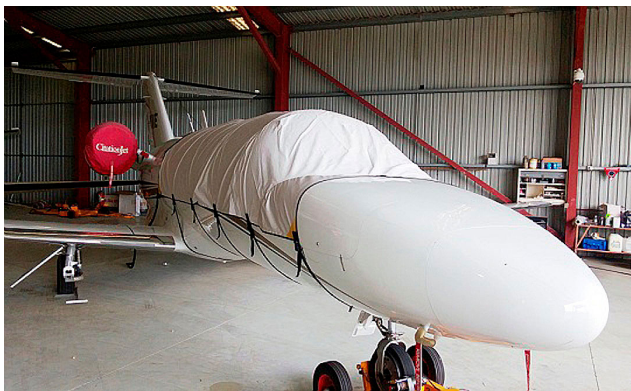
Citation CJ-1 Canopy Cover and Engine Covers

Travel Covers are made with Silver Solution-Dyed Polyester fabric and only lined over the windshield to save weight. The material is lightweight and more compact for easy stowage in the aircraft. The polyester material is water resistant, but only intended for occasional use outside. We also have an ultra lightweight material available for fitted hangar dust covers. For daily outdoor use, the non-travel Sunbrella Cover is the best choice.