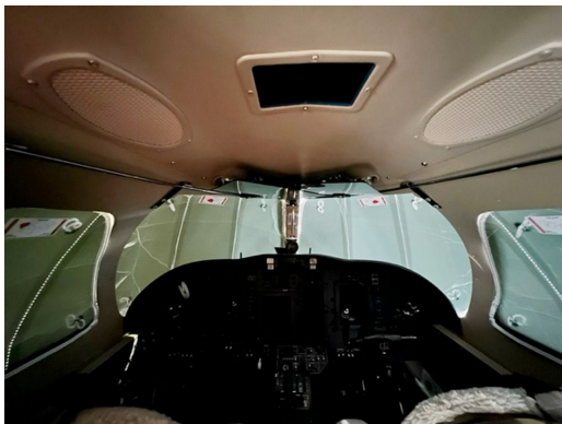
Cessna 525A Cockpit heatshields

Custom-made Heatshield Sunshades are available for almost any window in the jet. Side windows, Skylights, and Emergency Exits are all custom-made. The product is a unique composite of closed-cell foam with a silver mylar finish. The set is easily stored in the included storage sleeve. Some designs may require velcro and suction cups. Our Heatshields are offered white side out since aircraft manufacturers have issued advisories against reflective window inserts due to potential heat damage.