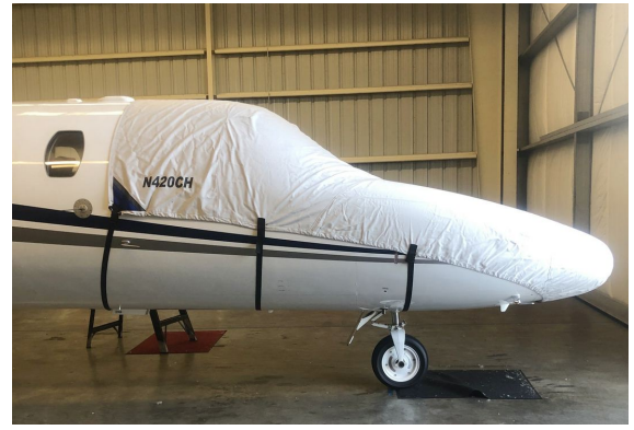
Cessna Citationjet CJ3 Cockpit/Nose Cover