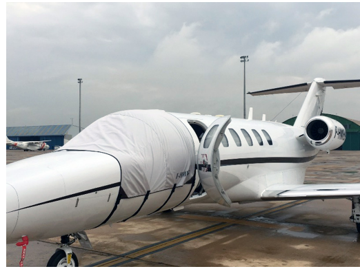
Cessna Citationjet 525A, CJ-2, & CJ2+ Cockpit Cover