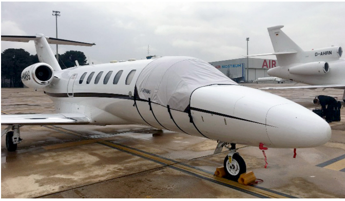
Cessna Citationjet 525A, CJ-2, & CJ2+ Cockpit Cover