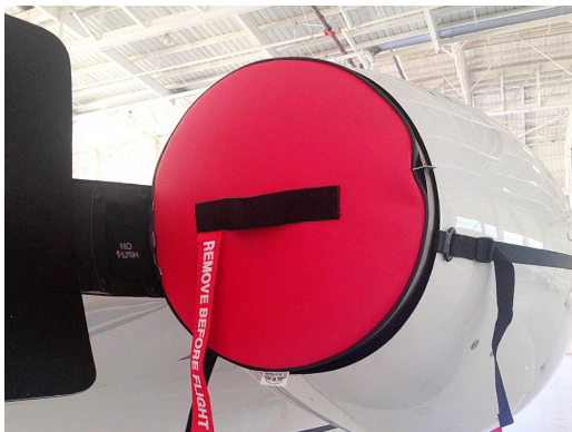
Cessna CJ1 Exhaust Plug

The Engine Inlet Plugs are custom fit for your Cessna Citationjet 525A, CJ-2, & CJ2+ intakes, made with heavy-duty vinyl material, and stuffed with a single block of sculpted urethane foam. Each plug has a zipper that allows the foam to be removed and dried if necessary. Engine plugs have 'remove before flight' streamers sewn onto the face of the plugs. Most plugs are imprinted with the aircraft registration number in black for an extra charge. Storage bag NOT included. Engine plugs may be inserted after flight when the engine is still warm. Engine Inlet Plugs are commonly referred to as Cowl Plugs, Intake Plugs, Cowl Blocks, Engine Blocks, and Engine Bungs.