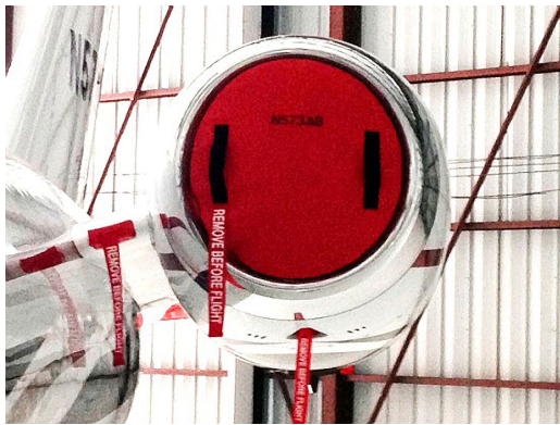
Citation CJ4 Intake Plugs pair

The Engine Inlet Plugs are custom fit for your Cessna Citationjet 525A, CJ-2, & CJ2+ intakes, made with heavy-duty vinyl material, and stuffed with a single block of sculpted urethane foam. Each plug has a zipper that allows the foam to be removed and dried if necessary. Engine plugs have 'remove before flight' streamers sewn onto the face of the plugs. Most plugs are imprinted with the aircraft registration number in black for an extra charge. Storage bag NOT included. Engine plugs may be inserted after flight when the engine is still warm. Engine Inlet Plugs are commonly referred to as Cowl Plugs, Intake Plugs, Cowl Blocks, Engine Blocks, and Engine Bungs.