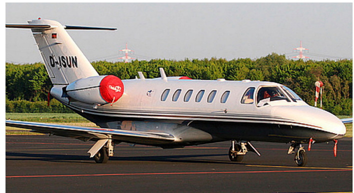
Engine Inlet/Exhaust Covers