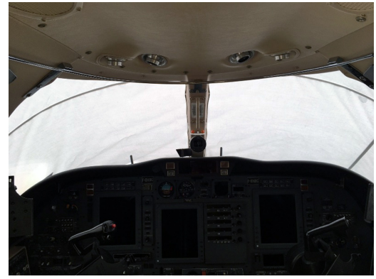
Cessna Citationjet Cockpit Cover