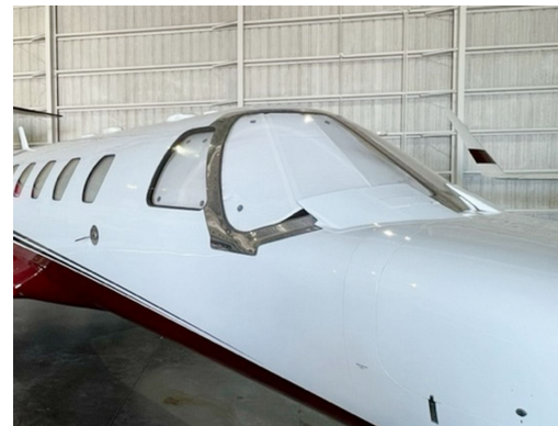
Cessna 525A Cockpit heatshields