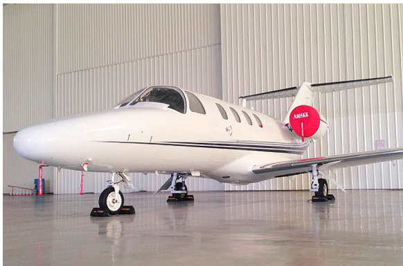
Cessna CJ1 Intake Cover

The Cessna Citationjet 525A, CJ-2, & CJ2+ Intake/Exhaust Plugs are custom fit for the intake and exhaust openings, made with heavy-duty vinyl material, and stuffed with a single block of sculpted urethane foam. Each plug has a zipper that allows the foam to be removed and dried if necessary. Engine plugs have 'remove before flight' streamers sewn onto the face of the plugs. Most plugs are imprinted with the aircraft registration number in black. Engine plugs may be inserted after flight when the engine is still warm. Engine Inlet Plugs are commonly referred to as Cowl Plugs, Intake Plugs, Cowl Blocks, Engine Blocks, and Engine Bungs.