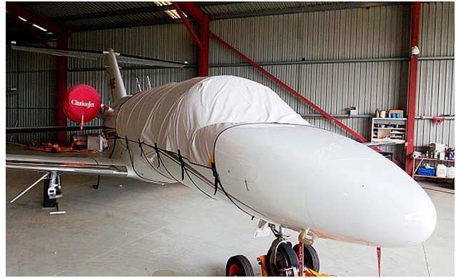
Citation CJ-1 Canopy Cover and Engine Covers