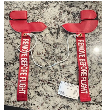
Cessna Citation Pitot Cover Set