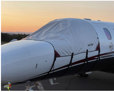
Cessna Citation Jet 525 Cockpit Cover