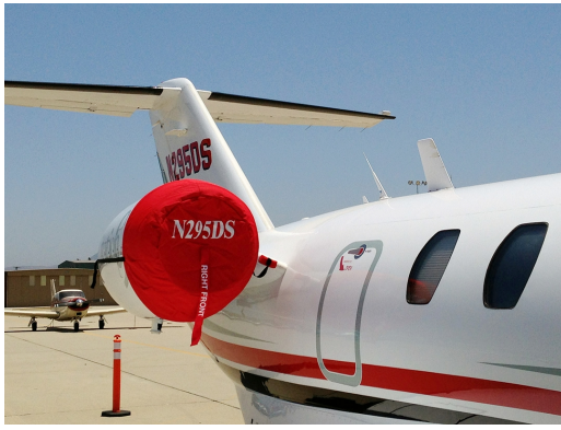
Inlet Covers & Exhaust Plugs