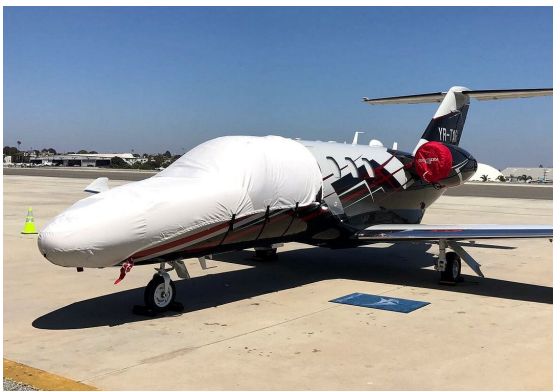
Citationjet CJ1 Cockpit/Nose Cover

Travel Covers are made with Silver Solution-Dyed Polyester fabric and only lined over the windshield to save weight. The material is lightweight and more compact for easy stowage in the aircraft. The polyester material is water resistant, but only intended for occasional use outside. We also have an ultra lightweight material available for fitted hangar dust covers. For daily outdoor use, the non-travel Sunbrella Cover is the best choice.