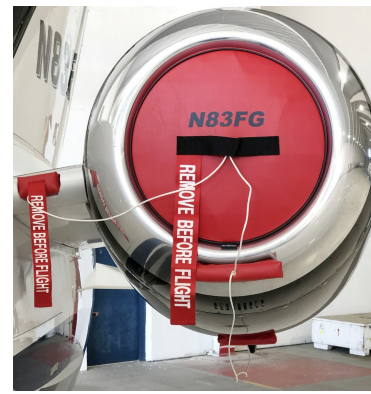
Cessna Citation Mustang 510 Engine Plugs