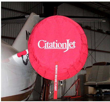
Cessna Citation Engine Cover Set