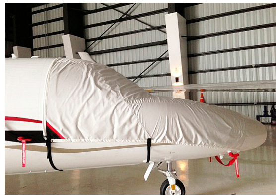
Citation CJ4 Cockpit/Nose Cover and Heat Resistant Pitot Covers set