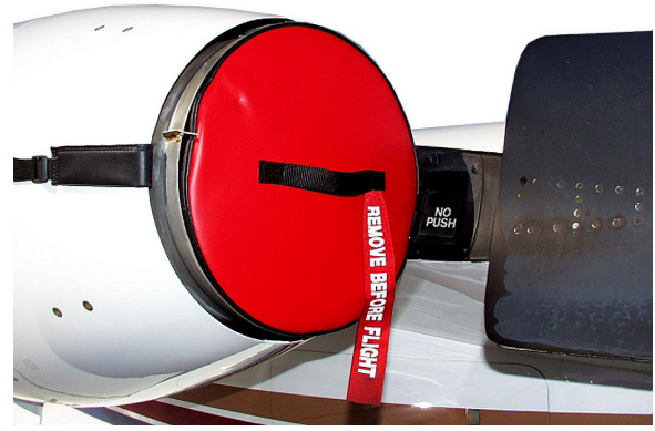
Engine Exhaust Plug