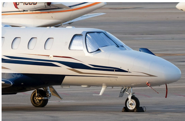
Cessna Citationjet 525, CJ-I, CJ1+, & M2 Cockpit Heatshields

Custom-made Heatshield Sunshades are available for almost any window in the jet. Side windows, Skylights, and Emergency Exits are all custom-made. The product is a unique composite of closed-cell foam with a silver mylar finish. The set is easily stored in the included storage sleeve. Some designs may require velcro and suction cups. Our Heatshields are offered white side out since aircraft manufacturers have issued advisories against reflective window inserts due to potential heat damage.