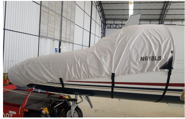
Citationjet 525B Cockpit/Nose Cover