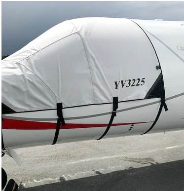
Cessna Citationjet V Ultra (560) Cockpit Cover

This cover type is made from Silver Acrylic Sunbrella canvas and is 100% lined with a soft and smooth microfiber. Bruce's Custom Covers developed this material combination especially for aircraft protection. The outer material is medium weight and treated for water resistance, UV resistance and anti-static buildup. The inner lining is a very soft and smooth microfiber to prevent scratching. The material is very reflective, and tests show that the cabin interior temperature can be reduced to near-ambient temperature on the hottest of days. It is water, ice and snow repellent, yet breathable to allow moisture to escape from between the cover and the aircraft surface.