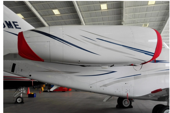
Citation X Intake/Exhaust Cover Set