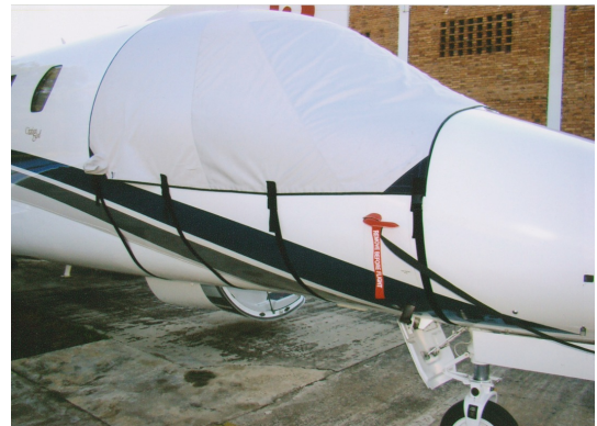
Citation XL Cockpit Cover