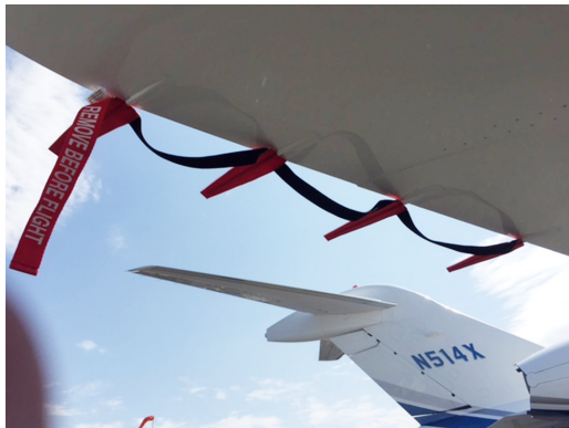
Citation X Static Wick Protectors

The Engine Exhaust Plugs are custom fit for your Cessna Citation X (750) exhaust openings, made with heavy-duty vinyl material, and stuffed with a single block of sculpted urethane foam. Each plug has a zipper that allows the foam to be removed and dried if necessary. Exhaust plugs have 'remove before flight' streamers sewn onto the face of the plugs. Most plugs are imprinted with the aircraft registration number in black for an extra charge. Exhaust plugs may be inserted soon after flight when the engine is still warm. Engine Inlet Plugs are commonly referred to as Cowl Plugs, Intake Plugs, Cowl Blocks, Engine Blocks, and Engine Bungs.