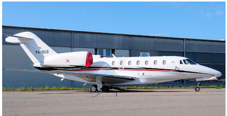
Citation X Intake & Pitot Tube Covers