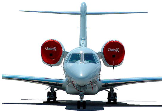
Citation X Intake Covers

The Cessna Citation X (750) Intake Covers are designed to install easily yet be completely storable. A spring steel hoop is sewn into the hem of each cover, allowing them to be installed without climbing onto the wing or using a stepladder. To store the covers the spring steel hoop folds like a band-saw blade into three nesting rings. Each cover folds into a compact circular bundle which is stored in the included duffel bag, yet they unfold quickly for use. The Tri-Fold Ring cover is made of medium weight nylon which is available in a variety of colors to match the paint trim. Each cover set comes complete with installation and folding instructions. The aircraft's registration number can be silkscreened onto the cover for an extra charge.