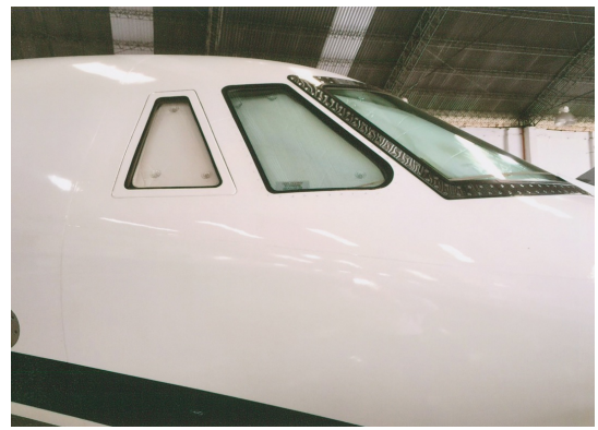
Citation XL Cockpit HeatShields