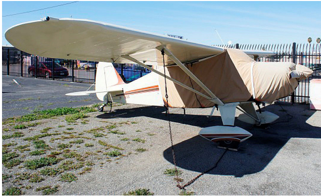
Piper PA-22-150 Pacer Extended Canopy, Engine & Prop/Spinner Covers

Insulated Covers Material - A special composite material of solution-dyed polyester, 3M Thinsulate insulation, and soft nylon interior fabric. Our insulated covers are designed to complement an engine preheater and help retain heat in the engine compartment after shutdown. If you operate your aircraft in cold-weather, these covers will help prevent engine wear and tear.