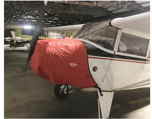
Piper PA-15 Vagabond Insulated Engine Cover