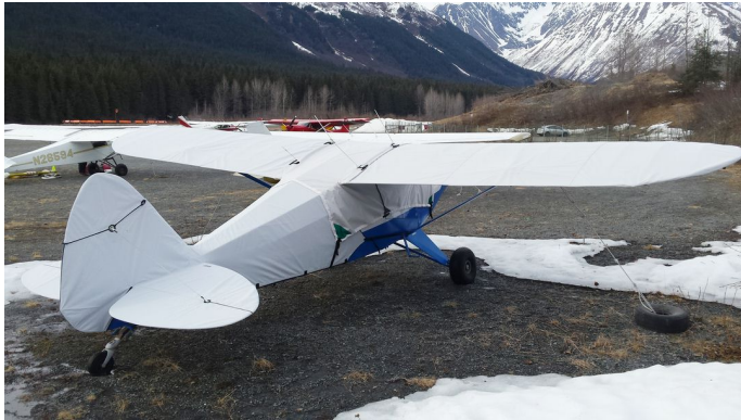
Piper Pacer PA-22 Over-Top Canopy Cover, Wing and Empennage Covers

This cover type is made from Silver Acrylic Sunbrella canvas and is 100% lined with a soft and smooth microfiber. Bruce's Custom Covers developed this material combination especially for aircraft protection. The outer material is medium weight and treated for water resistance, UV resistance and anti-static buildup. The inner lining is a very soft and smooth microfiber to prevent scratching. The material is very reflective, and tests show that the cabin interior temperature can be reduced to near-ambient temperature on the hottest of days. It is water, ice and snow repellent, yet breathable to allow moisture to escape from between the cover and the aircraft surface.