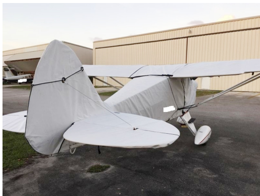
Piper PA-20 Complete Cover Set

WINTER USE MATERIAL - Made with Solution-Dyed Polyester fabric, this option is intended for seasonal use to aid in deicing, rain mitigation, or for occasional travel. The material is lighter and more compact, but more susceptible to UV damage and may have a shorter useful life if used continuously outside than the all-year use material.