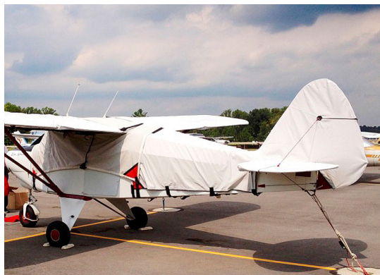
Piper Tri-Pacer Canopy, Empennage and Wing Covers