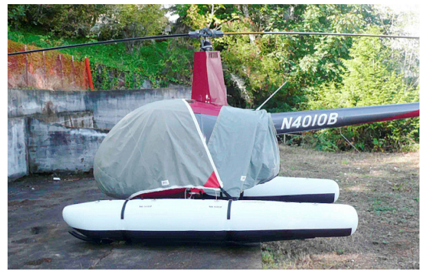
Robinson R-22 Standard Bubble Cover & Engine Cover