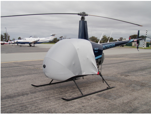
Robinson R-22 Light Weight Travel Cover