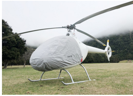
Guimbal Cabri CG2 Bubble Cover, light weight travel type