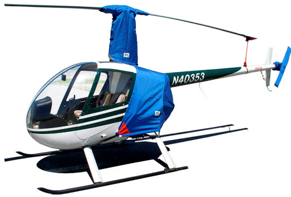
Robinson R-22 Engine, Rotor Mast & Tail Rotor Covers, with Blade Tie-down