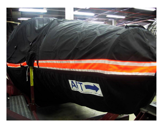
CFM-56-5A/5B Off-link Engine Shipper/Transport cover, w/ Exhaust Cone, fully enclosed