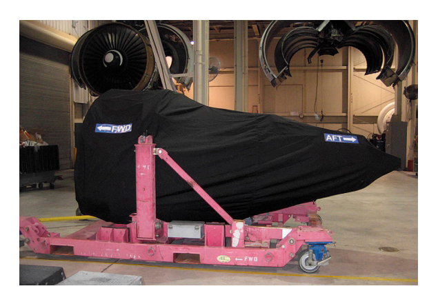
CFM-56-7 Off-link Engine Shipper/Transport cover, w/ Exhaust Cone, fully enclosed