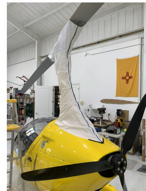
Calidus Gyrocopter Rotor Mast Cover, test fit cover