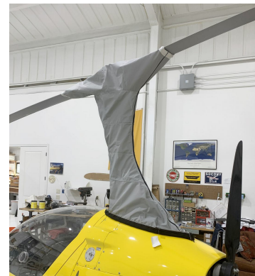
Autogyro Calidus Gyrocopter Rotor Hub/Mast Cover