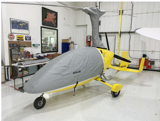
Autogyro Calidus Gyrocopter Canopy/Nose & Rotor Hub/Mast Cover

Rotor Hub Covers overlaps with the Blade Covers to ensure complete protection for the entire main rotor system. Designed like a jacket with sleeves and no collar, the rotor hub cover fastens together below each blade with Delrin buckles. The Rotor Hub Cover is normally made from Solution-Dyed Polyester.