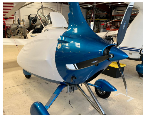
Autogyro Calidus Canopy/Nose Cover, test fit cover