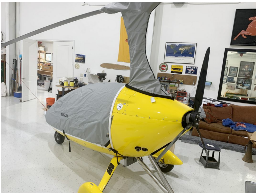
Autogyro Calidus Gyrocopter Canopy/Nose & Rotor Hub/Mast Cover

Travel Covers are made with Silver Solution-Dyed Polyester fabric and fully lined over the entire cover. The material is lightweight and more compact for easy storage in the aircraft. The polyester material is water resistant, but only intended for occasional use outside. We also have an ultra lightweight material available for fitted hangar dust covers. For daily outdoor use, the non-travel Sunbrella Cover is the best choice.