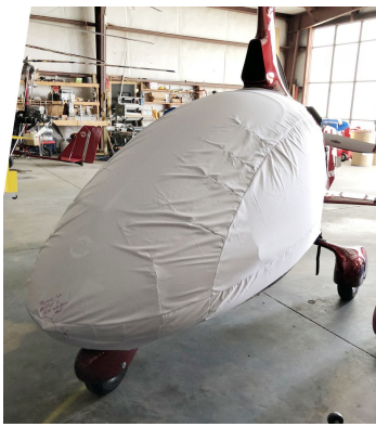
Cavalon Gyrocopter Bubble Cover, test fit cover