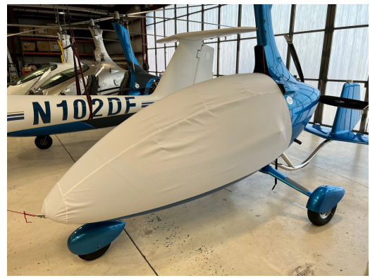
Autogyro Calidus Canopy/Nose Cover, test fit cover