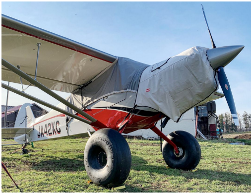
Cub Crafters CC19 X-Cub Engine Cover, Travel Weight Canopy Cover