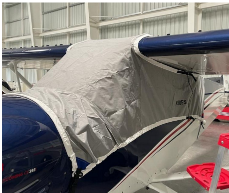
CubCrafters CCX-2300 Light Weight Travel Cover

This cover type is made from Silver Acrylic Sunbrella canvas and is 100% lined with a soft and smooth microfiber. Bruce's Custom Covers developed this material combination especially for aircraft protection. The outer material is medium weight and treated for water resistance, UV resistance and anti-static buildup. The inner lining is a very soft and smooth microfiber to prevent scratching. The material is very reflective, and tests show that the cabin interior temperature can be reduced to near-ambient temperature on the hottest of days. It is water, ice and snow repellent, yet breathable to allow moisture to escape from between the cover and the aircraft surface.