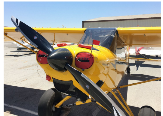
Cub Crafters CC-11 Carbon Cub Engine Plugs