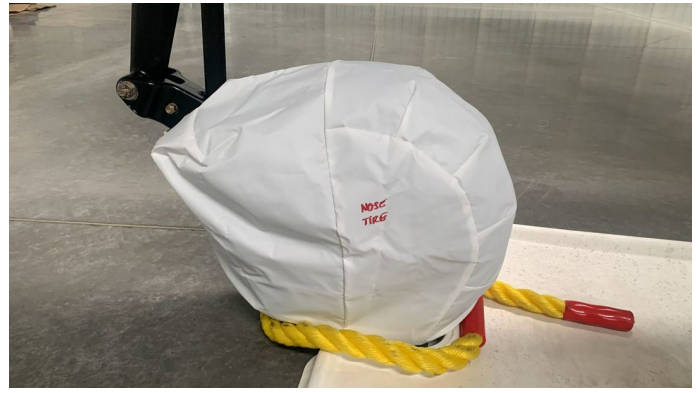
Cub Crafters Tire Covers, tricycle gear, test fit covers