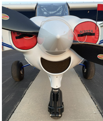
CubCrafters CC-18, 19, 20, Top Cub, CCK-1865, CC-19 X-Cub, CCX-2000, EX-3, FX-3 Engine Inlet Plugs

Engine Inlet Plugs are custom fit for your CubCrafters CC-18, 19, 20, Top Cub, CCK-1865, CC-19 X-Cub, CCX-2000, EX-3, FX-3 intakes, made with heavy-duty vinyl material, and stuffed with a single block of sculpted urethane foam. Each plug has a zipper that allows the foam to be removed and dried if necessary. Engine plugs have warning flags that are visible from the cockpit or 'remove before flight' streamers sewn onto the face of the plugs. Most plugs are imprinted with the aircraft registration number in black for an extra charge. Storage bag NOT included. Engine plugs may be inserted after flight when the engine is still warm. Engine Inlet Plugs are commonly referred to as Cowl Plugs, Intake Plugs, Cowl Blocks, Engine Blocks, and Engine Bungs.