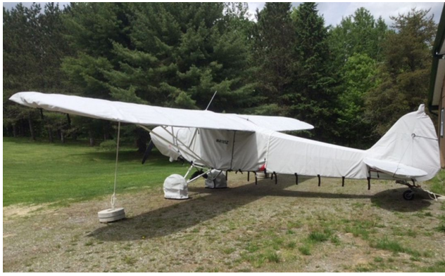
Piper PA-18-150 Super Cub Complete Cover Set