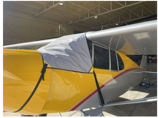
Piper PA-18 Windshield/Skylight Cover