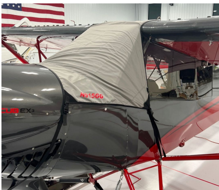
Cub Crafters CC11-004: WINDSHIELD/SKYLIGHT COVER

This cover type is made from Silver Acrylic Sunbrella canvas and is 100% lined with a soft and smooth microfiber. Bruce's Custom Covers developed this material combination especially for aircraft protection. The outer material is medium weight and treated for water resistance, UV resistance and anti-static buildup. The inner lining is a very soft and smooth microfiber to prevent scratching. The material is very reflective, and tests show that the cabin interior temperature can be reduced to near-ambient temperature on the hottest of days. It is water, ice and snow repellent, yet breathable to allow moisture to escape from between the cover and the aircraft surface.