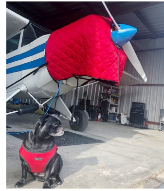
Piper PA-12 Insulated Hangar Blanket