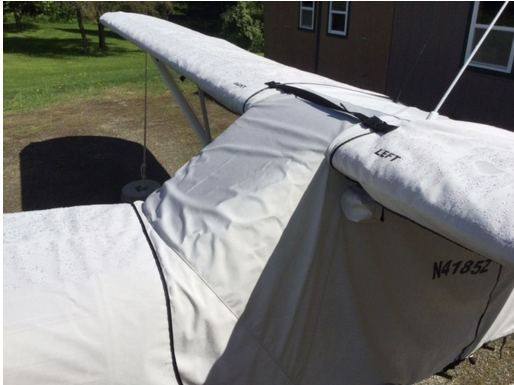
Piper PA-18-150 Super Cub Complete Cover Set

WINTER USE MATERIAL - Made with Solution-Dyed Polyester fabric, this option is intended for seasonal use to aid in deicing, rain mitigation, or for occasional travel. The material is lighter and more compact, but more susceptible to UV damage and may have a shorter useful life if used continuously outside than the all-year use material.