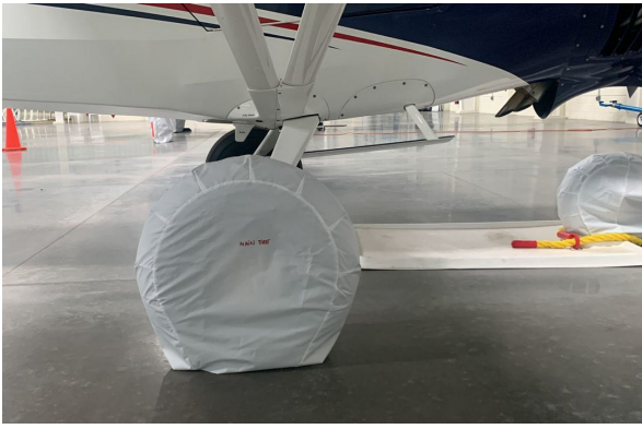
Cub Crafters Tire Covers, tricycle gear, test fit covers