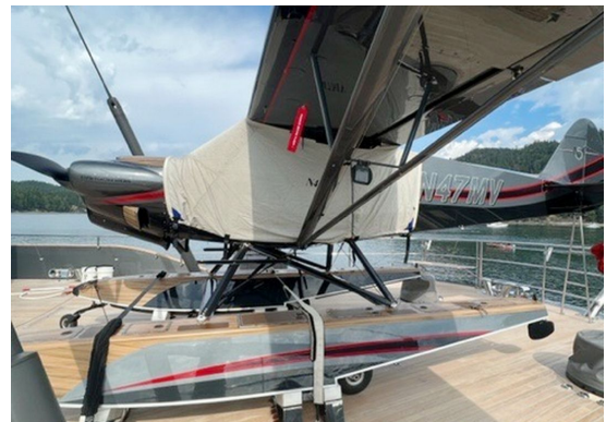
Cubcrafters CC11-160 Extended Canopy Cover