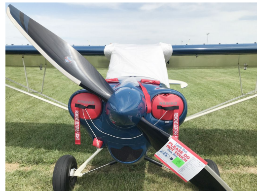
Cub Crafters EX2 Canopy Cover, Engine Plugs