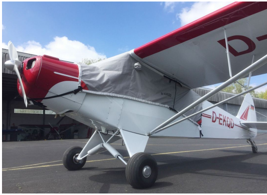
Piper Super Cub Travel Weight Canopy Cover