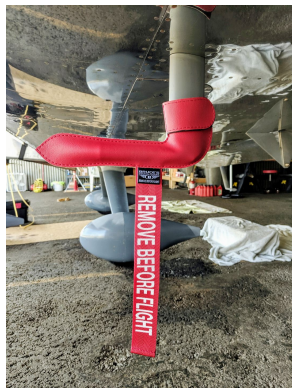
Van's RV-14 Pitot Cover

Engine Inlet Plugs are custom fit for your CubCrafters CC-11, Sport Cub S2, & Carbon Cub intakes, made with heavy-duty vinyl material, and stuffed with a single block of sculpted urethane foam. Each plug has a zipper that allows the foam to be removed and dried if necessary. Engine plugs have warning flags that are visible from the cockpit or 'remove before flight' streamers sewn onto the face of the plugs. Most plugs are imprinted with the aircraft registration number in black for an extra charge. Storage bag NOT included. Engine plugs may be inserted after flight when the engine is still warm. Engine Inlet Plugs are commonly referred to as Cowl Plugs, Intake Plugs, Cowl Blocks, Engine Blocks, and Engine Bungs.