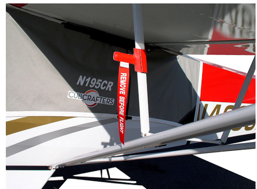
Cub Crafters Sport Cub Pitot Cover