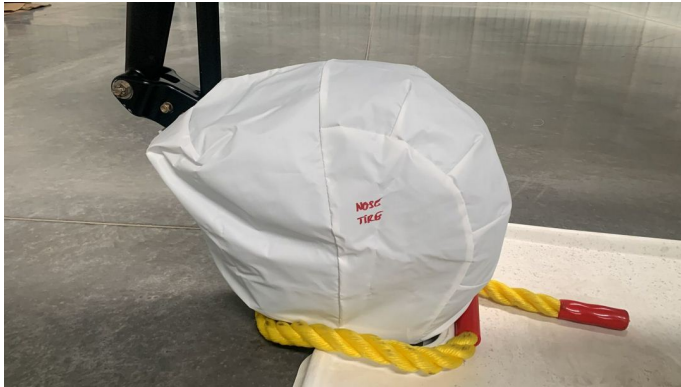
Cub Crafters Tire Covers, tricycle gear, test fit covers

ALL-YEAR USE MATERIAL - Made with Silver Acrylic Sunbrella canvas, the all-year use material is the best option for sun protection and cover longevity. This heavier more durable material is intended for all weather conditions, such as rain and snow or lots of sun.