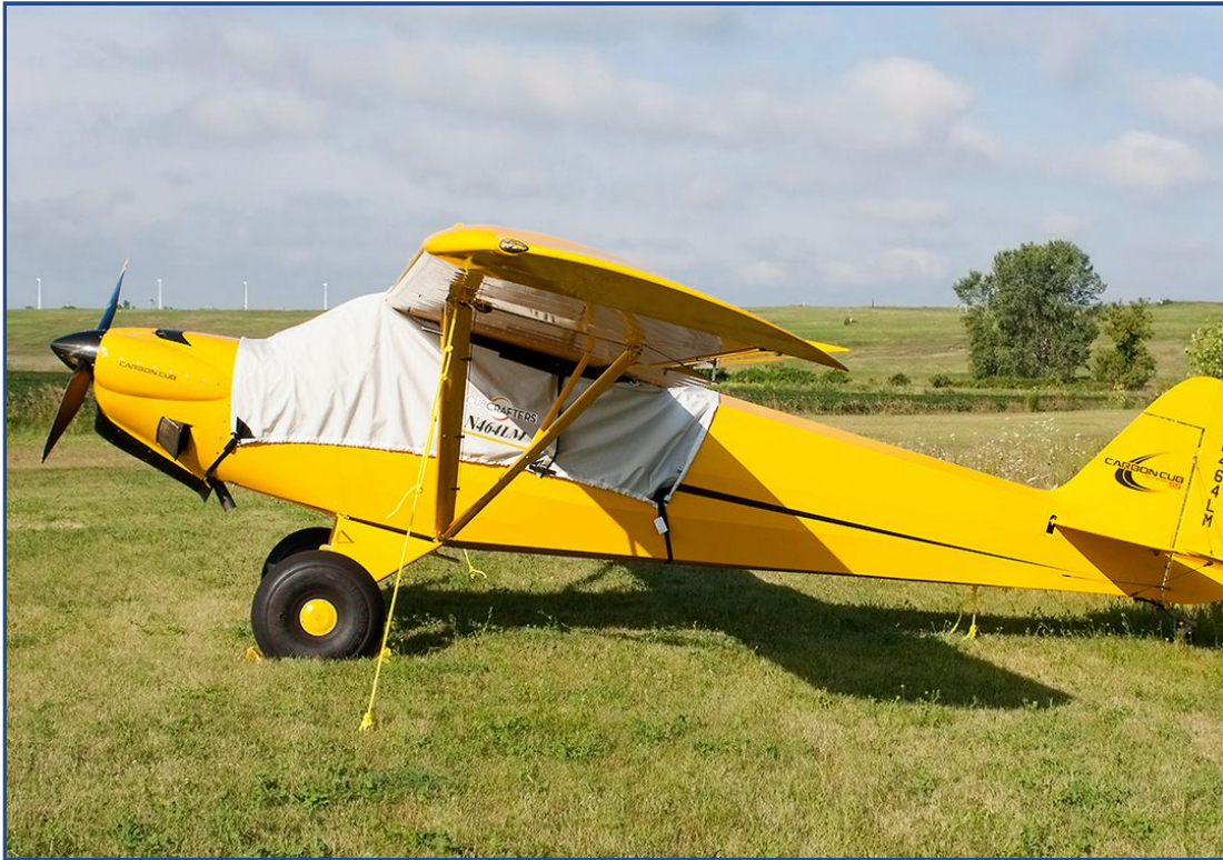
Cub Crafters Canopy Cover