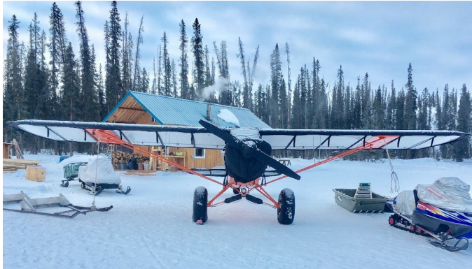
Piper PA-18 Super Cub Canopy Cover (Over-The-Top Style)