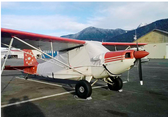
Bellanca Citabria Over-Top Canopy Cover, extended to tail

This cover type is made from Silver Acrylic Sunbrella canvas and is 100% lined with a soft and smooth microfiber. Bruce's Custom Covers developed this material combination especially for aircraft protection. The outer material is medium weight and treated for water resistance, UV resistance and anti-static buildup. The inner lining is a very soft and smooth microfiber to prevent scratching. The material is very reflective, and tests show that the cabin interior temperature can be reduced to near-ambient temperature on the hottest of days. It is water, ice and snow repellent, yet breathable to allow moisture to escape from between the cover and the aircraft surface.