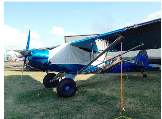
Cub Crafters Carbon Cub Canopy Cover