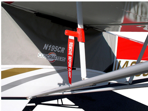
Cub Crafters Sport Cub Pitot Cover

Engine Inlet Plugs are custom fit for your CubCrafters CC-11, Sport Cub S2, & Carbon Cub intakes, made with heavy-duty vinyl material, and stuffed with a single block of sculpted urethane foam. Each plug has a zipper that allows the foam to be removed and dried if necessary. Engine plugs have warning flags that are visible from the cockpit or 'remove before flight' streamers sewn onto the face of the plugs. Most plugs are imprinted with the aircraft registration number in black for an extra charge. Storage bag NOT included. Engine plugs may be inserted after flight when the engine is still warm. Engine Inlet Plugs are commonly referred to as Cowl Plugs, Intake Plugs, Cowl Blocks, Engine Blocks, and Engine Bungs.