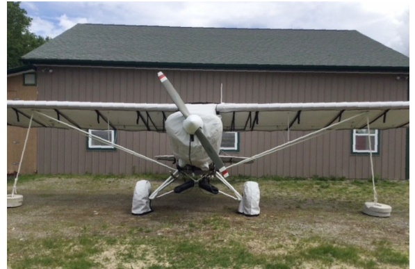
Piper PA-18-150 Super Cub Complete Cover Set