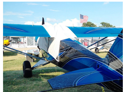
Cub Crafters Carbon Cub Canopy Cover