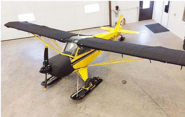
Aviat Husky Insulated Engine Cover, Wing Covers

WINTER USE MATERIAL - Made with Solution-Dyed Polyester fabric, this option is intended for seasonal use to aid in deicing, rain mitigation, or for occasional travel. The material is lighter and more compact, but more susceptible to UV damage and may have a shorter useful life if used continuously outside than the all-year use material.