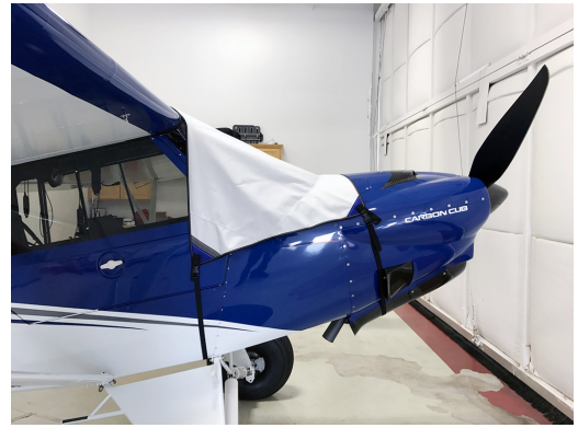
Cub Crafters CC-11 Windshield Cover