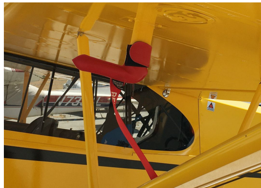
Cub Crafters CC-11 Carbon Cub Pitot Cover