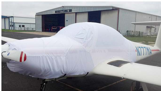
Taifun 17E Canopy/Engine Cover, test fit cover