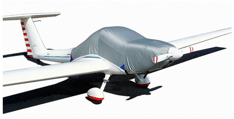
Grob 109 Canopy/Engine Cover