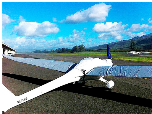
Lambada Canopy/Engine Cover and Wing Covers