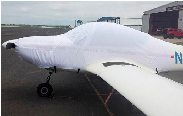
Taifun 17E Canopy/Engine Cover, test fit cover