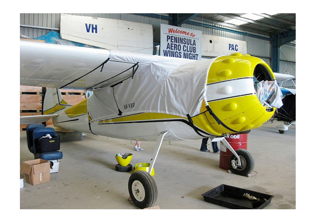
Cessna 195 Canopy Cover, over-top, 24" fwd ext to cover cowl ring gap, gas cap ext.