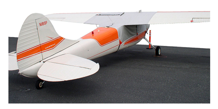
Cessna 195 Over-Top Canopy, Engine & Prop Covers

The material is very reflective, and tests show that the cabin interior temperature can be reduced to near-ambient temperature on the hottest of days. It is water, ice and snow repellent, yet breathable to allow moisture to escape from between the cover and the aircraft surface.