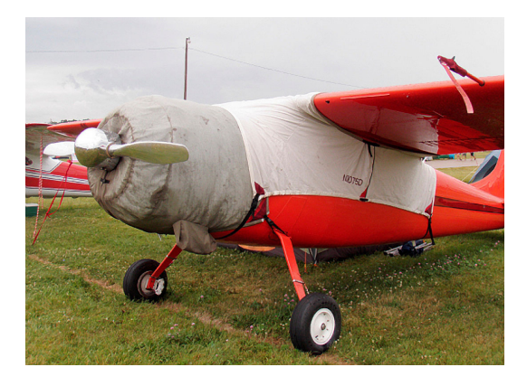
Cessna 195 Over-Top Canopy Cover & Engine Cover

Covers developed this material combination especially for aircraft protection. The outer material is medium weight and treated for water resistance, UV resistance and anti-static buildup. The inner lining is a very soft and smooth microfiber to prevent scratching. The material is very reflective, and tests show that the cabin interior temperature can be reduced to near-ambient temperature on the hottest of days. It is water, ice and snow repellent, yet breathable to allow moisture to escape from between the cover and the aircraft surface.