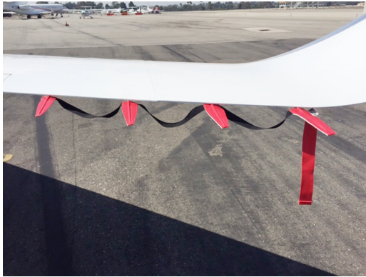
Citation X Static Wick Protectors

ALL-YEAR USE MATERIAL - Made with Silver Acrylic Sunbrella canvas, the all-year use material is the best option for sun protection and cover longevity. This heavier more durable material is intended for all weather conditions, such as rain and snow or lots of sun.