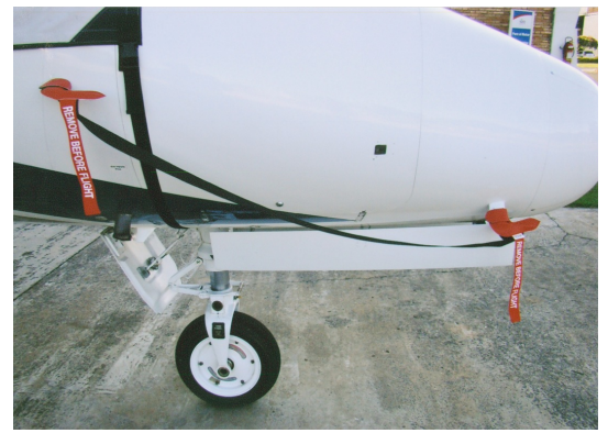
Citation XL Pitot Covers