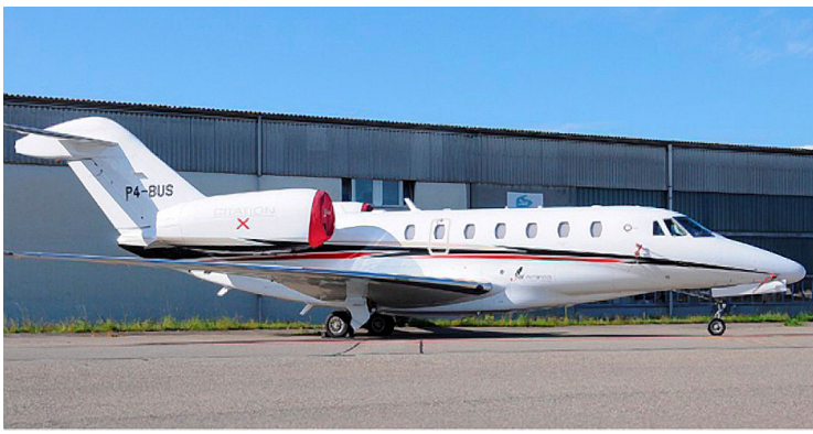
Citation X Intake & Pitot Tube Covers