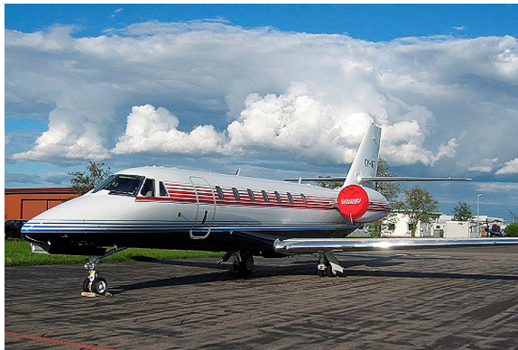
Citation Sovereign Engine Covers

The Cessna Citation Latitude (680A) Intake/Exhaust Plugs are custom fit for the intake and exhaust openings, made with heavy-duty vinyl material, and stuffed with a single block of sculpted urethane foam. Each plug has a zipper that allows the foam to be removed and dried if necessary. Engine plugs have 'remove before flight' streamers sewn onto the face of the plugs. Most plugs are imprinted with the aircraft registration number in black. Engine plugs may be inserted after flight when the engine is still warm. Engine Inlet Plugs are commonly referred to as Cowl Plugs, Intake Plugs, Cowl Blocks, Engine Blocks, and Engine Bungs.