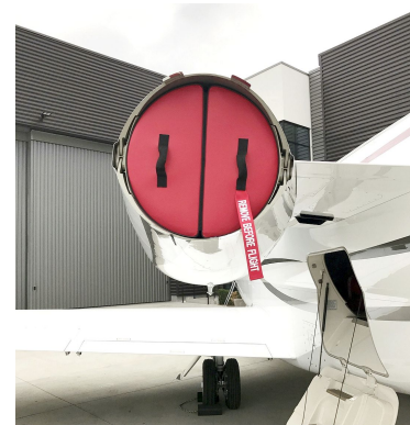
Cessna Citation 680 Exhaust Plugs, folding type