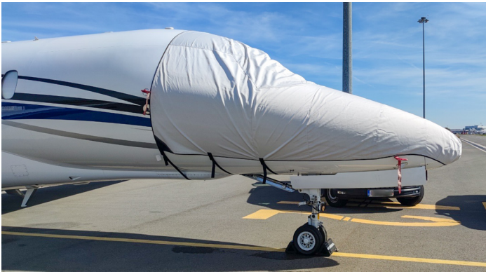
Cessna Citation Latitude (680A) Cockpit/Nose Cover, Doesn't Cover Pitot Tubes