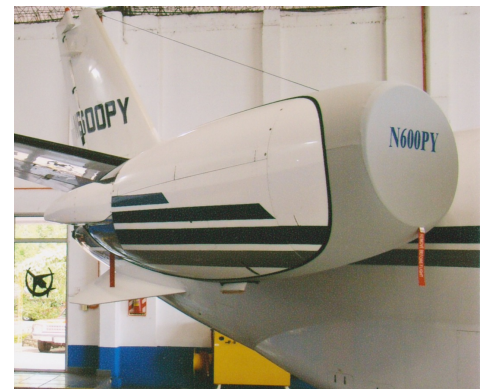
Citation XL Bikini Style Engine Covers