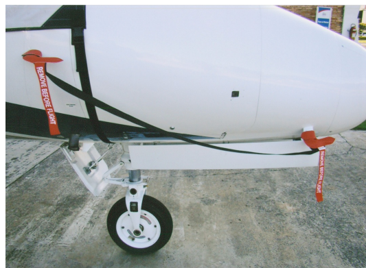
Citation XL Pitot Covers