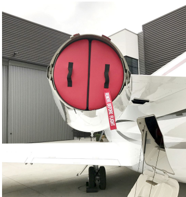
Cessna Citation 680 Exhaust Plugs, folding type

The Engine Inlet Plugs are custom fit for your Cessna Citation Latitude (680A) intakes, made with heavy-duty vinyl material, and stuffed with a single block of sculpted urethane foam. Each plug has a zipper that allows the foam to be removed and dried if necessary. Engine plugs have 'remove before flight' streamers sewn onto the face of the plugs. Most plugs are imprinted with the aircraft registration number in black for an extra charge. Storage bag NOT included. Engine plugs may be inserted after flight when the engine is still warm. Engine Inlet Plugs are commonly referred to as Cowl Plugs, Intake Plugs, Cowl Blocks, Engine Blocks, and Engine Bungs.