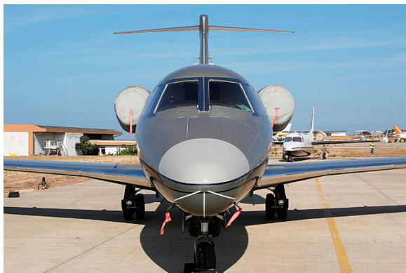
Citation III 650 Engine Covers Set

The Cessna Citation Latitude (680A) Intake/Exhaust Plugs are custom fit for the intake and exhaust openings, made with heavy-duty vinyl material, and stuffed with a single block of sculpted urethane foam. Each plug has a zipper that allows the foam to be removed and dried if necessary. Engine plugs have 'remove before flight' streamers sewn onto the face of the plugs. Most plugs are imprinted with the aircraft registration number in black. Engine plugs may be inserted after flight when the engine is still warm. Engine Inlet Plugs are commonly referred to as Cowl Plugs, Intake Plugs, Cowl Blocks, Engine Blocks, and Engine Bungs.