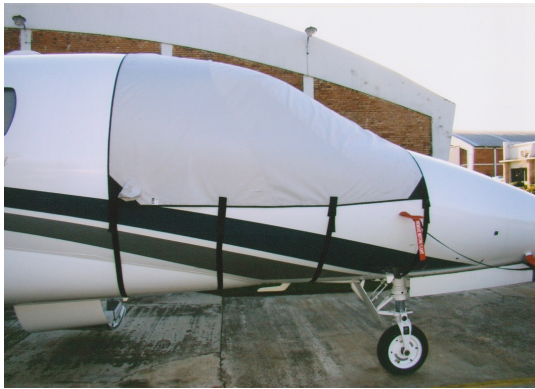
Citation XL Cockpit Cover

This cover type is made from Silver Acrylic Sunbrella canvas and is 100% lined with a soft and smooth microfiber. Bruce's Custom Covers developed this material combination especially for aircraft protection. The outer material is medium weight and treated for water resistance, UV resistance and anti-static buildup. The inner lining is a very soft and smooth microfiber to prevent scratching. The material is very reflective, and tests show that the cabin interior temperature can be reduced to near-ambient temperature on the hottest of days. It is water, ice and snow repellent, yet breathable to allow moisture to escape from between the cover and the aircraft surface.