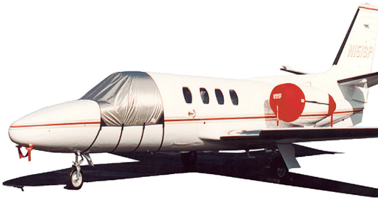
Cessna Citation I Windshield, Pitot and Engine Covers