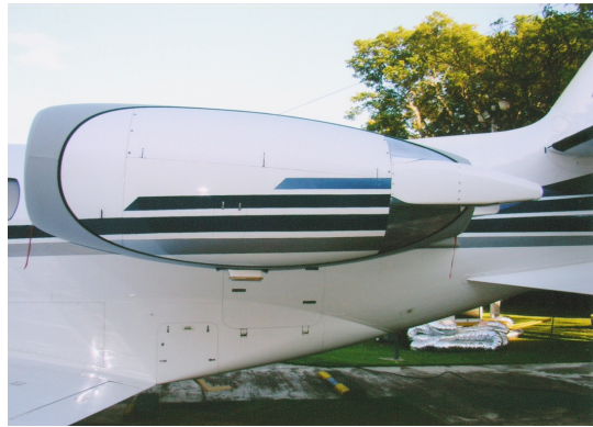
Citation XL Bikini Style Engine Covers