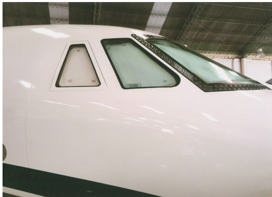
Citation XL Cockpit HeatShields

Cockpit Heatshields are interior sunshades for the aircraft's cockpit. The product is a unique composite of closed-cell foam with a silver mylar finish. The semi-rigid design is stiff enough to stand inside the window framing. The set folds up flat and is easily stored in the included storage sleeve. Some designs may require velcro and suction cups. Our Heatshields for jets are offered white side out because some aircraft manufacturers have issued advisories against reflective window inserts due to potential heat damage. A Heatshield is an excellent short-term remedy for cockpit overheating, but an external fabric cover is more effective for long-term protection.