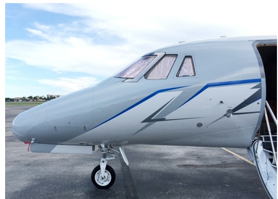
Cessna Citation 650 Cockpit HeataShields