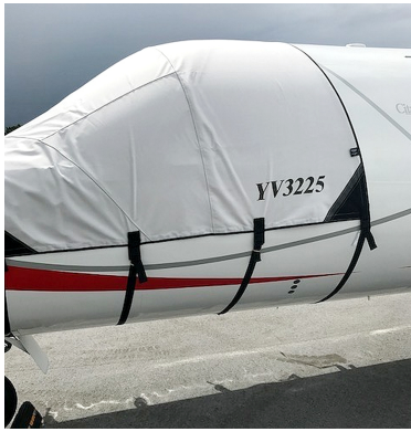
Cessna Citationjet V Ultra (560) Cockpit Cover