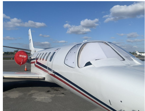
Cessna Citation S550