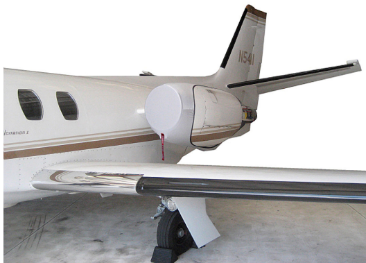
Cessna Citation "Bikini" Type Engine Covers: Extremely Light & Portable

The Cessna Citation VII (650) Intake/Exhaust Plugs are custom fit for the intake and exhaust openings, made with heavy-duty vinyl material, and stuffed with a single block of sculpted urethane foam. Each plug has a zipper that allows the foam to be removed and dried if necessary. Engine plugs have 'remove before flight' streamers sewn onto the face of the plugs. Most plugs are imprinted with the aircraft registration number in black. Engine plugs may be inserted after flight when the engine is still warm. Engine Inlet Plugs are commonly referred to as Cowl Plugs, Intake Plugs, Cowl Blocks, Engine Blocks, and Engine Bungs.