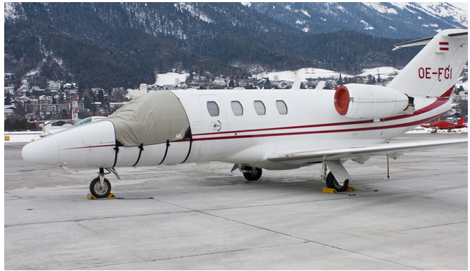
Cessna Citationjet CJ1 Cockpit Cover