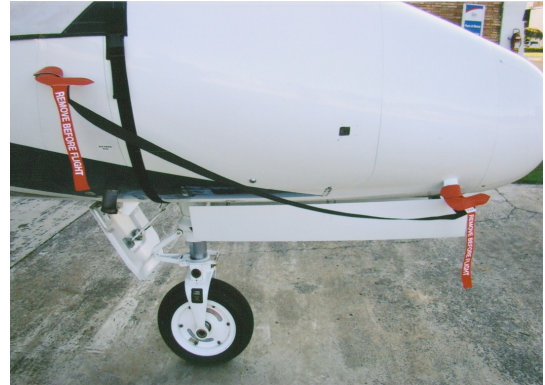
Citation XL Pitot Covers