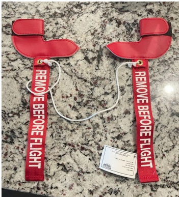
Cessna Citation Pitot Cover Set

The Engine Inlet Plugs are custom fit for your Cessna Citation VII (650) intakes, made with heavy-duty vinyl material, and stuffed with a single block of sculpted urethane foam. Each plug has a zipper that allows the foam to be removed and dried if necessary. Engine plugs have 'remove before flight' streamers sewn onto the face of the plugs. Most plugs are imprinted with the aircraft registration number in black for an extra charge. Storage bag NOT included. Engine plugs may be inserted after flight when the engine is still warm. Engine Inlet Plugs are commonly referred to as Cowl Plugs, Intake Plugs, Cowl Blocks, Engine Blocks, and Engine Bungs.