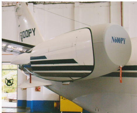
Citation XL Bikini Style Engine Covers

The Cessna Citation VII (650) Intake/Exhaust Plugs are custom fit for the intake and exhaust openings, made with heavy-duty vinyl material, and stuffed with a single block of sculpted urethane foam. Each plug has a zipper that allows the foam to be removed and dried if necessary. Engine plugs have 'remove before flight' streamers sewn onto the face of the plugs. Most plugs are imprinted with the aircraft registration number in black. Engine plugs may be inserted after flight when the engine is still warm. Engine Inlet Plugs are commonly referred to as Cowl Plugs, Intake Plugs, Cowl Blocks, Engine Blocks, and Engine Bungs.