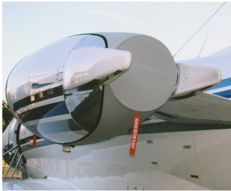
Citation XL Bikini Style Engine Covers

The Cessna Citation VII (650) Intake/Exhaust Plugs are custom fit for the intake and exhaust openings, made with heavy-duty vinyl material, and stuffed with a single block of sculpted urethane foam. Each plug has a zipper that allows the foam to be removed and dried if necessary. Engine plugs have 'remove before flight' streamers sewn onto the face of the plugs. Most plugs are imprinted with the aircraft registration number in black. Engine plugs may be inserted after flight when the engine is still warm. Engine Inlet Plugs are commonly referred to as Cowl Plugs, Intake Plugs, Cowl Blocks, Engine Blocks, and Engine Bungs.