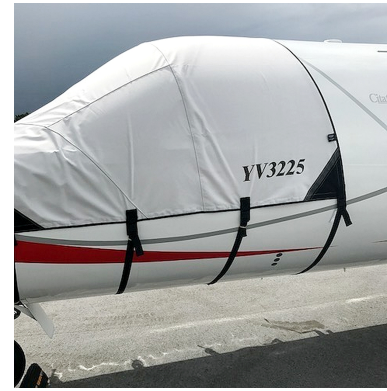
Cessna Citationjet V Ultra (560) Cockpit Cover