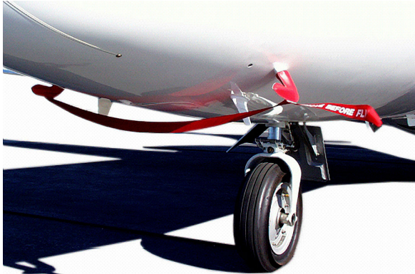
Cessna Citation I Pitot Covers

The Engine Inlet Plugs are custom fit for your Cessna Citation VII (650) intakes, made with heavy-duty vinyl material, and stuffed with a single block of sculpted urethane foam. Each plug has a zipper that allows the foam to be removed and dried if necessary. Engine plugs have 'remove before flight' streamers sewn onto the face of the plugs. Most plugs are imprinted with the aircraft registration number in black for an extra charge. Storage bag NOT included. Engine plugs may be inserted after flight when the engine is still warm. Engine Inlet Plugs are commonly referred to as Cowl Plugs, Intake Plugs, Cowl Blocks, Engine Blocks, and Engine Bungs.