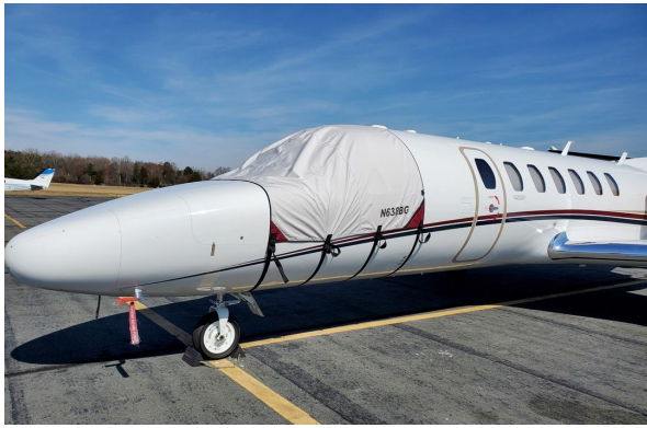
Cessna Citation 560 Cockpit Cover