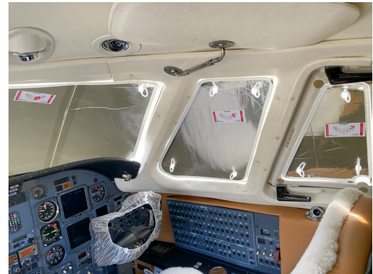
Cessna 650 Cockpit Heatshields (set of 6)