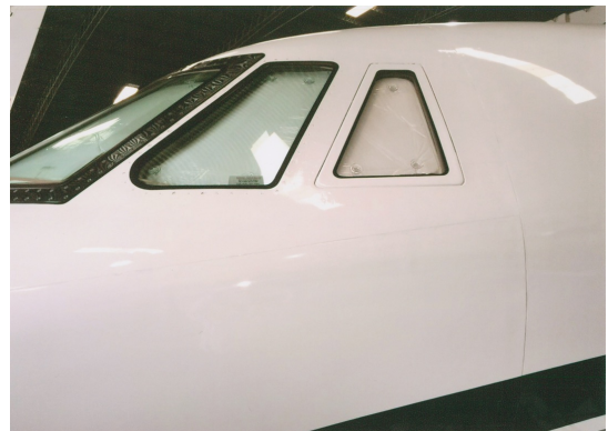
Citation XL Cockpit HeatShields