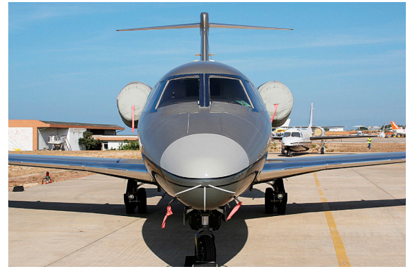
Cessna Citation "Bikini" Type Engine Covers: Extremely Light & Portable