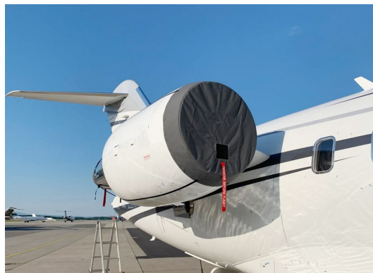
Canadair Challenger 604, 605, 650, 850 Intake/Exhaust Covers (OEM Design)