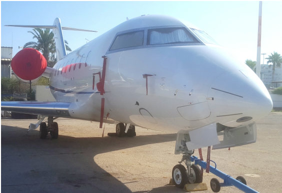
Canadair Challenger 604, 605, 650, 850 Intake Covers