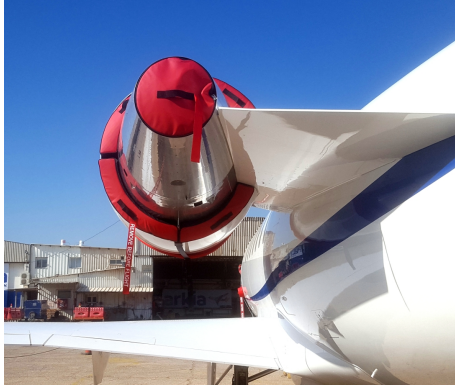
Canadair Challenger 604, 605, 650, 850 Exhaust Plugs

dried if necessary. Engine plugs have 'remove before flight' streamers sewn onto the face of the plugs. Most plugs are imprinted with the aircraft registration number in black for an extra charge. Storage bag NOT included. Engine plugs may be inserted after flight when the engine is still warm. Engine Inlet Plugs are commonly referred to as Cowl Plugs, Intake Plugs, Cowl Blocks, Engine Blocks, and Engine Bungs.