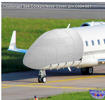
Challenger 601/604 Cockpit/Nose Cover, illustration

This cover type is made from Silver Acrylic Sunbrella canvas and is 100% lined with a soft and smooth microfiber. Bruce's Custom Covers developed this material combination especially for aircraft protection. The outer material is medium weight and treated for water resistance, UV resistance and anti-static buildup. The inner lining is a very soft and smooth microfiber to prevent scratching. The material is very reflective, and tests show that the cabin interior temperature can be reduced to near-ambient temperature on the hottest of days. It is water, ice and snow repellent, yet breathable to allow moisture to escape from between the cover and the aircraft surface.