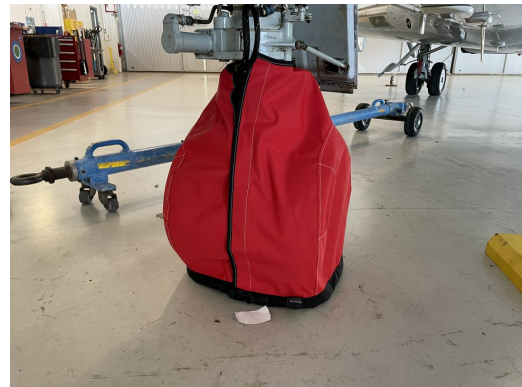
Canadair Challenger 605 Nose Gear Tire Cover