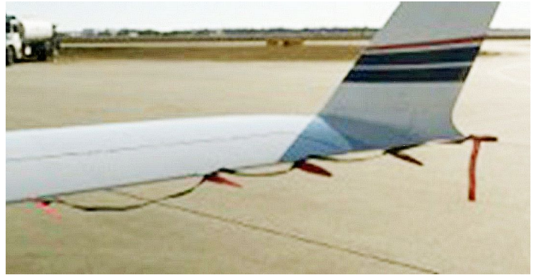
Static Wick Covers