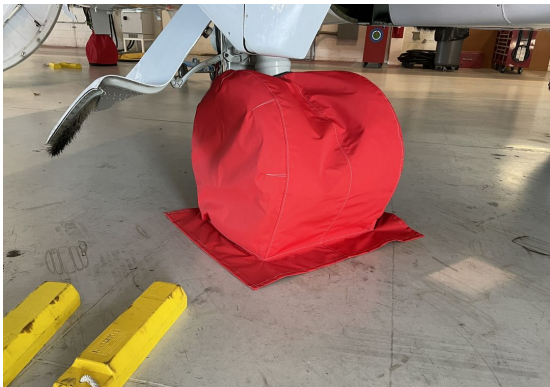
Canadair Challenger 605 Main Gear Tire Covers

ALL-YEAR USE MATERIAL - Made with Silver Acrylic Sunbrella canvas, the all-year use material is the best option for sun protection and cover longevity. This heavier more durable material is intended for all weather conditions, such as rain and snow or lots of sun.