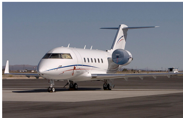
Challenger 604 Intake Covers, standard design