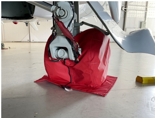
Canadair Challenger 605 Main Gear Tire Covers

ALL-YEAR USE MATERIAL - Made with Silver Acrylic Sunbrella canvas, the all-year use material is the best option for sun protection and cover longevity. This heavier more durable material is intended for all weather conditions, such as rain and snow or lots of sun.