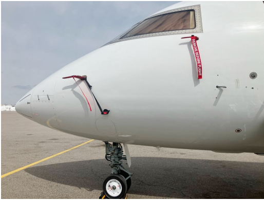
Challenger 650 Pitot & Ice Detector Covers

dried if necessary. Engine plugs have 'remove before flight' streamers sewn onto the face of the plugs. Most plugs are imprinted with the aircraft registration number in black for an extra charge. Storage bag NOT included. Engine plugs may be inserted after flight when the engine is still warm. Engine Inlet Plugs are commonly referred to as Cowl Plugs, Intake Plugs, Cowl Blocks, Engine Blocks, and Engine Bungs.