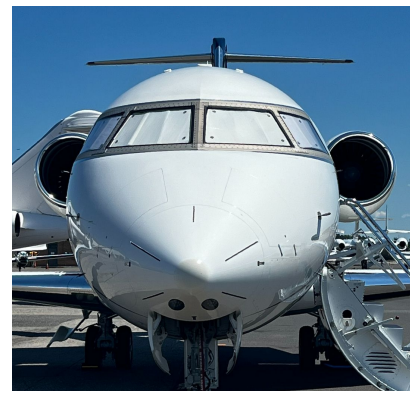
Bombardier CL-600-2B16 Cockpit Heatshields