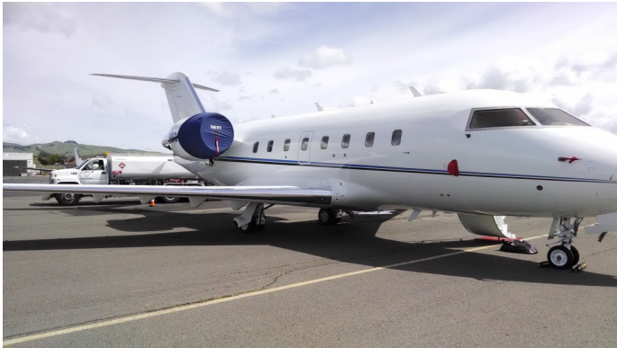
Challenger 604 Intake Covers

The Canadair Challenger 604, 605, 650, 850 Intake Covers are designed to install easily yet be completely storable. A spring steel hoop is sewn into the hem of each cover, allowing them to be installed without climbing onto the wing or using a stepladder. To store the covers the spring steel hoop folds like a band-saw blade into three nesting rings. Each cover folds into a compact circular bundle which is stored in the included duffle bag, yet they unfold quickly for use. The Tri-Fold Ring cover is made of medium weight nylon which is available in a variety of colors to match the paint trim. Each cover set comes complete with installation and folding instructions. The aircraft's registration number can be silkscreened onto the cover for an extra charge.