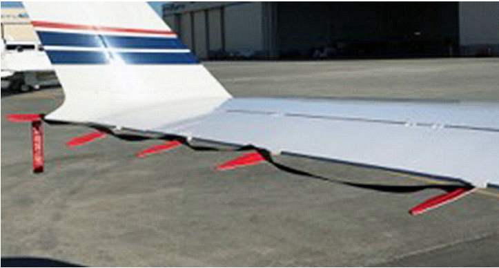
Canadair Challenger 604, 605, 650, 850 Rosemont Probe Covers