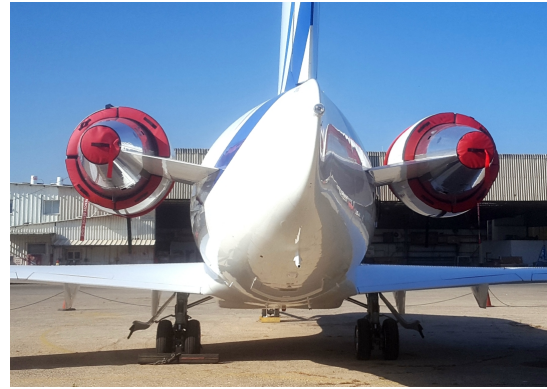
Canadair Challenger 604, 605, 650, 850 Exhaust Plugs