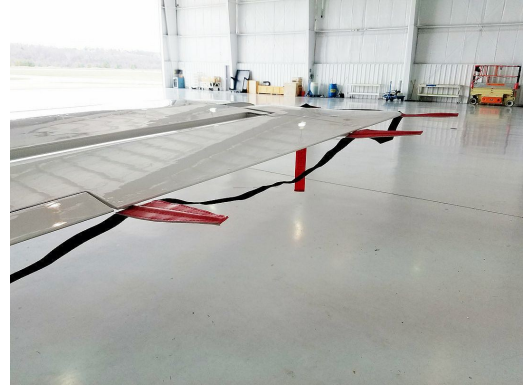
Hawker Beechcraft 800, 800XP, 850XP Static Wick Protectors