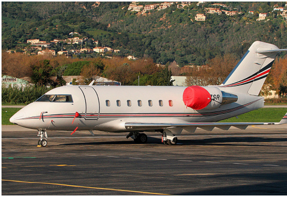
Challenger 601 Intake Covers, standard design