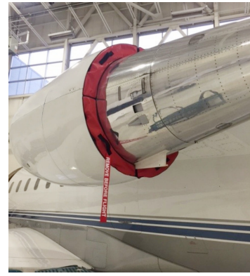
Canadair Challenger 604 Bypass Plugs