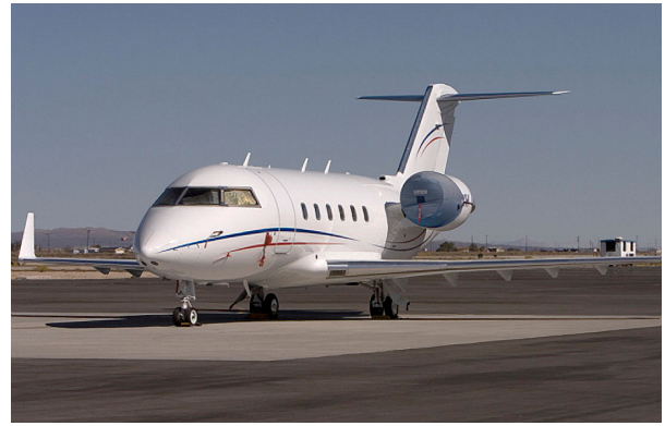
Challenger 604 Intake Covers, standard design