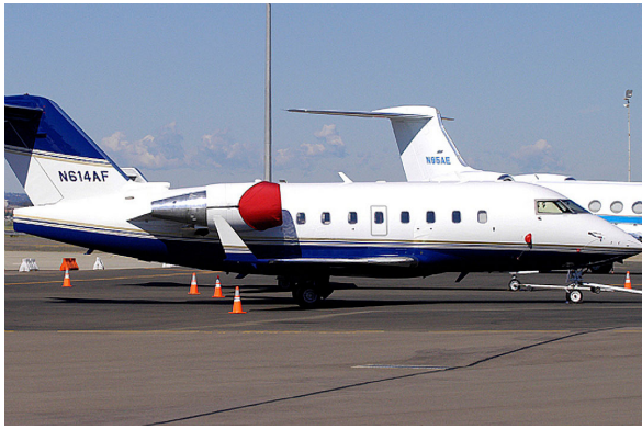
Challenger 604 Intake Covers, standard design