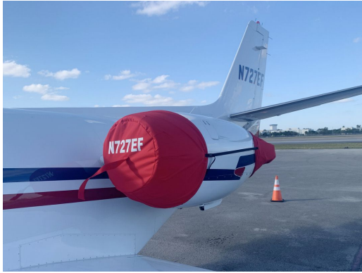
Cessna Citation S550

The Cessna Citation II Bravo Intake/Exhaust Plugs are custom fit for the intake and exhaust openings, made with heavy-duty vinyl material, and stuffed with a single block of sculpted urethane foam. Each plug has a zipper that allows the foam to be removed and dried if necessary. Engine plugs have 'remove before flight' streamers sewn onto the face of the plugs. Most plugs are imprinted with the aircraft registration number in black. Engine plugs may be inserted after flight when the engine is still warm. Engine Inlet Plugs are commonly referred to as Cowl Plugs, Intake Plugs, Cowl Blocks, Engine Blocks, and Engine Bungs.