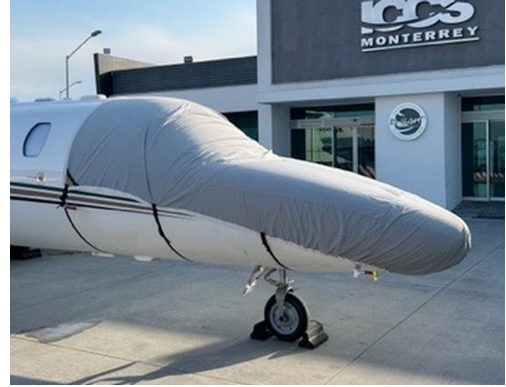
Cessna Citation Windshield Cover, Engine Cover set and Pitot Covers Cessna Citationjet 525B Travel Weight Cockpit/Nose Cover