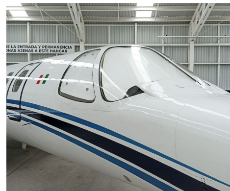
Cessna Citation I & II Cockpit HeatShields