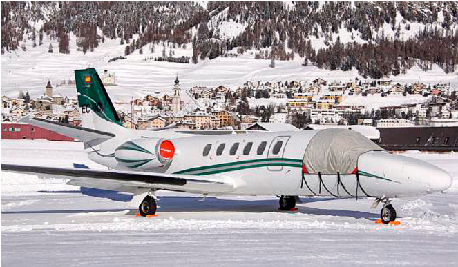
Cessna Citation 550 Windshield Cover