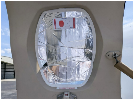
Citationjet Entrance Door Heatshield