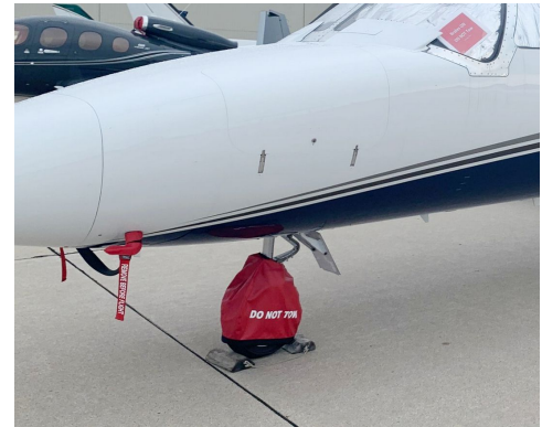
Cessna Citation Nose Tire Cover