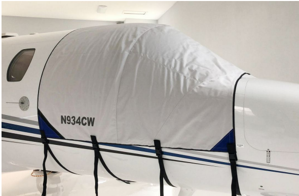
Cessna Citation M2 Cockpit Cover

This cover type is made from Silver Acrylic Sunbrella canvas and is 100% lined with a soft and smooth microfiber. Bruce's Custom Covers developed this material combination especially for aircraft protection. The outer material is medium weight and treated for water resistance, UV resistance and anti-static buildup. The inner lining is a very soft and smooth microfiber to prevent scratching. The material is very reflective, and tests show that the cabin interior temperature can be reduced to near-ambient temperature on the hottest of days. It is water, ice and snow repellent, yet breathable to allow moisture to escape from between the cover and the aircraft surface.