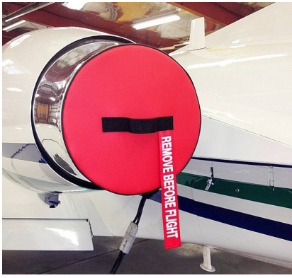
Cessna Citation S2 Exhaust Plugs