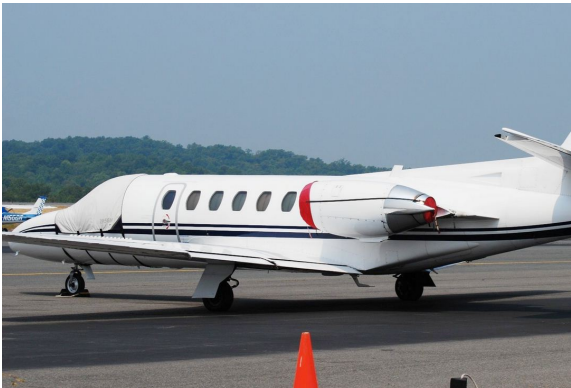
Cessna Citation II with TR's Exhaust Cover Illustration Cessna Citation S2 Cockpit Cover, Intake Covers & Exhaust Plugs