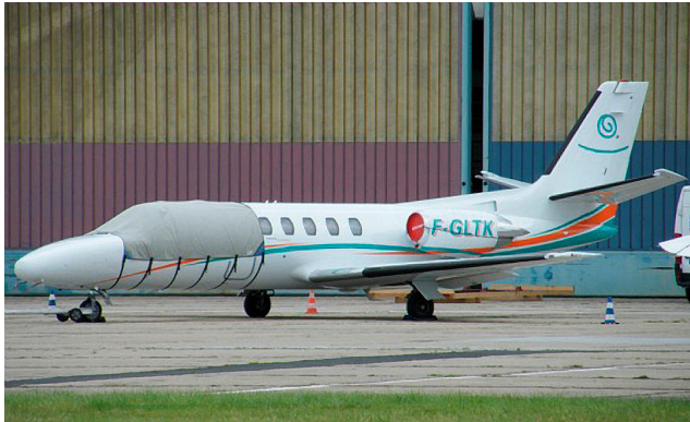
Citation Windshield Cover, to back of door

This cover type is made from Silver Acrylic Sunbrella canvas and is 100% lined with a soft and smooth microfiber. Bruce's Custom Covers developed this material combination especially for aircraft protection. The outer material is medium weight and treated for water resistance, UV resistance and anti-static buildup. The inner lining is a very soft and smooth microfiber to prevent scratching. The material is very reflective, and tests show that the cabin interior temperature can be reduced to near-ambient temperature on the hottest of days. It is water, ice and snow repellent, yet breathable to allow moisture to escape from between the cover and the aircraft surface.