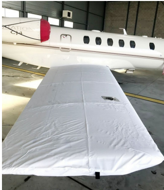
Cessna Citation CJ-4 Wing Covers, test fit cover

WINTER USE MATERIAL - Made with Solution-Dyed Polyester fabric, this option is intended for seasonal use to aid in deicing, rain mitigation, or for occasional travel. The material is lighter and more compact, but more susceptible to UV damage and may have a shorter useful life if used continuously outside than the all-year use material.