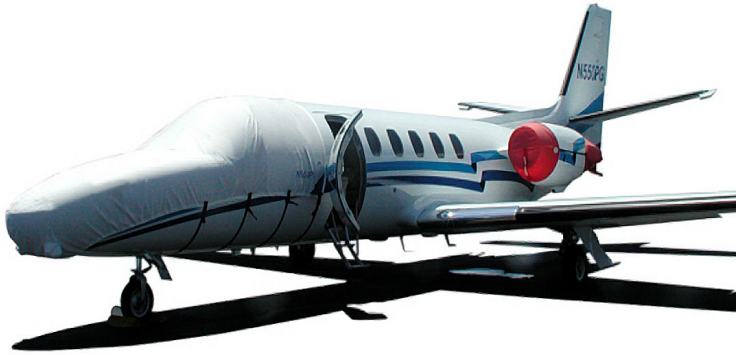
Cessna Citation Nose/Cockpit Cover, Engine Covers

This cover type is made from Silver Acrylic Sunbrella canvas and is 100% lined with a soft and smooth microfiber. Bruce's Custom Covers developed this material combination especially for aircraft protection. The outer material is medium weight and treated for water resistance, UV resistance and anti-static buildup. The inner lining is a very soft and smooth microfiber to prevent scratching. The material is very reflective, and tests show that the cabin interior temperature can be reduced to near-ambient temperature on the hottest of days. It is water, ice and snow repellent, yet breathable to allow moisture to escape from between the cover and the aircraft surface.