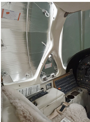
Cessna Citation I & II Cockpit HeatShields

Custom-made Heatshield Sunshades are available for almost any window in the jet. Side windows, Skylights, and Emergency Exits are all custom-made. The product is a unique composite of closed-cell foam with a silver mylar finish. The set is easily stored in the included storage sleeve. Some designs may require velcro and suction cups. Our Heatshields are offered white side out since aircraft manufacturers have issued advisories against reflective window inserts due to potential heat damage.