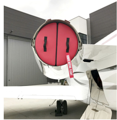
Cessna Citation 680 Exhaust Plugs, folding type