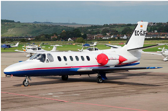
Cessna Citation II Engine Covers, Pitot Covers

The Cessna Citationjet V Ultra & Encore Models Intake/Exhaust Plugs are custom fit for the intake and exhaust openings, made with heavy-duty vinyl material, and stuffed with a single block of sculpted urethane foam. Each plug has a zipper that allows the foam to be removed and dried if necessary. Engine plugs have 'remove before flight' streamers sewn onto the face of the plugs. Most plugs are imprinted with the aircraft registration number in black. Engine plugs may be inserted after flight when the engine is still warm. Engine Inlet Plugs are commonly referred to as Cowl Plugs, Intake Plugs, Cowl Blocks, Engine Blocks, and Engine Bungs.