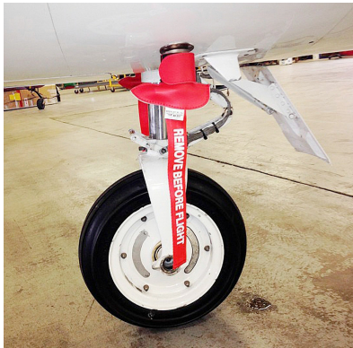
Rosemount Probe Cover

The Engine Inlet Plugs are custom fit for your Cessna Citationjet V Ultra & Encore Models intakes, made with heavy-duty vinyl material, and stuffed with a single block of sculpted urethane foam. Each plug has a zipper that allows the foam to be removed and dried if necessary. Engine plugs have 'remove before flight' streamers sewn onto the face of the plugs. Most plugs are imprinted with the aircraft registration number in black for an extra charge. Storage bag NOT included. Engine plugs may be inserted after flight when the engine is still warm. Engine Inlet Plugs are commonly referred to as Cowl Plugs, Intake Plugs, Cowl Blocks, Engine Blocks, and Engine Bung.