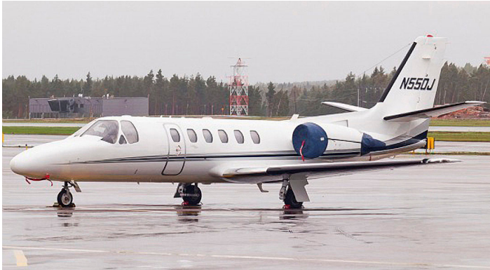
Cessna Citation Bravo Engine Covers and Pitot Covers sets

The Cessna Citationjet V Ultra & Encore Models Intake/Exhaust Plugs are custom fit for the intake and exhaust openings, made with heavy-duty vinyl material, and stuffed with a single block of sculpted urethane foam. Each plug has a zipper that allows the foam to be removed and dried if necessary. Engine plugs have 'remove before flight' streamers sewn onto the face of the plugs. Most plugs are imprinted with the aircraft registration number in black. Engine plugs may be inserted after flight when the engine is still warm. Engine Inlet Plugs are commonly referred to as Cowl Plugs, Intake Plugs, Cowl Blocks, Engine Blocks, and Engine Bungs.