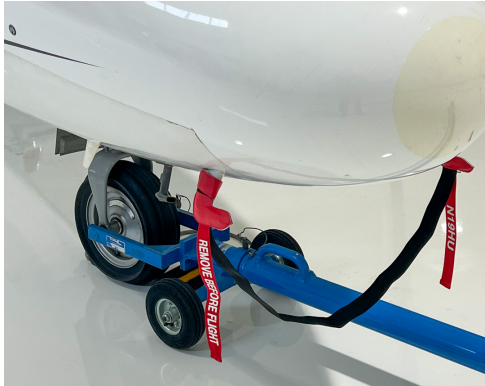
Cessna Citationjet V Ultra (560) Exhaust Plugs

The Engine Inlet Plugs are custom fit for your Cessna Citationjet V Ultra & Encore Models intakes, made with heavy-duty vinyl material, and stuffed with a single block of sculpted urethane foam. Each plug has a zipper that allows the foam to be removed and dried if necessary. Engine plugs have 'remove before flight' streamers sewn onto the face of the plugs. Most plugs are imprinted with the aircraft registration number in black for an extra charge. Storage bag NOT included. Engine plugs may be inserted after flight when the engine is still warm. Engine Inlet Plugs are commonly referred to as Cowl Plugs, Intake Plugs, Cowl Blocks, Engine Blocks, and Engine Bungs.