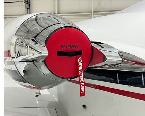
Citationjet V Ultra (560) Exhaust Plugs (set of 2)