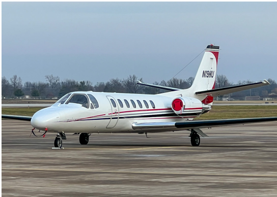
Citationjet V Ultra (560) Exhaust Plugs (set of 2)