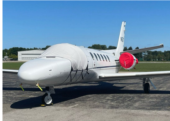
Cessna 550 Citation II