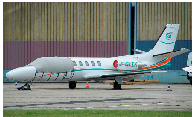
Citation Windshield Cover, to back of door