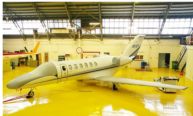
Cessna Citationjet CJ3 Cockpit/Nose, Engine &amp; Wings Travel Covers