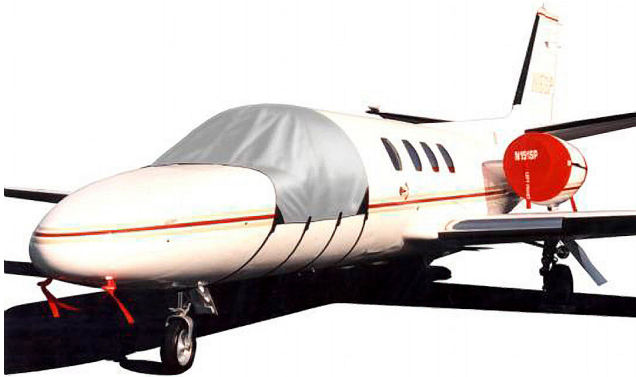
Citation Windshield Cover, Engine Cover set and Pitot Covers

The Cessna Citation II (550, 551, UC-35A, with JT15D) Intake Covers are designed to install easily yet be completely storable. A spring steel hoop is sewn into the hem of each cover, allowing them to be installed without climbing onto the wing or using a stepladder. To store the covers the spring steel hoop folds like a band-saw blade into three nesting rings. Each cover folds into a compact circular bundle which is stored in the included duffle bag, yet they unfold quickly for use. The Tri-Fold Ring cover is made of medium weight nylon which is available in a variety of colors to match the paint trim. Each cover set comes complete with installation and folding instructions. The aircraft's registration number can be silkscreened onto the cover for an extra charge.