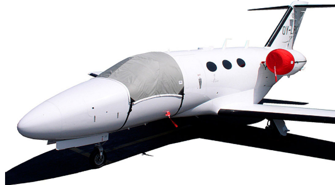
Cessna 510 Cockpit Cover extends to cover door Citation Mustang Windshield Cover, Intake Cover/Exhaust Plug Set, Pitot Covers