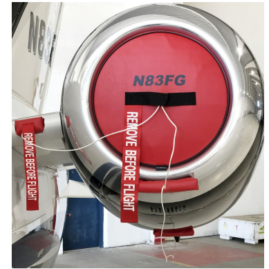
Cessna Citation Mustang 510 Engine Plugs