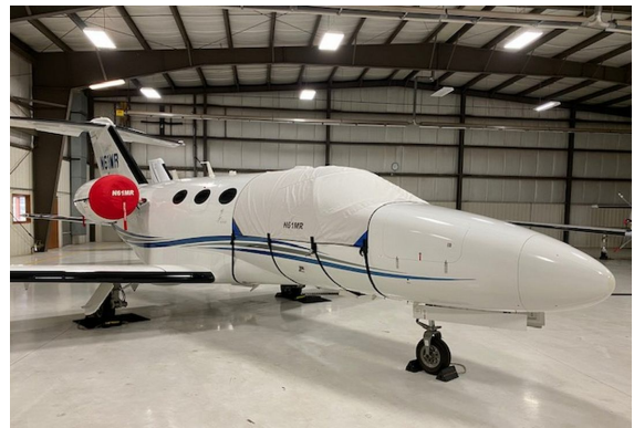
Cessna 510 Cockpit Cover extends to cover door