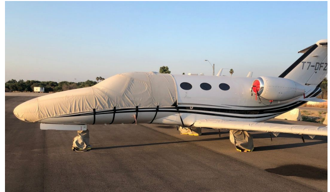
Cessna 510 Mustang Cockpit/Nose Cover, Engine Inlet Plugs