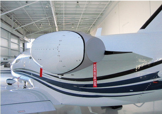
Citation S550 Complete Nacelle Cover, 3D model Citation Mustang Intake/Exhaust Cover, "Bikini" Type and leading edge Pylon inlet plugs