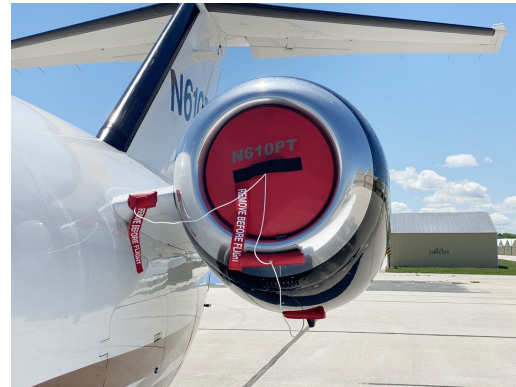
Cessna Citation Mustang 510 Engine Inlet Plugs, set of 8