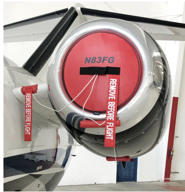
Cessna Mustang 510 Engine Inlet Plugs, Includes Intercooler Intake & Exhaust And Gen. Plugs

The Engine Inlet Plugs are custom fit for your Cessna Mustang 510 intakes, made with heavy-duty vinyl material, and stuffed with a single block of sculpted urethane foam. Each plug has a zipper that allows the foam to be removed and dried if necessary. Engine plugs have 'remove before flight' streamers sewn onto the face of the plugs. Most plugs are imprinted with the aircraft registration number in black for an extra charge. Storage bag NOT included. Engine plugs may be inserted after flight when the engine is still warm. Engine Inlet Plugs are commonly referred to as Cowl Plugs, Intake Plugs, Cowl Blocks, Engine Blocks, and Engine Bungs.