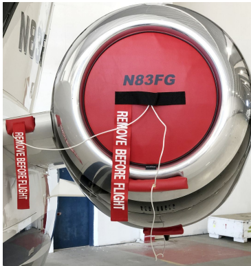
Cessna Citation Mustang 510 Engine Plugs

The Engine Inlet Plugs are custom fit for your Cessna Mustang 510 intakes, made with heavy-duty vinyl material, and stuffed with a single block of sculpted urethane foam. Each plug has a zipper that allows the foam to be removed and dried if necessary. Engine plugs have 'remove before flight' streamers sewn onto the face of the plugs. Most plugs are imprinted with the aircraft registration number in black for an extra charge. Storage bag NOT included. Engine plugs may be inserted after flight when the engine is still warm. Engine Inlet Plugs are commonly referred to as Cowl Plugs, Intake Plugs, Cowl Blocks, Engine Blocks, and Engine Bunges.