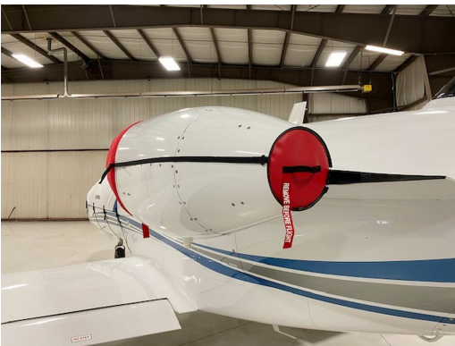
Cessna 510 Engine Inlet Covers & Exhaust Plugs

The Engine Inlet Plugs are custom fit for your Cessna Mustang 510 intakes, made with heavy-duty vinyl material, and stuffed with a single block of sculpted urethane foam. Each plug has a zipper that allows the foam to be removed and dried if necessary. Engine plugs have 'remove before flight' streamers sewn onto the face of the plugs. Most plugs are imprinted with the aircraft registration number in black for an extra charge. Storage bag NOT included. Engine plugs may be inserted after flight when the engine is still warm. Engine Inlet Plugs are commonly referred to as Cowl Plugs, Intake Plugs, Cowl Blocks, Engine Blocks, and Engine Bungs.