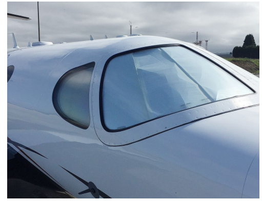
Cessna Mustang 510 Cockpit Heatshields