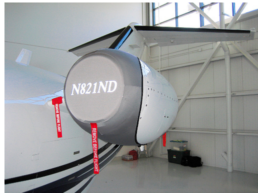
Citation Mustang Intake/Exhaust Cover, "Bikini" Type and leading edge Pylon inlet plugs