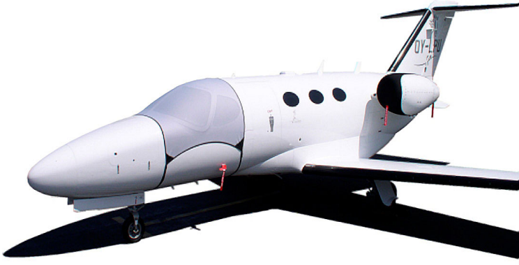
Citation Mustang Light Weight Travel Windshield Cover, "Bikini" type Engine Cover Set