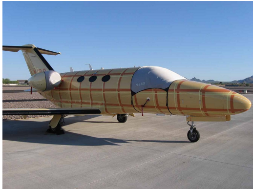
Citation Mustang Light Weight Windshield & Engine Covers

This cover type is made from Silver Acrylic Sunbrella canvas and is 100% lined with a soft and smooth microfiber. Bruce's Custom Covers developed this material combination especially for aircraft protection. The outer material is medium weight and treated for water resistance, UV resistance and anti-static buildup. The inner lining is a very soft and smooth microfiber to prevent scratching. The material is very reflective, and tests show that the cabin interior temperature can be reduced to near-ambient temperature on the hottest of days. It is water, ice and snow repellent, yet breathable to allow moisture to escape from between the cover and the aircraft surface.