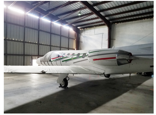
Cessna Citation II Cockpit Cover, Wing Covers