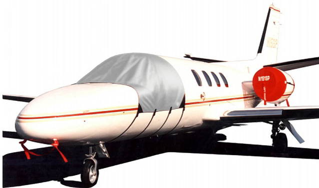
Cessna Citation Windshield Cover, Engine Cover set and Pitot Covers

The Engine Inlet Plugs are custom fit for your Cessna Citation I (500/501) intakes, made with heavy-duty vinyl material, and stuffed with a single block of sculpted urethane foam. Each plug has a zipper that allows the foam to be removed and dried if necessary. Engine plugs have 'remove before flight' streamers sewn onto the face of the plugs. Most plugs are imprinted with the aircraft registration number in black for an extra charge. Storage bag NOT included. Engine plugs may be inserted after flight when the engine is still warm. Engine Inlet Plugs are commonly referred to as Cowl Plugs, Intake Plugs, Cowl Blocks, Engine Blocks, and Engine Bungs.