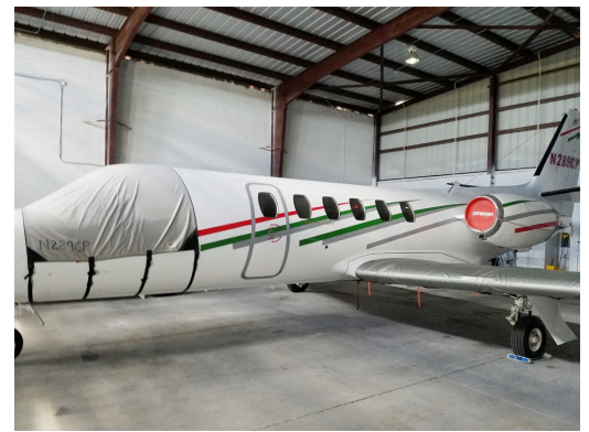
Cessna Citation II Cockpit Cover, Wing Covers