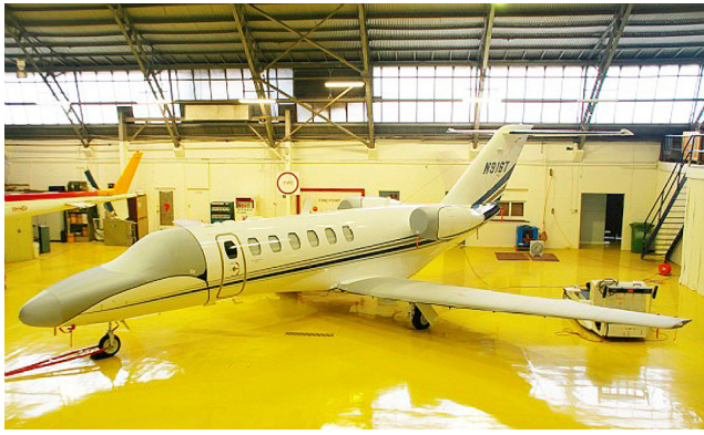
Cessna Citationjet CJ3 Cockpit/Nose, Engine & Wings Travel Covers