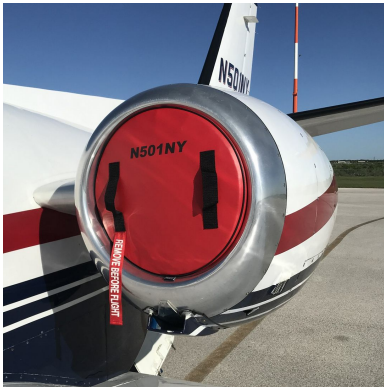
Citation 501 Intake/Exhaust Plug Set

The Engine Inlet Plugs are custom fit for your Cessna Citation I (500/501) intakes, made with heavy-duty vinyl material, and stuffed with a single block of sculpted urethane foam. Each plug has a zipper that allows the foam to be removed and dried if necessary. Engine plugs have 'remove before flight' streamers sewn onto the face of the plugs. Most plugs are imprinted with the aircraft registration number in black for an extra charge. Storage bag NOT included. Engine plugs may be inserted after flight when the engine is still warm. Engine Inlet Plugs are commonly referred to as Cowl Plugs, Intake Plugs, Cowl Blocks, Engine Blocks, and Engine Bungs.