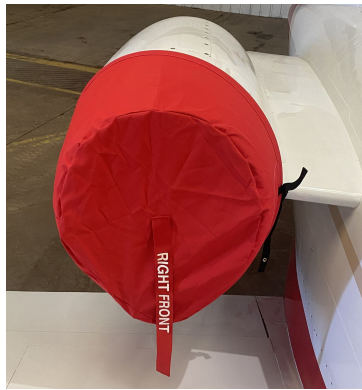
Cessna 501 Engine Covers NO TR's

The Cessna Citation I (500/501) Intake Covers are designed to install easily yet be completely storable. A spring steel hoop is sewn into the hem of each cover, allowing them to be installed without climbing onto the wing or using a stepladder. To store the covers the spring steel hoop folds like a band-saw blade into three nesting rings. Each cover folds into a compact circular bundle which is stored in the included duffle bag, yet they unfold quickly for use. The Tri-Fold Ring cover is made of medium weight nylon which is available in a variety of colors to match the paint trim. Each cover set comes complete with installation and folding instructions. The aircraft's registration number can be silkscreened onto the cover for an extra charge.