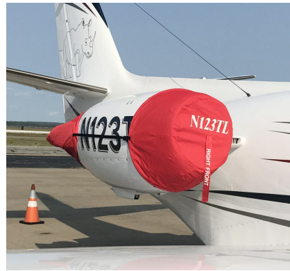
Cessna Citation S/II (S550) Engine Covers (With Tr's)