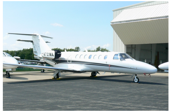
Cessna Citation CJ3 Bikini Style Engine Covers