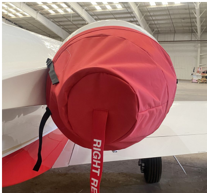
Cessna 501 Engine Covers NO TR's

The Cessna Citation I (500/501) Intake Covers are designed to install easily yet be completely storable. A spring steel hoop is sewn into the hem of each cover, allowing them to be installed without climbing onto the wing or using a stepladder. To store the covers the spring steel hoop folds like a band-saw blade into three nesting rings. Each cover folds into a compact circular bundle which is stored in the included duffle bag, yet they unfold quickly for use. The Tri-Fold Ring cover is made of medium weight nylon which is available in a variety of colors to match the paint trim. Each cover set comes complete with installation and folding instructions. The aircraft's registration number can be silkscreened onto the cover for an extra charge.