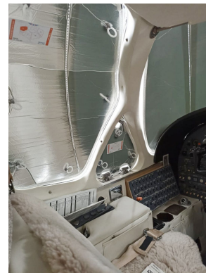
Cessna Citation I & II Cockpit HeatShields