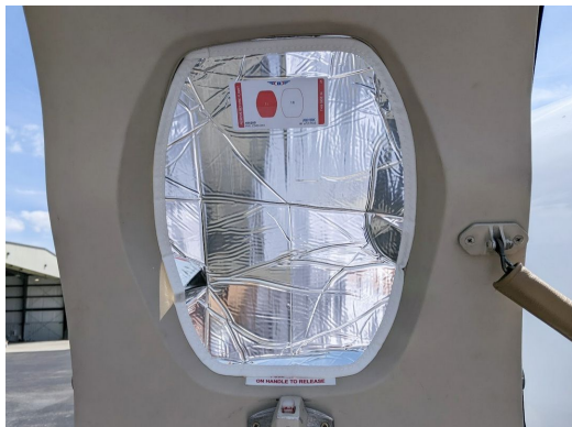
Citationjet Entrance Door Heatshield

Custom-made Heatshield Sunshades are available for almost any window in the jet. Side windows, Skylights, and Emergency Exits are all custom-made. The product is a unique composite of closed-cell foam with a silver mylar finish. The set is easily stored in the included storage sleeve. Some designs may require velcro and suction cups. Our Heatshields are offered white side out since aircraft manufacturers have issued advisories against reflective window inserts due to potential heat damage.