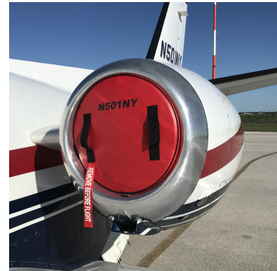
Citation 501 Intake/Exhaust Plug Set