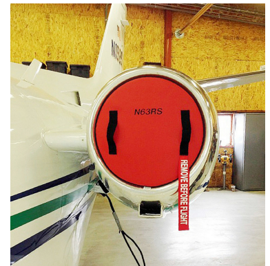
Cessna Citation S2 Intake Plugs