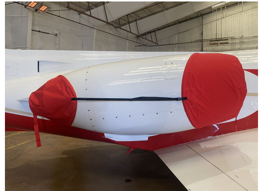
Cessna 501 Engine Covers NO TR's