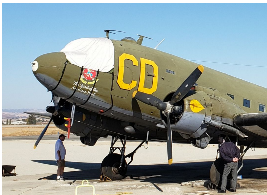
Douglas DC-3 Cockpit Cover