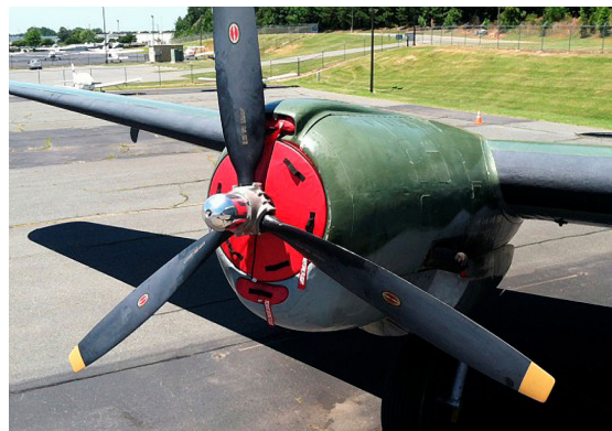
C-46 Radial Engine Intake Plug