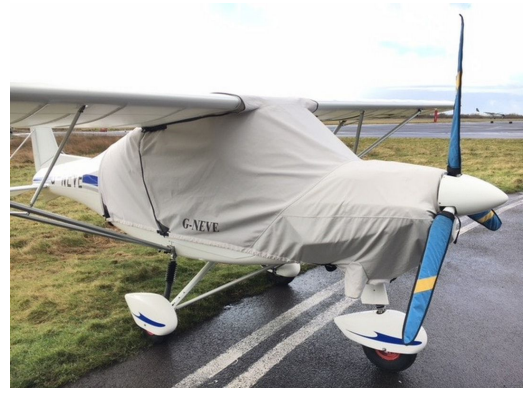
Ikarus C-42 Extended Canopy/Engine Cover