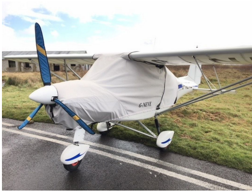
Ikarus C-42 Extended Canopy/Engine Cover