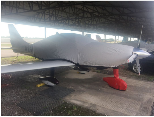
Lancair Columbia Extended Canopy/Engine Cover, Nose Wheelpant Cover

protection and cover longevity. This heavier more durable material is intended for all weather conditions, such as rain and snow or lots of sun.