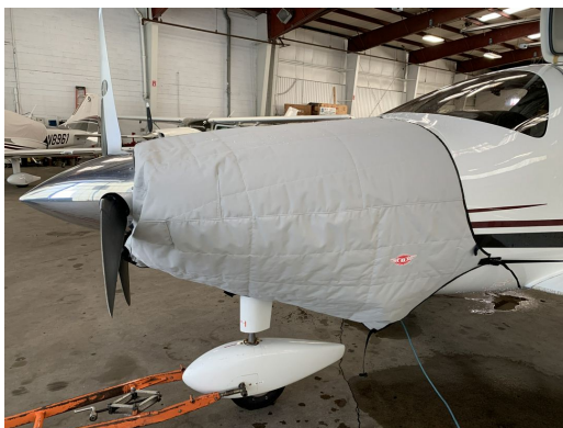
Cessna Corvalis Insulated Engine Cover

This cover type is made from Silver Acrylic Sunbrella canvas and is 100% lined with a soft and smooth microfiber. Bruce's Custom Covers developed this material combination especially for aircraft protection. The outer material is medium weight and treated for water resistance, UV resistance and anti-static buildup. The inner lining is a very soft and smooth microfiber to prevent scratching. The material is very reflective, and tests show that the cabin interior temperature can be reduced to near-ambient temperature on the hottest of days. It is water, ice and snow repellent, yet breathable to allow moisture to escape from between the cover and the aircraft surface.