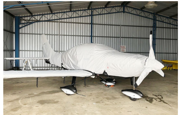
Columbia 350 Full Cover Set