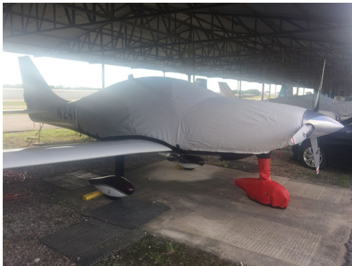
Lancair Columbia Extended Canopy/Engine Cover, Nose Wheelpant Cover

This cover type is made from Silver Acrylic Sunbrella canvas and is 100% lined with a soft and smooth microfiber. Bruce's Custom Covers developed this material combination especially for aircraft protection. The outer material is medium weight and treated for water resistance, UV resistance and anti-static buildup. The inner lining is a very soft and smooth microfiber to prevent scratching. The material is very reflective, and tests show that the cabin interior temperature can be reduced to near-ambient temperature on the hottest of days. It is water, ice and snow repellent, yet breathable to allow moisture to escape from between the cover and the aircraft surface.