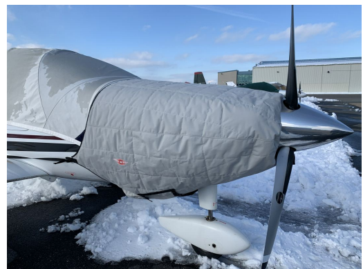
Cessna Corvalis Insulated Engine Cover