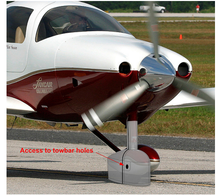
Nose Wheelpant/Strut Cover (illustration)