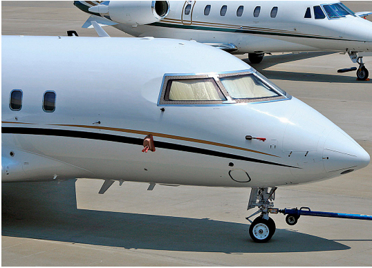
Challenger 604 Cockpit HeatShields