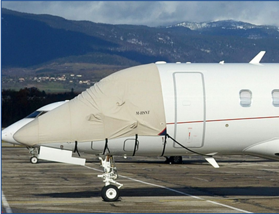
Challenger 300 Cockpit/Nose Cover