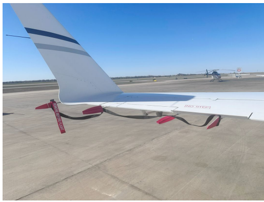
Canadair Challenger 300 Static Wick Covers