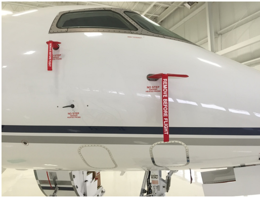
Challenger 300 Pitot Covers