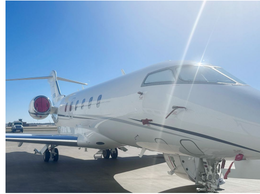
Canadair Challenger 300 Cockpit HeatShields, Intake Plugs