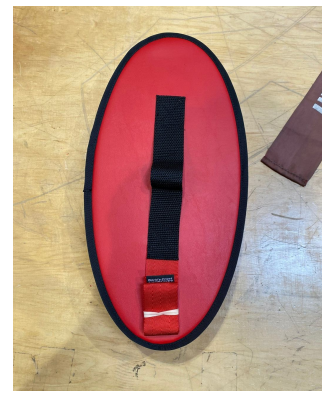
Canadair Challenger 300, 350 APU Exhaust Plug