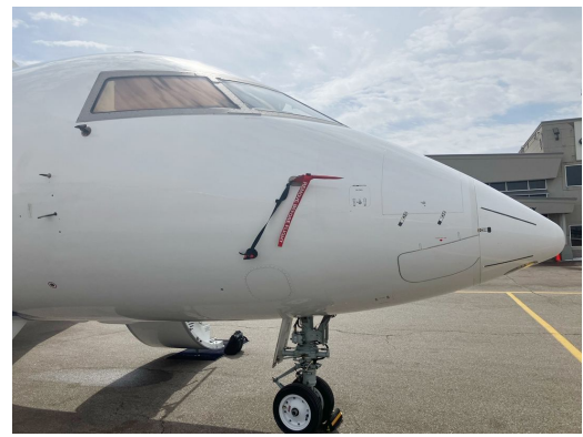
Challenger 650 Pitot & Ice Detector Covers