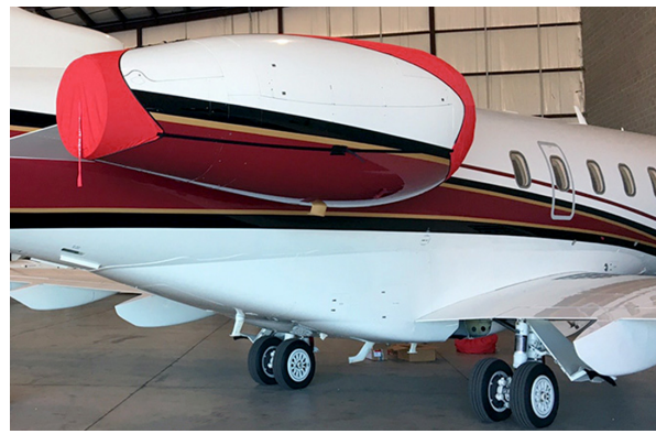
Intake/Exhaust Covers, 3-Strap Type. Successfully installed by two crew, one ladder.