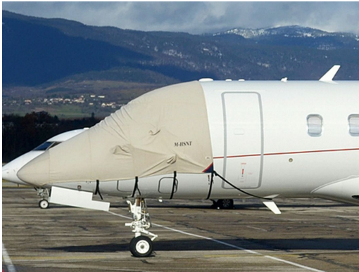
Challenger 300 Cockpit/Nose Cover

This cover type is made from Silver Acrylic Sunbrella canvas and is 100% lined with a soft and smooth microfiber. Bruce's Custom Covers developed this material combination especially for aircraft protection. The outer material is medium weight and treated for water resistance, UV resistance and anti-static buildup. The inner lining is a very soft and smooth microfiber to prevent scratching. The material is very reflective, and tests show that the cabin interior temperature can be reduced to near-ambient temperature on the hottest of days. It is water, ice and snow repellent, yet breathable to allow moisture to escape from between the cover and the aircraft surface.