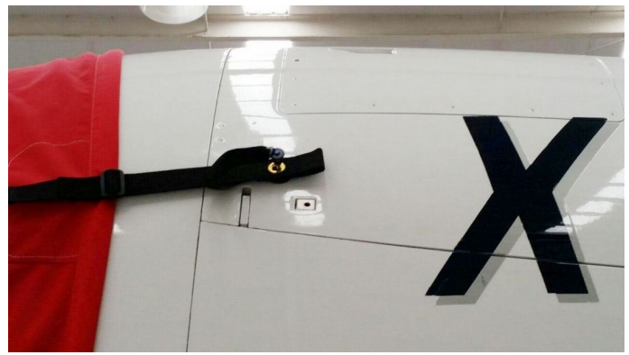
Challenger 300 Intake Covers