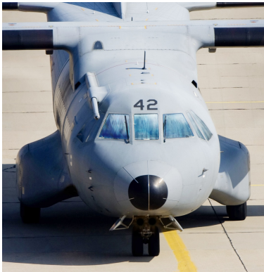
Casa C-295 Cockpit HeatShields (illustration)

This cover type is made from Silver Acrylic Sunbrella canvas and is 100% lined with a soft and smooth microfiber. Bruce's Custom Covers developed this material combination especially for aircraft protection. The outer material is medium weight and treated for water resistance, UV resistance and anti-static buildup. The inner lining is a very soft and smooth microfiber to prevent scratching. The material is very reflective, and tests show that the cabin interior temperature can be reduced to near-ambient temperature on the hottest of days. It is water, ice and snow repellent, yet breathable to allow moisture to escape from between the cover and the aircraft surface.