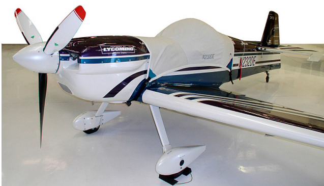
Canopy Cover for the Cap 232