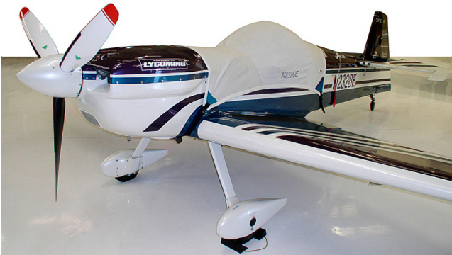
Canopy Cover for the Cap 232