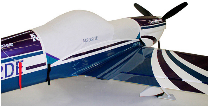
Cap 232 Canopy Cover

Travel Covers are made with Silver Solution-Dyed Polyester fabric and only lined over the windshield to save weight. The material is lightweight and more compact for easy stowage in the aircraft. The polyester material is water resistant, but only intended for occasional use outside. We also have an ultra lightweight material available for fitted hangar dust covers. For daily outdoor use, the non-travel Sunbrella Cover is the best choice.