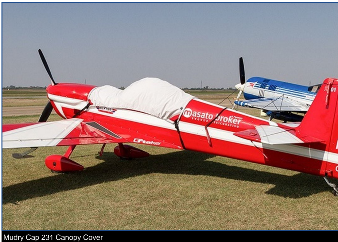
Mudry Cap 231 Canopy Cover