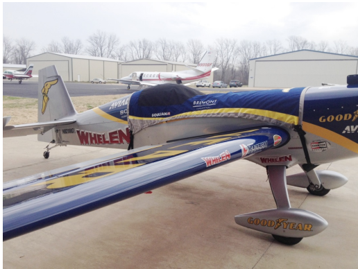
Extra 300SC with NASCAR style custom cover

The Mudry Cap 231 & 232 Canopy/Engine Cover is a one-piece cover (100% lined with microfiber) that is a combination of the Canopy Cover and Engine Cover. This cover will enclose the engine cowl and will extend aft to cover all of the windows. This cover type is made from Silver Acrylic Sunbrella canvas and is 100% lined with a soft and smooth microfiber. Bruce's Custom Covers developed this material combination especially for aircraft protection. The outer material is medium weight and treated for water resistance, UV resistance and anti-static buildup. The inner lining is a very soft and smooth microfiber to prevent scratching. The material is very reflective, and tests show that the cabin interior temperature can be reduced to near-ambient temperature on the hottest of days. It is water, ice and snow repellent, yet breathable to allow moisture to escape from between the cover and the aircraft surface.