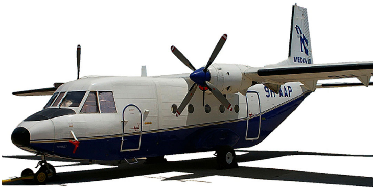
Casa 212 Engine Plugs

Engine Inlet Plugs are custom fit for your Casa 212 Aviocar intakes, made with heavy-duty vinyl material, and stuffed with a single block of sculpted urethane foam. Each plug has a zipper that allows the foam to be removed and dried if necessary. Engine plugs have warning flags that are visible from the cockpit or 'remove before flight' streamers sewn onto the face of the plugs. Most plugs are imprinted with the aircraft registration number in black for an extra charge. Storage bag NOT included. Engine plugs may be inserted after flight when the engine is still warm. Engine Inlet Plugs are commonly referred to as Cowl Plugs, Intake Plugs, Cowl Blocks, Engine Blocks, and Engine Bungs.