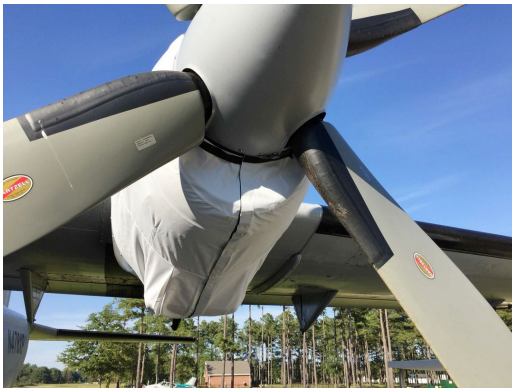
Casa 212 Engine Cover, test fit cover

This cover type is made from Silver Acrylic Sunbrella canvas and is 100% lined with a soft and smooth microfiber. Bruce's Custom Covers developed this material combination especially for aircraft protection. The outer material is medium weight and treated for water resistance, UV resistance and anti-static buildup. The inner lining is a very soft and smooth microfiber to prevent scratching. The material is very reflective, and tests show that the cabin interior temperature can be reduced to near-ambient temperature on the hottest of days. It is water, ice and snow repellent, yet breathable to allow moisture to escape from between the cover and the aircraft surface.