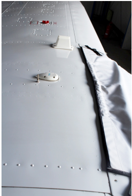
Cessna 206 Stationair Canopy Cover, Wrap-Around