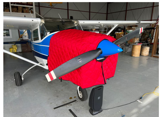
Cessna 182 Insulated Engine Cover ext. to l.e of nose gear, Extended Canopy Cover Insulated Hangar Blanket on Cessna 182