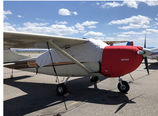
Cessna 206 Insulated Engine Cover, Canopy Cover