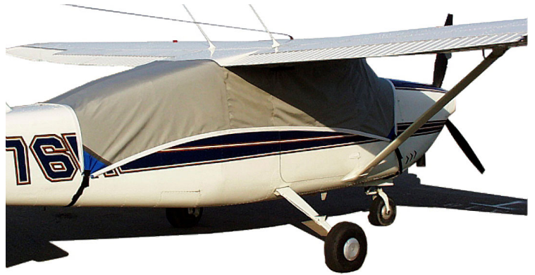
Cessna 206 Wrap-Around Canopy Cover