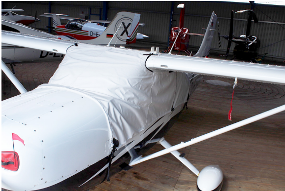
Cessna 206 Stationair Canopy Cover, Wrap-Around

This cover type is made from Silver Acrylic Sunbrella canvas and is 100% lined with a soft and smooth microfiber. Bruce's Custom Covers developed this material combination especially for aircraft protection. The outer material is medium weight and treated for water resistance, UV resistance and anti-static buildup. The inner lining is a very soft and smooth microfiber to prevent scratching. The material is very reflective, and tests show that the cabin interior temperature can be reduced to near-ambient temperature on the hottest of days. It is water, ice and snow repellent, yet breathable to allow moisture to escape from between the cover and the aircraft surface.