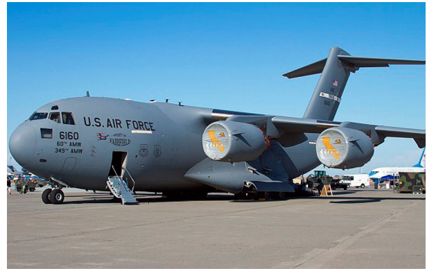
C-17 Engine Intake Covers and Exhaust Covers