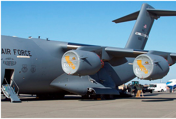
C-17 Intake Covers and Exhaust Covers