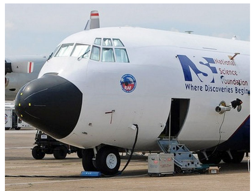
Lockheed C-130 Flight Deck HeatShield Set