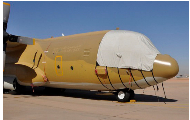
C-130 Cockpit Cover (Windshield/Flight Deck)