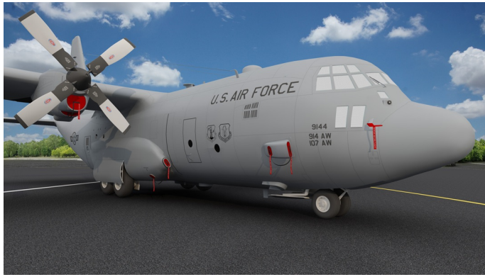
C-130 Engine Plugs (illustration)