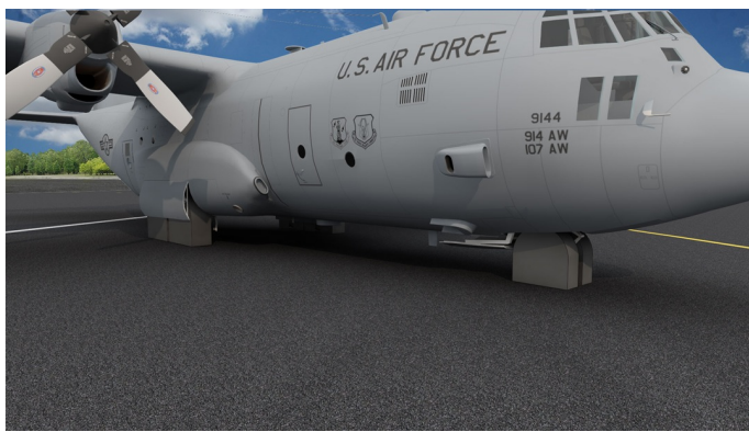
C-130 Tire Covers

ALL-YEAR USE MATERIAL - Made with Silver Acrylic Sunbrella canvas, the all-year use material is the best option for sun protection and cover longevity. This heavier more durable material is intended for all weather conditions, such as rain and snow or lots of sun.