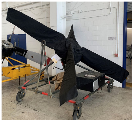
Lockheed C-130 Prop Cover, without spinner

This cover type is made from Silver Acrylic Sunbrella canvas and is 100% lined with a soft and smooth microfiber. Bruce's Custom Covers developed this material combination especially for aircraft protection. The outer material is medium weight and treated for water resistance, UV resistance and anti-static buildup. The inner lining is a very soft and smooth microfiber to prevent scratching. The material is very reflective, and tests show that the cabin interior temperature can be reduced to near-ambient temperature on the hottest of days. It is water, ice and snow repellent, yet breathable to allow moisture to escape from between the cover and the aircraft surface.