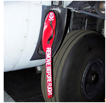
C-130 GTC Tailpipe Plug