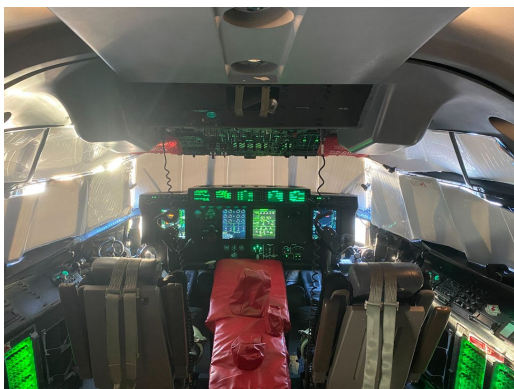
Lockheed C-130 Hercules Flight Deck HeatShield Set

Windshield and Skylight Heatshields are interior sunshades for an aircraft's front windshield and overhead window. The product is a unique composite of closed-cell foam with a silver mylar finish. The semi-rigid design is stiff enough to stand along the inside of the windshield using sun visors or window framing. It folds up flat and easily stores in the included storage sleeve. Some designs may require velcro and suction cups or split right and left sides. A Heatshield is an excellent short-term remedy for cockpit overheating. An external fabric cover is far more effective and practical for long-term protection.