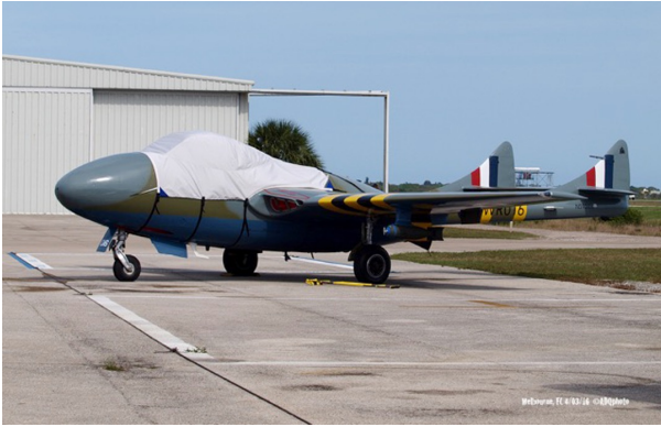
DeHavilland Vampire Canopy Cover

Travel Covers are made with Silver Solution-Dyed Polyester fabric and only lined over the windshield to save weight. The material is lightweight and more compact for easy stowage in the aircraft. The polyester material is water resistant, but only intended for occasional use outside. We also have an ultra lightweight material available for fitted hangar dust covers. For daily outdoor use, the non-travel Sunbrella Cover is the best choice.