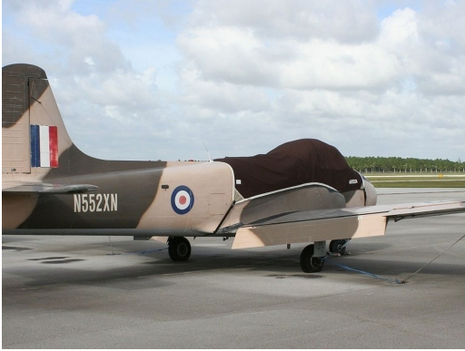
Jet Provost Canopy Cover

This cover type is made from Silver Acrylic Sunbrella canvas and is 100% lined with a soft and smooth microfiber. Bruce's Custom Covers developed this material combination especially for aircraft protection. The outer material is medium weight and treated for water resistance, UV resistance and anti-static buildup. The inner lining is a very soft and smooth microfiber to prevent scratching. The material is very reflective, and tests show that the cabin interior temperature can be reduced to near-ambient temperature on the hottest of days. It is water, ice and snow repellent, yet breathable to allow moisture to escape from between the cover and the aircraft surface.