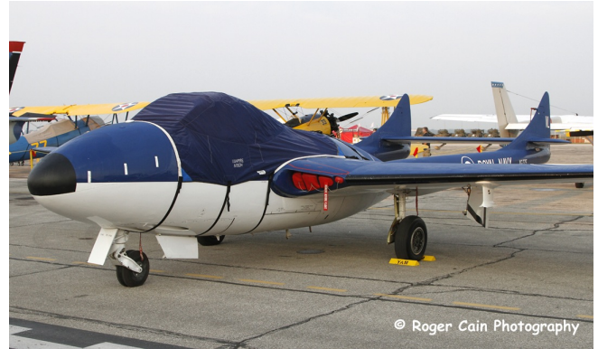
DeHavilland Vampire Canopy Cover, Engine Plugs