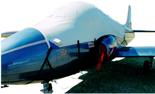
Covers & Plugs for the Jet Provost

Travel Covers are made with Silver Solution-Dyed Polyester fabric and only lined over the windshield to save weight. The material is lightweight and more compact for easy stowage in the aircraft. The polyester material is water resistant, but only intended for occasional use outside. We also have an ultra lightweight material available for fitted hangar dust covers. For daily outdoor use, the non-travel Sunbrella Cover is the best choice.