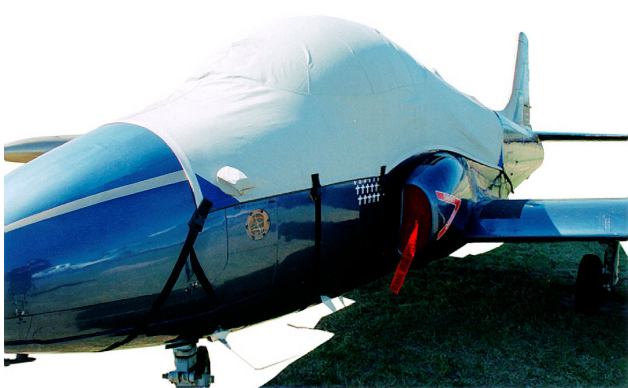
Covers & Plugs for the Jet Provost