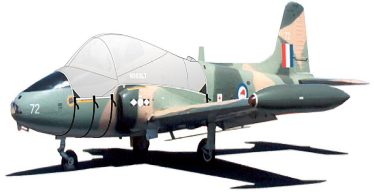
Jet Provost Canopy Cover (Illustration)