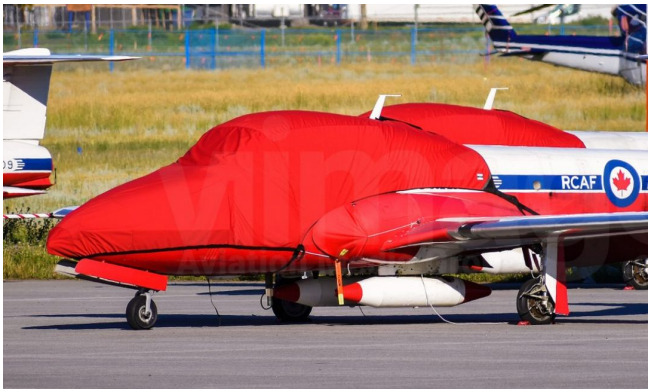
Canadair CT-114 Canopy/Nose Cover