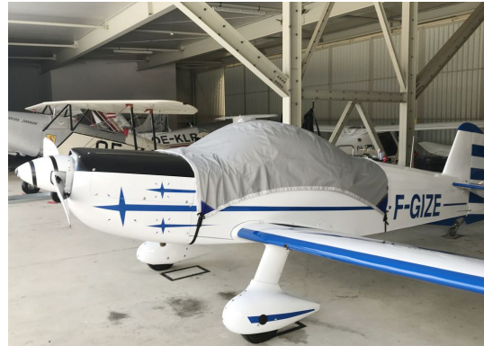
Mudry Cap 10 Travel Cover, Light Weight Travel Canopy Cover