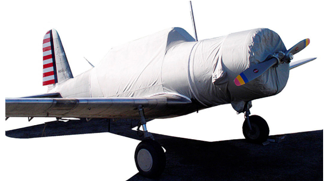
BT-13 Extended Canopy & Engine Covers