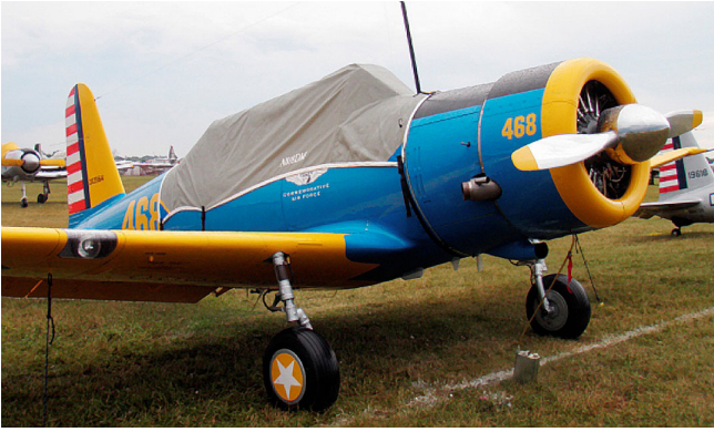
BT-13 Canopy Cover

non-travel Sunbrella Cover is the best choice.