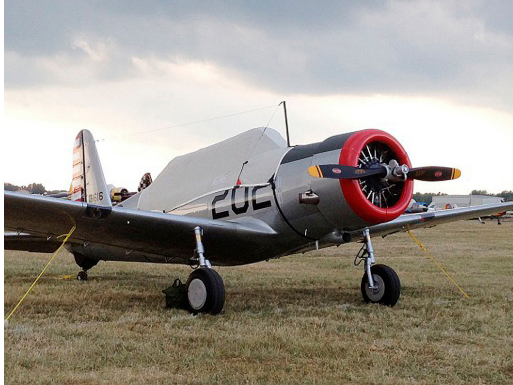
BT-13 Canopy Cover

This cover type is made from Silver Acrylic Sunbrella canvas and is 100% lined with a soft and smooth microfiber. Bruce's Custom Covers developed this material combination especially for aircraft protection. The outer material is medium weight and treated for water resistance, UV resistance and anti-static buildup. The inner lining is a very soft and smooth microfiber to prevent scratching. The material is very reflective, and tests show that the cabin interior temperature can be reduced to near-ambient temperature on the hottest of days. It is water, ice and snow repellent, yet breathable to allow moisture to escape from between the cover and the aircraft surface.