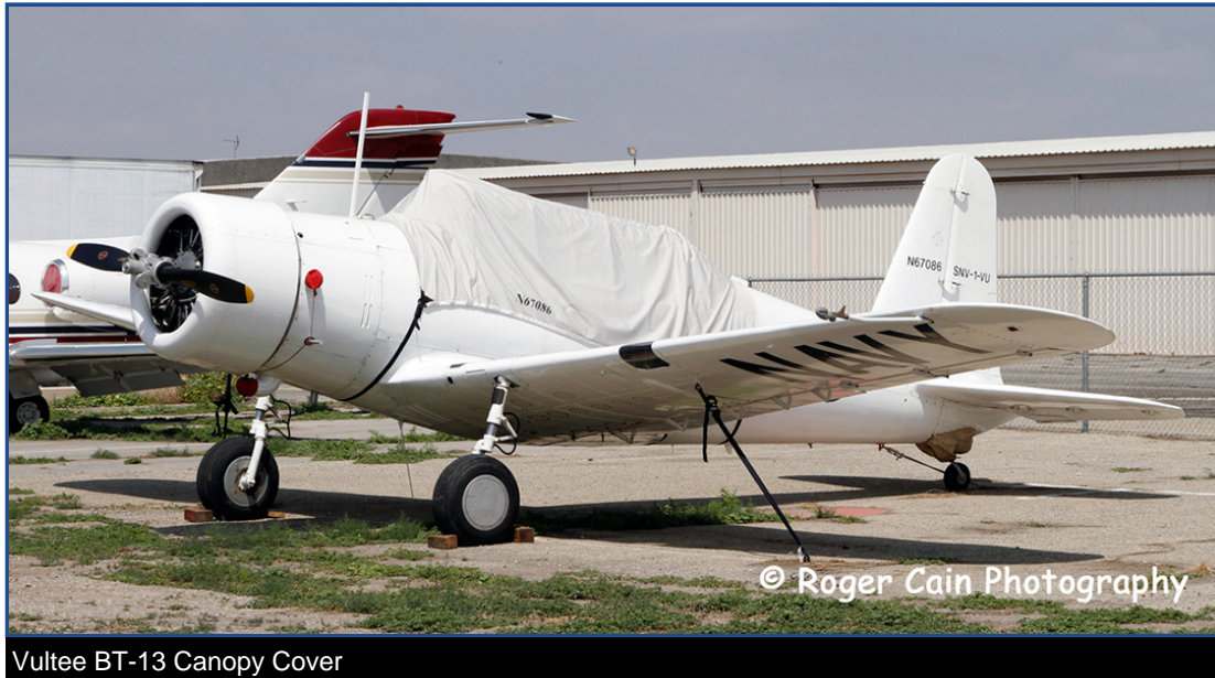
Vultee BT-13 Canopy Cover