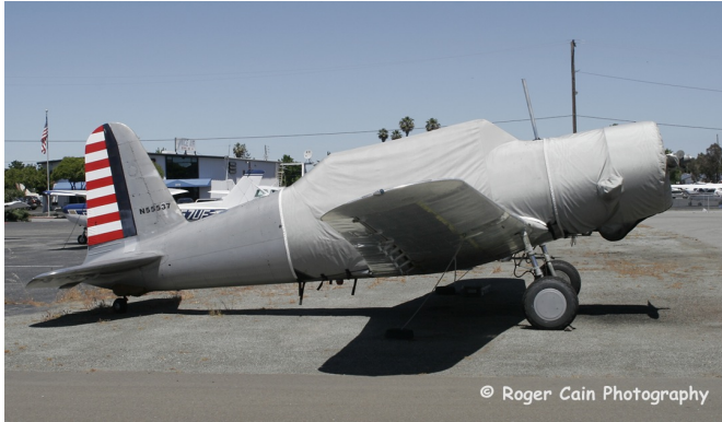
BT-13 Extended Canopy & Engine Covers

This cover type is made from Silver Acrylic Sunbrella canvas and is 100% lined with a soft and smooth microfiber. Bruce's Custom Covers developed this material combination especially for aircraft protection. The outer material is medium weight and treated for water resistance, UV resistance and anti-static buildup. The inner lining is a very soft and smooth microfiber to prevent scratching. The material is very reflective, and tests show that the cabin interior temperature can be reduced to near-ambient temperature on the hottest of days. It is water, ice and snow repellent, yet breathable to allow moisture to escape from between the cover and the aircraft surface.