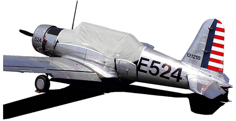
BT-13 Canopy Cover