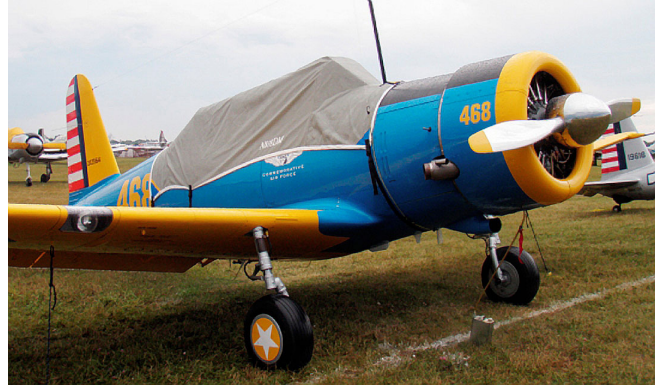
BT-13 Canopy Cover