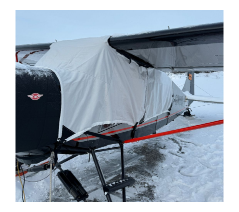
Bushmaster Canopy & Insulated Engine Covers