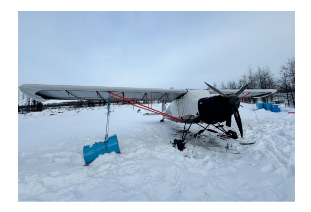
Bushmaster Wing, Canopy & Insulated Engine Covers

WINTER USE MATERIAL - Made with Solution-Dyed Polyester fabric, this option is intended for seasonal use to aid in deicing, rain mitigation, or for occasional travel. The material is lighter and more compact, but more susceptible to UV damage and may have a shorter useful life if used continuously outside than the all-year use material.