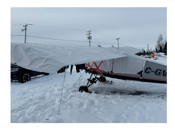
Bushmaster Wing Covers, Canopy Cover