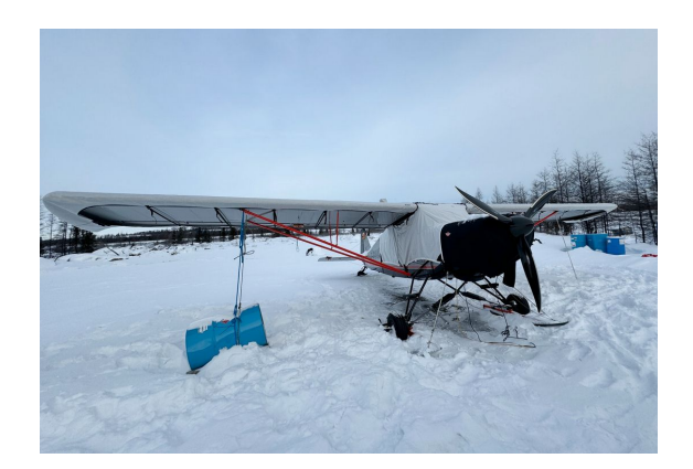
Bushmaster Wing, Canopy & Insulated Engine Covers

This cover type is made from Silver Acrylic Sunbrella canvas and is 100% lined with a soft and smooth microfiber. Bruce's Custom Covers developed this material combination especially for aircraft protection. The outer material is medium weight and treated for water resistance, UV resistance and anti-static buildup. The inner lining is a very soft and smooth microfiber to prevent scratching. The material is very reflective, and tests show that the cabin interior temperature can be reduced to near-ambient temperature on the hottest of days. It is water, ice and snow repellent, yet breathable to allow moisture to escape from between the cover and the aircraft surface.