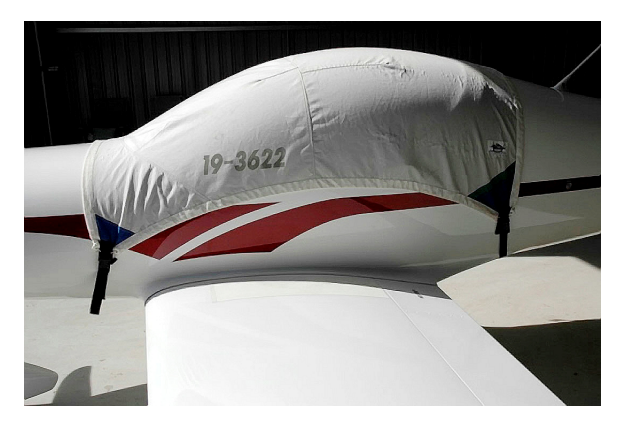
Pulsar Canopy Cover