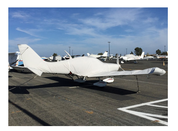
BRM Bristell S-LSA Full Cover Set

WINTER USE MATERIAL - Made with Solution-Dyed Polyester fabric, this option is intended for seasonal use to aid in deicing, rain mitigation, or for occasional travel. The material is lighter and more compact, but more susceptible to UV damage and may have a shorter useful life if used continuously outside than the all-year use material.