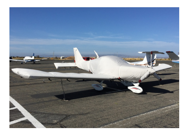
BRM Bristell S-LSA Full Cover Set