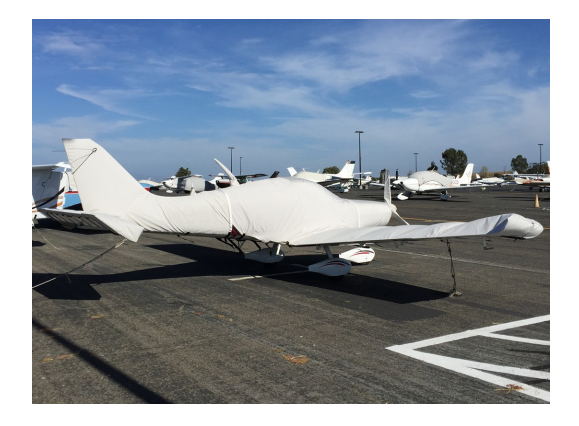
BRM Bristell S-LSA Full Cover Set

This cover type is made from Silver Acrylic Sunbrella canvas and is 100% lined with a soft and smooth microfiber. Bruce's Custom Covers developed this material combination especially for aircraft protection. The outer material is medium weight and treated for water resistance, UV resistance and anti-static buildup. The inner lining is a very soft and smooth microfiber to prevent scratching. The material is very reflective, and tests show that the cabin interior temperature can be reduced to near-ambient temperature on the hottest of days. It is water, ice and snow repellent, yet breathable to allow moisture to escape from between the cover and the aircraft surface.