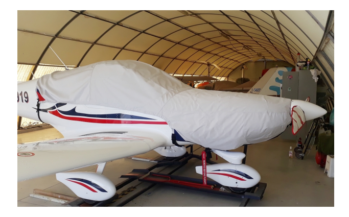
BRM Aero Bristell S-LSA Canopy/Engine Cover

This cover type is made from Silver Acrylic Sunbrella canvas and is 100% lined with a soft and smooth microfiber. Bruce's Custom Covers developed this material combination especially for aircraft protection. The outer material is medium weight and treated for water resistance, UV resistance and anti-static buildup. The inner lining is a very soft and smooth microfiber to prevent scratching. The material is very reflective, and tests show that the cabin interior temperature can be reduced to near-ambient temperature on the hottest of days. It is water, ice and snow repellent, yet breathable to allow moisture to escape from between the cover and the aircraft surface.