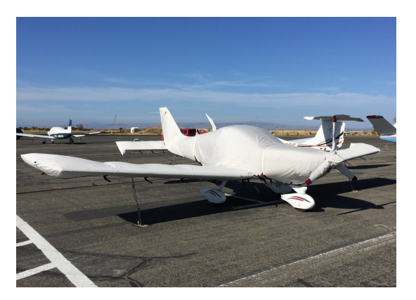
BRM Bristell S-LSA Full Cover Set