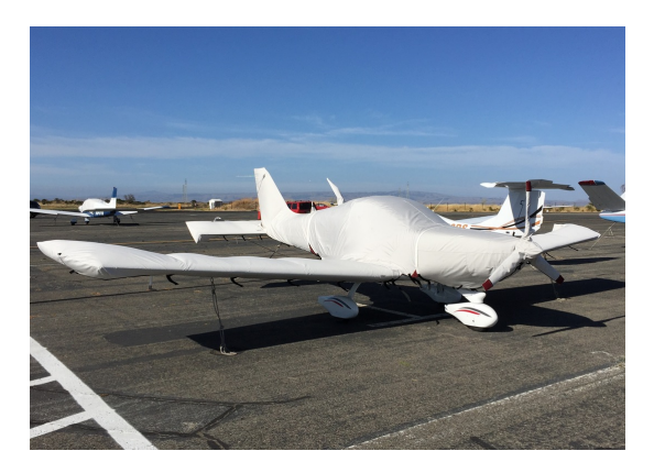
BRM Bristell S-LSA Full Cover Set

Designed to prevent damage to the aircraft extremities in crowded hangars, these products are made of bright red Naugahyde and thickly padded with a sandwich of closed cell foam.