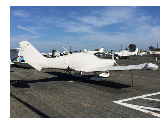
BRM Bristell S-LSA Full Cover Set