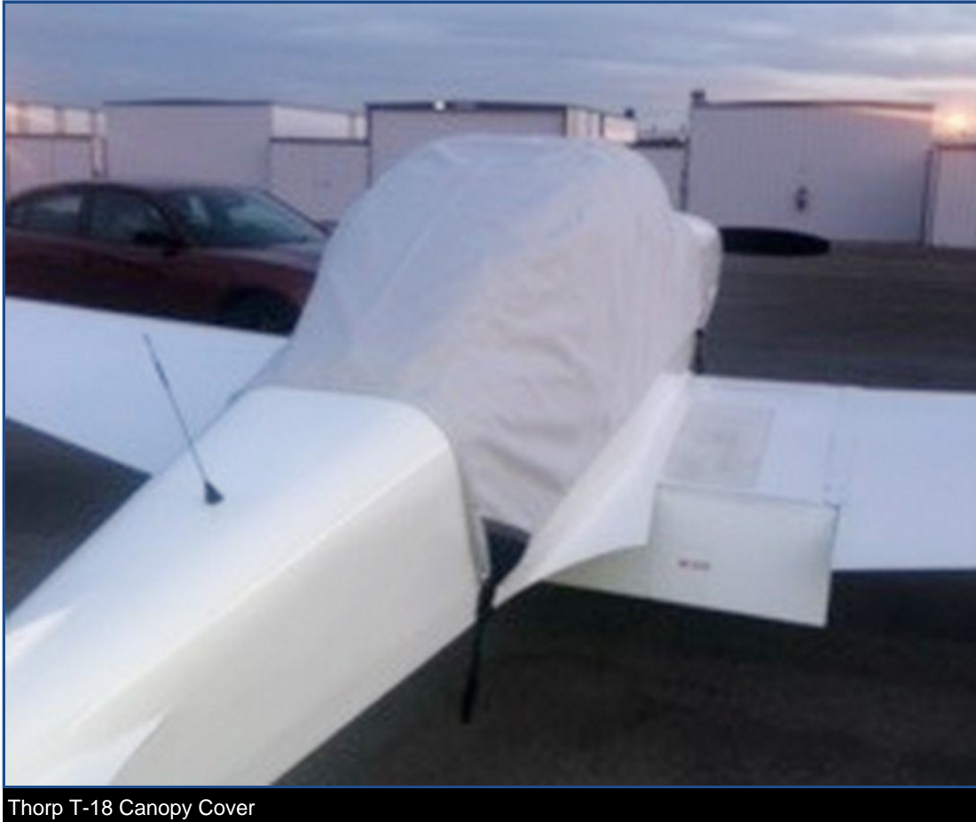
Thorp T-18 Canopy Cover