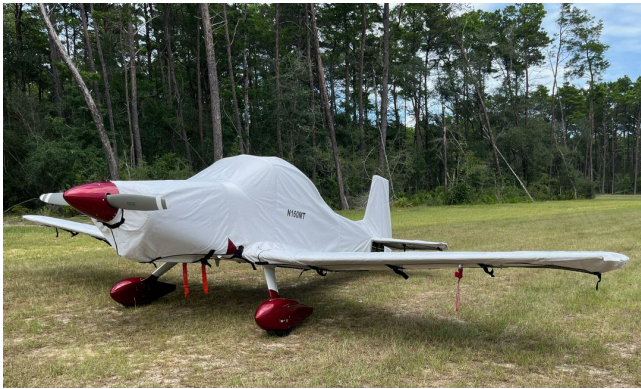
Bushby Mustang Complete Fuselage Cover with Detachable Wing Covers

This cover type is made from Silver Acrylic Sunbrella canvas and is 100% lined with a soft and smooth microfiber. Bruce's Custom Covers developed this material combination especially for aircraft protection. The outer material is medium weight and treated for water resistance, UV resistance and anti-static buildup. The inner lining is a very soft and smooth microfiber to prevent scratching. The material is very reflective, and tests show that the cabin interior temperature can be reduced to near-ambient temperature on the hottest of days. It is water, ice and snow repellent, yet breathable to allow moisture to escape from between the cover and the aircraft surface.