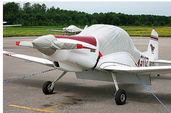
Bushby Mustang Canopy cover and Propellor/Spinner cover