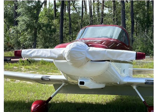
Mustang 2 Prop/Spinner Cover