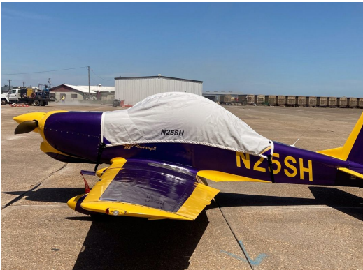
Mustang II Canopy Cover

This cover type is made from Silver Acrylic Sunbrella canvas and is 100% lined with a soft and smooth microfiber. Bruce's Custom Covers developed this material combination especially for aircraft protection. The outer material is medium weight and treated for water resistance, UV resistance and anti-static buildup. The inner lining is a very soft and smooth microfiber to prevent scratching. The material is very reflective, and tests show that the cabin interior temperature can be reduced to near-ambient temperature on the hottest of days. It is water, ice and snow repellent, yet breathable to allow moisture to escape from between the cover and the aircraft surface.