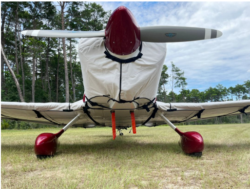
Bushby Mustang Complete Fuselage Cover with Detachable Wing Covers