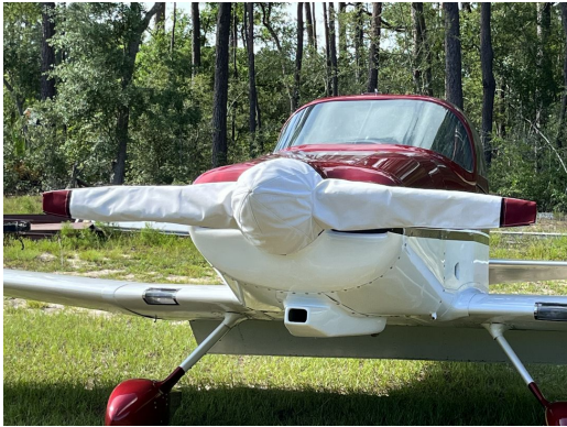
Mustang 2 Prop/Spinner Cover