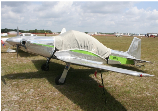
Bushby Mustang Canopy Cover

Travel Covers are made with Silver Solution-Dyed Polyester fabric and only lined over the windshield to save weight. The material is lightweight and more compact for easy stowage in the aircraft. The polyester material is water resistant, but only intended for occasional use outside. We also have an ultra lightweight material available for fitted hangar dust covers. For daily outdoor use, the non-travel Sunbrella Cover is the best choice.