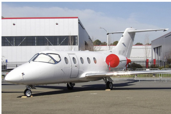
Beechjet Engine Covers, Cockpit HeatShields

Cockpit Heatshields are interior sunshades for the aircraft's cockpit. The product is a unique composite of closed-cell foam with a silver mylar finish. The semi-rigid design is stiff enough to stand inside the window framing. The set folds up flat and is easily stored in the included storage sleeve. Some designs may require velcro and suction cups. Our Heatshields for jets are offered white side out because some aircraft manufacturers have issued advisories against reflective window inserts due to potential heat damage. A Heatshield is an excellent short-term remedy for cockpit overheating, but an external fabric cover is more effective for long-term protection.