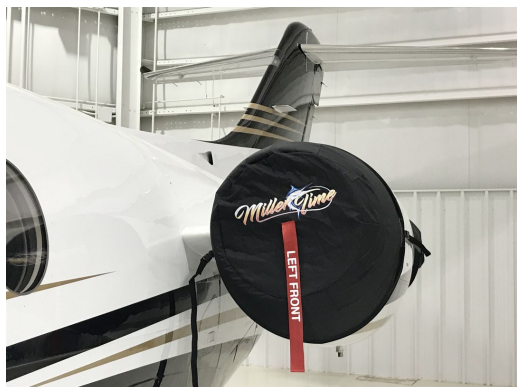
Raytheon 400A Engine Covers

The Hawker Beechcraft Beechjet 400, Hawker 400XP (T1A, T400 Jayhawk) Intake Covers are designed to install easily yet be completely storable. A spring steel hoop is sewn into the hem of each cover, allowing them to be installed without climbing onto the wing or using a stepladder. To store the covers the spring steel hoop folds like a band-saw blade into three nesting rings. Each cover folds into a compact circular bundle which is stored in the included duffle bag, yet they unfold quickly for use. The Tri-Fold Ring cover is made of medium weight nylon which is available in a variety of colors to match the paint trim. Each cover set comes complete with installation and folding instructions. The aircraft's registration number can be silkscreened onto the cover for an extra charge.