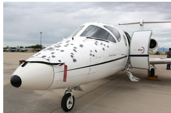
Raytheon Beechjet Hail Damage, and Pitot Covers