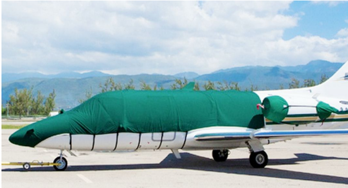
Raytheon Beechjet 400 Fuselage/Nose Cover, Engine Covers

This cover type is made from Silver Acrylic Sunbrella canvas and is 100% lined with a soft and smooth microfiber. Bruce's Custom Covers developed this material combination especially for aircraft protection. The outer material is medium weight and treated for water resistance, UV resistance and anti-static buildup. The inner lining is a very soft and smooth microfiber to prevent scratching. The material is very reflective, and tests show that the cabin interior temperature can be reduced to near-ambient temperature on the hottest of days. It is water, ice and snow repellent, yet breathable to allow moisture to escape from between the cover and the aircraft surface.