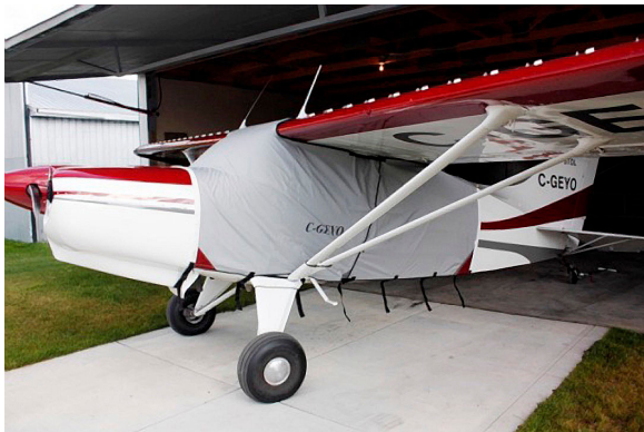
Maule Over-Top Extended Canopy Cover

This cover type is made from Silver Acrylic Sunbrella canvas and is 100% lined with a soft and smooth microfiber. Bruce's Custom Covers developed this material combination especially for aircraft protection. The outer material is medium weight and treated for water resistance, UV resistance and anti-static buildup. The inner lining is a very soft and smooth microfiber to prevent scratching. The material is very reflective, and tests show that the cabin interior temperature can be reduced to near-ambient temperature on the hottest of days. It is water, ice and snow repellent, yet breathable to allow moisture to escape from between the cover and the aircraft surface.