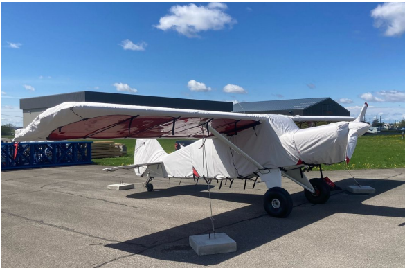
Bearhawk 4-Place Complete Cover Set, AFTER

WINTER USE MATERIAL - Made with Solution-Dyed Polyester fabric, this option is intended for seasonal use to aid in deicing, rain mitigation, or for occasional travel. The material is lighter and more compact, but more susceptible to UV damage and may have a shorter useful life if used continuously outside than the all-year use material.