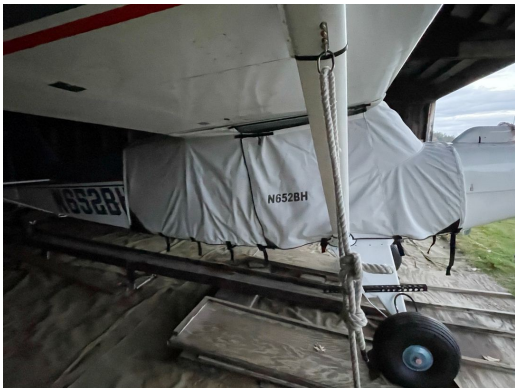
Avipro Bearhawk Extended Over The Top Canopy Cover