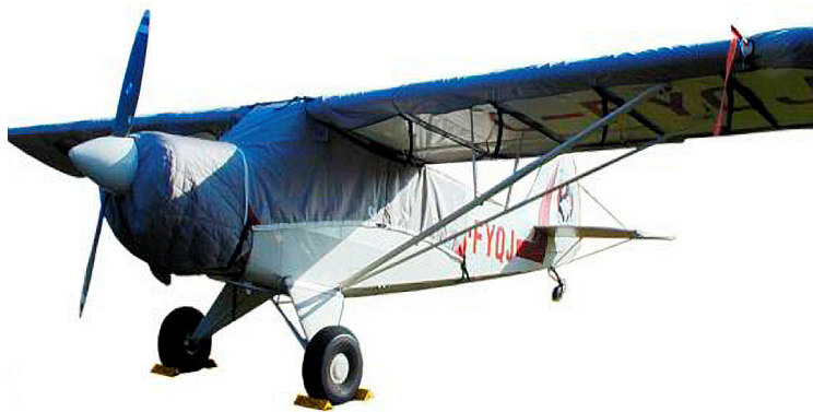
Aviat Husky Insulated Engine Cover, Canopy & Wing Covers

WINTER USE MATERIAL - Made with Solution-Dyed Polyester fabric, this option is intended for seasonal use to aid in deicing, rain mitigation, or for occasional travel. The material is lighter and more compact, but more susceptible to UV damage and may have a shorter useful life if used continuously outside than the all-year use material.