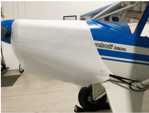
Bearhawk Patrol Engine Cover, test fit cover

This cover type is made from Silver Acrylic Sunbrella canvas and is 100% lined with a soft and smooth microfiber. Bruce's Custom Covers developed this material combination especially for aircraft protection. The outer material is medium weight and treated for water resistance, UV resistance and anti-static buildup. The inner lining is a very soft and smooth microfiber to prevent scratching. The material is very reflective, and tests show that the cabin interior temperature can be reduced to near-ambient temperature on the hottest of days. It is water, ice and snow repellent, yet breathable to allow moisture to escape from between the cover and the aircraft surface.