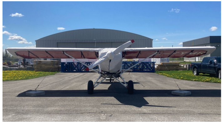
Bearhawk 4-Place Complete Cover Set