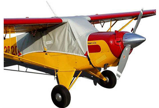
Aviat Husky Canopy Cover & Engine Plugs