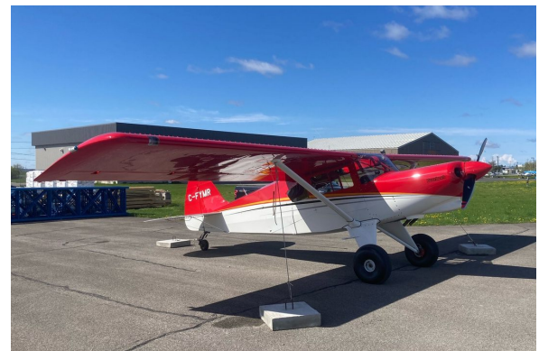
Bearhawk 4-Place Complete Cover Set, BEFORE