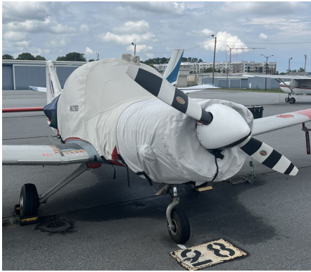
Scottish Aviation Bulldog Canopy & Engine Covers

This cover type is made from Silver Acrylic Sunbrella canvas and is 100% lined with a soft and smooth microfiber. Bruce's Custom Covers developed this material combination especially for aircraft protection. The outer material is medium weight and treated for water resistance, UV resistance and anti-static buildup. The inner lining is a very soft and smooth microfiber to prevent scratching. The material is very reflective, and tests show that the cabin interior temperature can be reduced to near-ambient temperature on the hottest of days. It is water, ice and snow repellent, yet breathable to allow moisture to escape from between the cover and the aircraft surface.