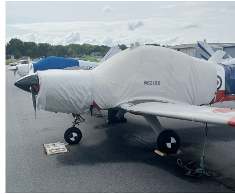
Scottish Aviation Bulldog Canopy & Engine Covers