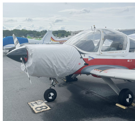
Scottish Aviation Bulldog Engine Cover