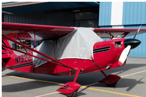
Bellanca Decathlon Travel Canopy Cover Bellanca (American Champion) Decathlon Travel Cover, Light Weight Canopy Cover