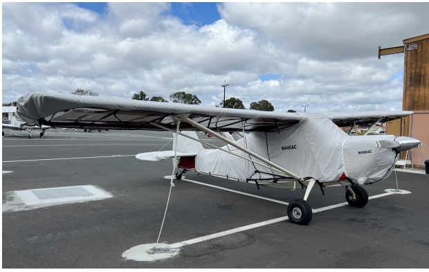
Bellanca Decathlon Full Cover Set