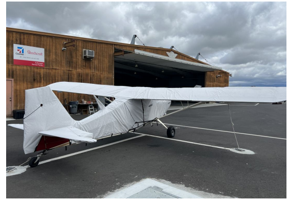
Bellanca Decathlon Full Cover Set