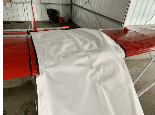
Bellanca Citabria Windshield/Skylight Cover