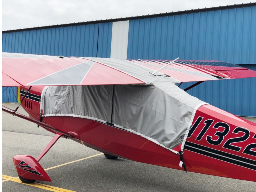
Bellanca Decathlon Travel Canopy Cover

This cover type is made from Silver Acrylic Sunbrella canvas and is 100% lined with a soft and smooth microfiber. Bruce's Custom Covers developed this material combination especially for aircraft protection. The outer material is medium weight and treated for water resistance, UV resistance and anti-static buildup. The inner lining is a very soft and smooth microfiber to prevent scratching. The material is very reflective, and tests show that the cabin interior temperature can be reduced to near-ambient temperature on the hottest of days. It is water, ice and snow repellent, yet breathable to allow moisture to escape from between the cover and the aircraft surface.