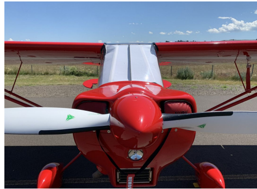
Bellanca Decathlon 8KCAB Heatshield Set with white side out