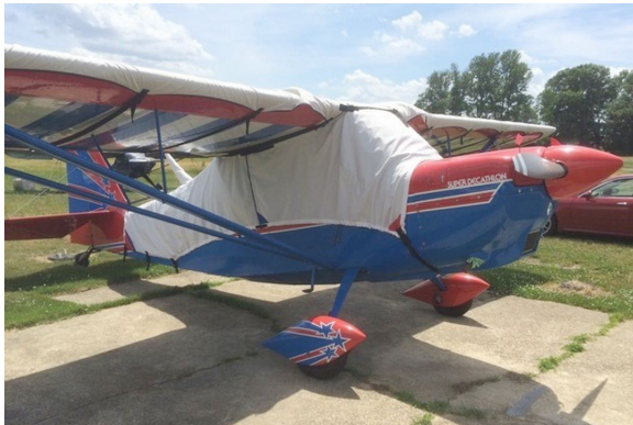
Bellanca Decathlon Canopy Cover (Over-Top, Extended to tail), Wing Covers, Engine Plugs

Engine Inlet Plugs are custom fit for your Bellanca (American Champion) Decathlon intakes, made with heavy-duty vinyl material, and stuffed with a single block of sculpted urethane foam. Each plug has a zipper that allows the foam to be removed and dried if necessary. Engine plugs have warning flags that are visible from the cockpit or 'remove before flight' streamers sewn onto the face of the plugs. Most plugs are imprinted with the aircraft registration number in black for an extra charge. Storage bag NOT included. Engine plugs may be inserted after flight when the engine is still warm. Engine Inlet Plugs are commonly referred to as Cowl Plugs, Intake Plugs, Cowl Blocks, Engine Blocks, and Engine Bungs.