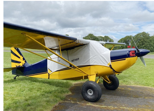
American Champion Citabria canopy cover over the top style, extends to cover gas caps, Engine Plugs