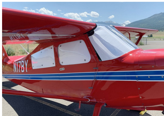
Bellanca Decathlon 8KCAB Heatshield Set with white side out