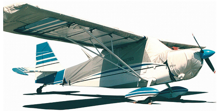
Bellanca Citabria Extended Canopy Cover (extended to tail), Bellanca Citabria Over-Top Canopy Cover, Extended to Tail, Engine Empennage, Wing, Insulated Engine Cover & Wing Covers