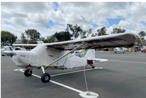
Bellanca Decathlon Full Cover Set

This cover type is made from Silver Acrylic Sunbrella canvas and is 100% lined with a soft and smooth microfiber. Bruce's Custom Covers developed this material combination especially for aircraft protection. The outer material is medium weight and treated for water resistance, UV resistance and anti-static buildup. The inner lining is a very soft and smooth microfiber to prevent scratching. The material is very reflective, and tests show that the cabin interior temperature can be reduced to near-ambient temperature on the hottest of days. It is water, ice and snow repellent, yet breathable to allow moisture to escape from between the cover and the aircraft surface.