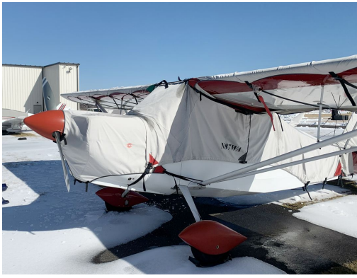
American Champion Decathlon Extended Canopy, Engine, Wing & Empennage Covers