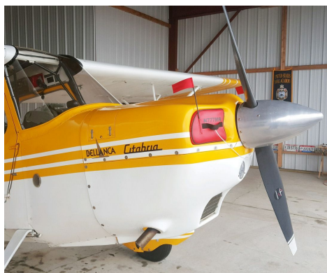
Bellanca Citabria, Scout, Explorer Engine Inlet Plugs