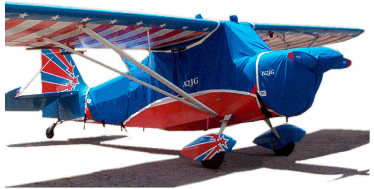
Over-Top Canopy Cover, Extended to Tail, Propellor Cover, & Engine Cover