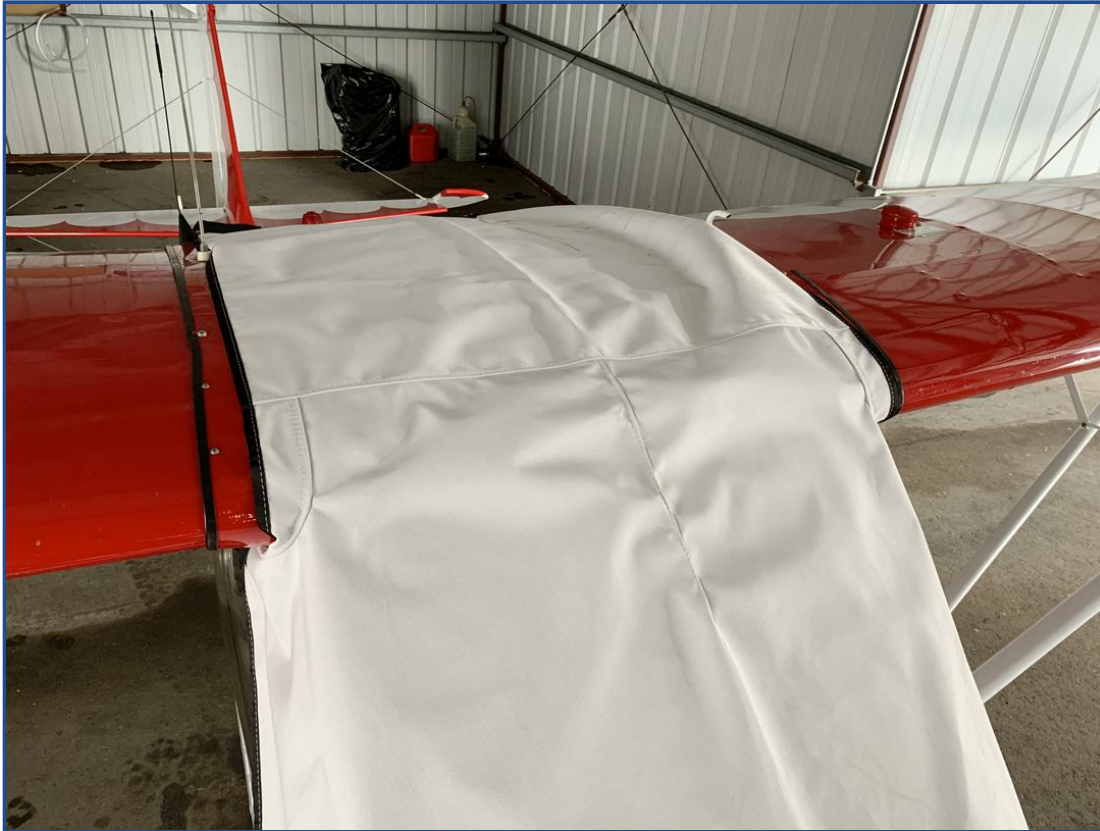
Bellanca Citabria Windshield/Skylight Cover