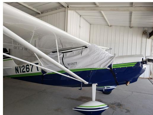
American Champion Aircraft 7GCBC Over-The-Top-Style Canopy Cover