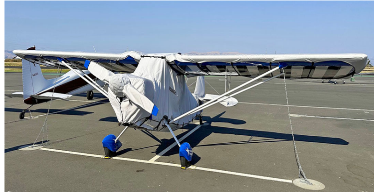
Bellanca Decathlon Cover Set