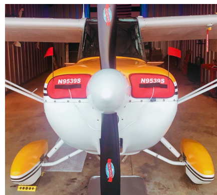
Bellanca Citabria 7ECA Engine Inlet Plugs