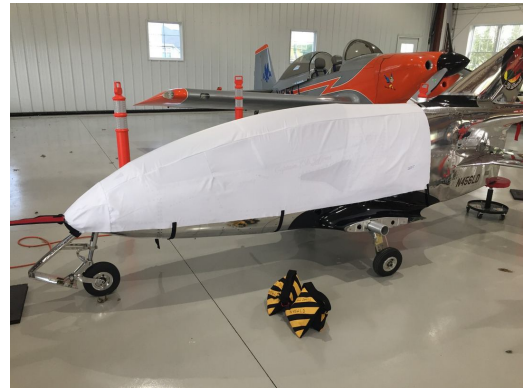
Bede BD-5 Canopy/Nose Cover, test fit cover