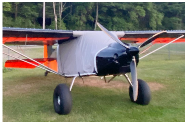
Skyreach Bushcat Travel Weight Canopy Cover