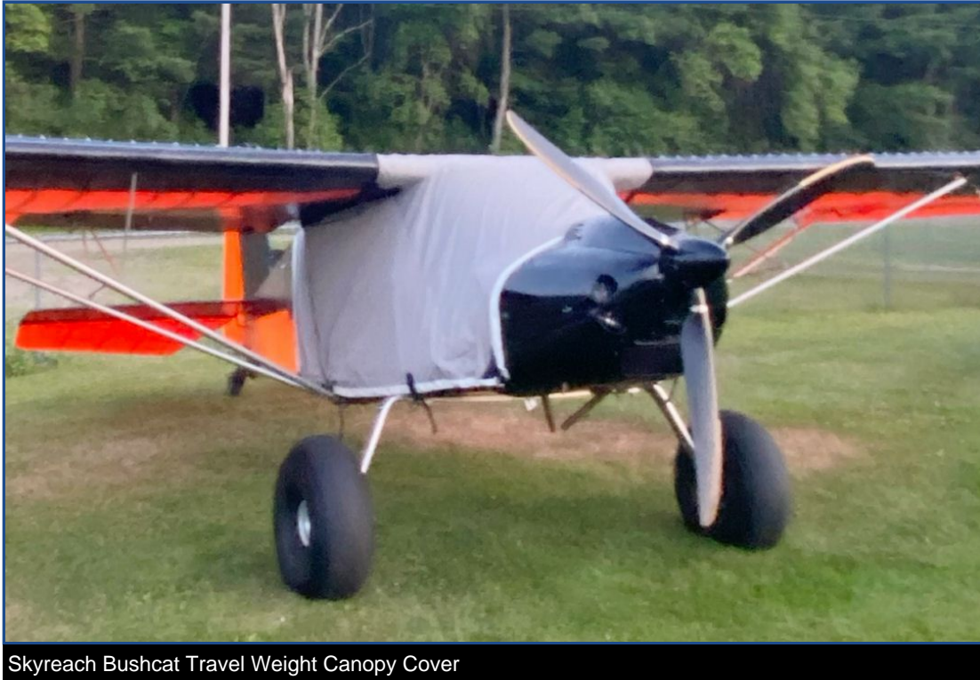
Skyreach Bushcat Travel Weight Canopy Cover