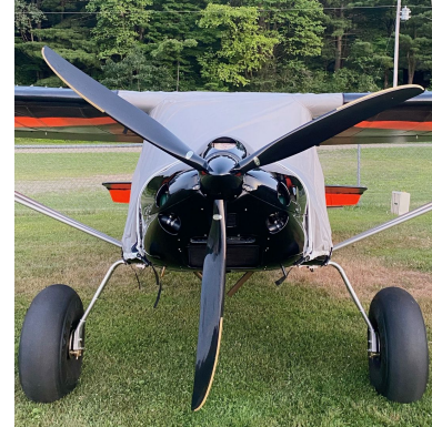
Skyreach Bushcat Travel Weight Canopy Cover