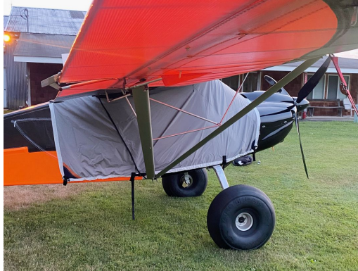
Skyreach Bushcat Travel Weight Canopy Cover

This cover type is made from Silver Acrylic Sunbrella canvas and is 100% lined with a soft and smooth microfiber. Bruce's Custom Covers developed this material combination especially for aircraft protection. The outer material is medium weight and treated for water resistance, UV resistance and anti-static buildup. The inner lining is a very soft and smooth microfiber to prevent scratching. The material is very reflective, and tests show that the cabin interior temperature can be reduced to near-ambient temperature on the hottest of days. It is water, ice and snow repellent, yet breathable to allow moisture to escape from between the cover and the aircraft surface.