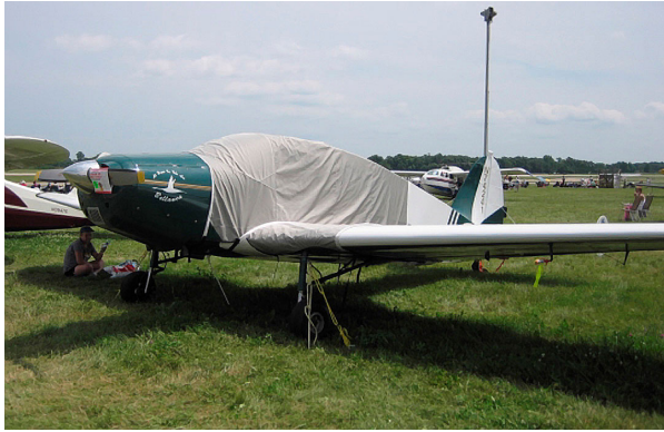
Extended Canopy Cover with Wing Extensions

This cover type is made from Silver Acrylic Sunbrella canvas and is 100% lined with a soft and smooth microfiber. Bruce's Custom Covers developed this material combination especially for aircraft protection. The outer material is medium weight and treated for water resistance, UV resistance and anti-static buildup. The inner lining is a very soft and smooth microfiber to prevent scratching. The material is very reflective, and tests show that the cabin interior temperature can be reduced to near-ambient temperature on the hottest of days. It is water, ice and snow repellent, yet breathable to allow moisture to escape from between the cover and the aircraft surface.