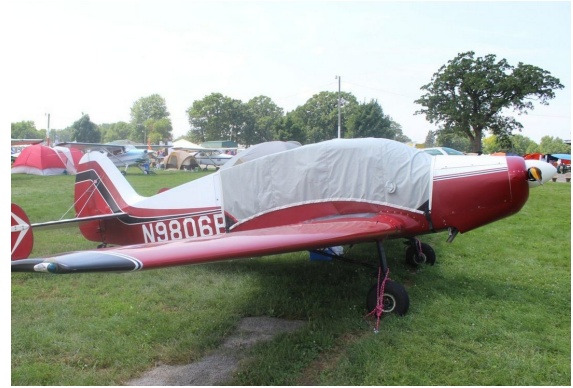
Bellanca Cruisemaster Canopy Cover