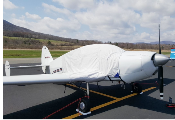
Bellanca Cruisemaster Extended Canopy Cover with 36" Wing Extensions.