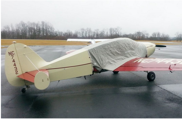
Bellanca Cruisemaster Extended Canopy Cover

This cover type is made from Silver Acrylic Sunbrella canvas and is 100% lined with a soft and smooth microfiber. Bruce's Custom Covers developed this material combination especially for aircraft protection. The outer material is medium weight and treated for water resistance, UV resistance and anti-static buildup. The inner lining is a very soft and smooth microfiber to prevent scratching. The material is very reflective, and tests show that the cabin interior temperature can be reduced to near-ambient temperature on the hottest of days. It is water, ice and snow repellent, yet breathable to allow moisture to escape from between the cover and the aircraft surface.