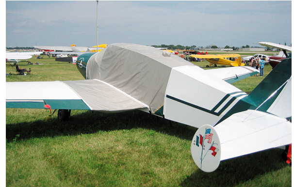
Extended Canopy Cover with Wing Extensions