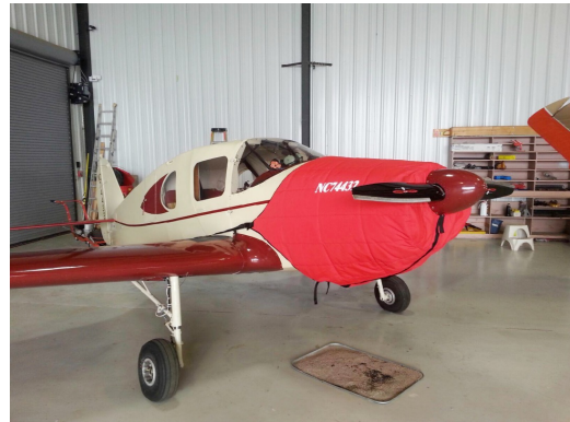
Bellanca Cruisemaster Insulated Engine Cover