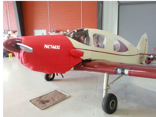
Bellanca Cruisemaster Insulated Engine Cover