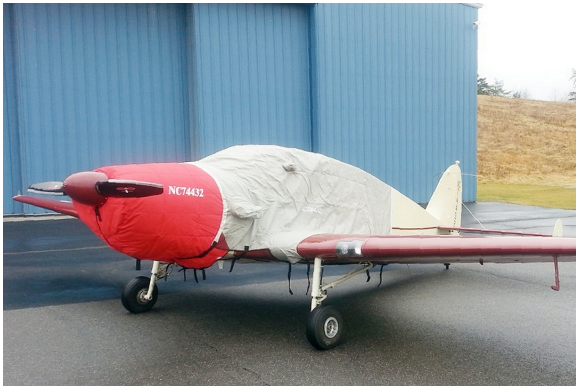
Bellanca Cruisemaster Insulated Engine Cover, Extended Canopy Cover

This cover type is made from Silver Acrylic Sunbrella canvas and is 100% lined with a soft and smooth microfiber. Bruce's Custom Covers developed this material combination especially for aircraft protection. The outer material is medium weight and treated for water resistance, UV resistance and anti-static buildup. The inner lining is a very soft and smooth microfiber to prevent scratching. The material is very reflective, and tests show that the cabin interior temperature can be reduced to near-ambient temperature on the hottest of days. It is water, ice and snow repellent, yet breathable to allow moisture to escape from between the cover and the aircraft surface.