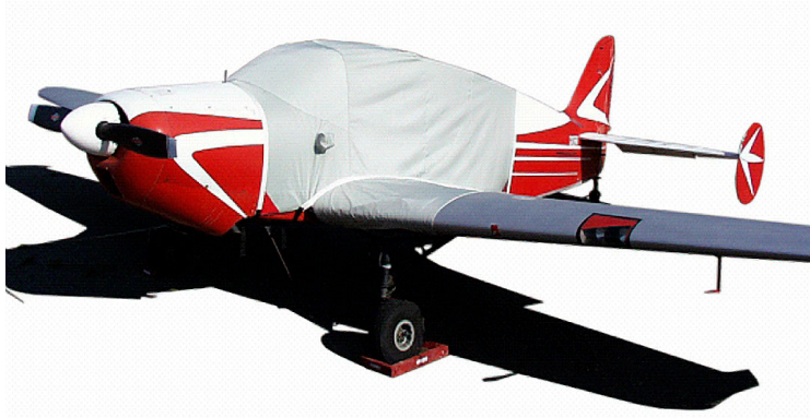
Cruisemaster Extended Canopy Cover w/36" Wing Extensions

This cover type is made from Silver Acrylic Sunbrella canvas and is 100% lined with a soft and smooth microfiber. Bruce's Custom Covers developed this material combination especially for aircraft protection. The outer material is medium weight and treated for water resistance, UV resistance and anti-static buildup. The inner lining is a very soft and smooth microfiber to prevent scratching. The material is very reflective, and tests show that the cabin interior temperature can be reduced to near-ambient temperature on the hottest of days. It is water, ice and snow repellent, yet breathable to allow moisture to escape from between the cover and the aircraft surface.