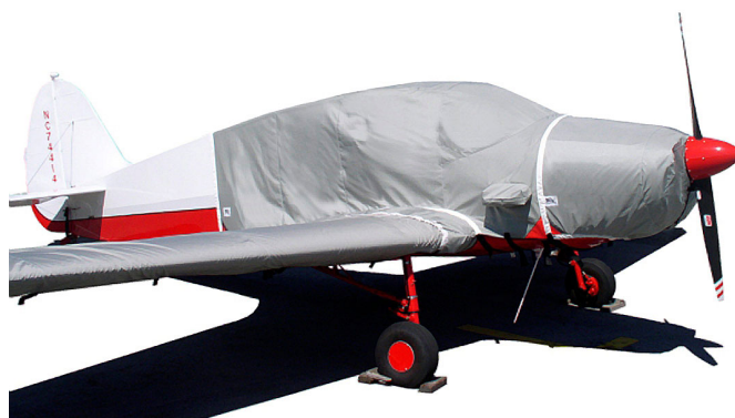
Extended Canopy Cover w/12" Wing Extensions, Engine & Wing Covers