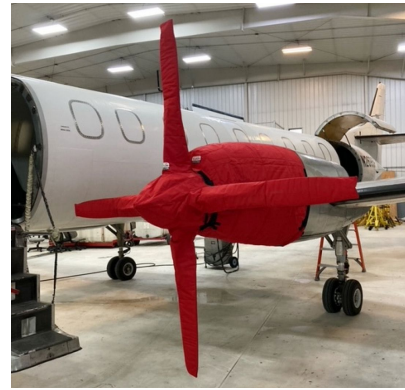
Fairchild Merlin Insulated Engine & Prop Covers