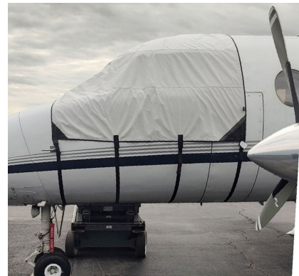
British Aerospace Jetstream 31 Cockpit Cover