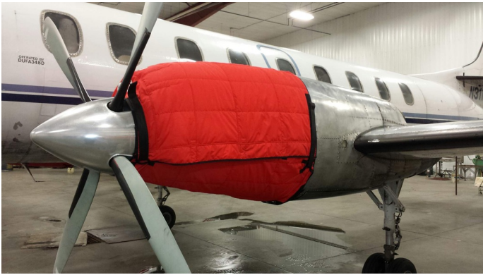
Merlin Insulated Engine Covers

This cover type is made from Silver Acrylic Sunbrella canvas and is 100% lined with a soft and smooth microfiber. Bruce's Custom Covers developed this material combination especially for aircraft protection. The outer material is medium weight and treated for water resistance, UV resistance and anti-static buildup. The inner lining is a very soft and smooth microfiber to prevent scratching. The material is very reflective, and tests show that the cabin interior temperature can be reduced to near-ambient temperature on the hottest of days. It is water, ice and snow repellent, yet breathable to allow moisture to escape from between the cover and the aircraft surface.