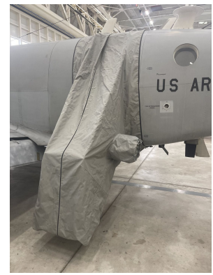
King Air Airstair Door Cover