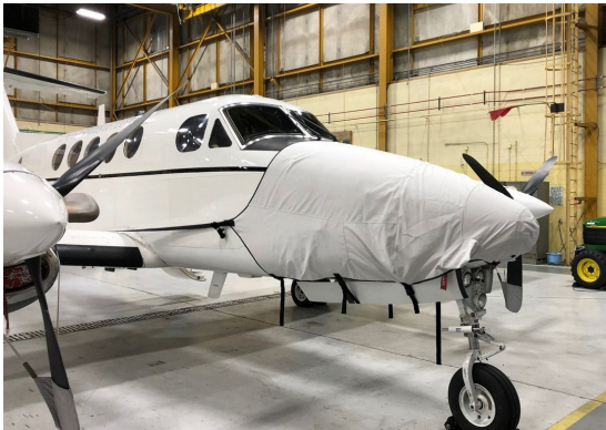
King Air 200 Nose Cover

This cover type is made from Silver Acrylic Sunbrella canvas and is 100% lined with a soft and smooth microfiber. Bruce's Custom Covers developed this material combination especially for aircraft protection. The outer material is medium weight and treated for water resistance, UV resistance and anti-static buildup. The inner lining is a very soft and smooth microfiber to prevent scratching. The material is very reflective, and tests show that the cabin interior temperature can be reduced to near-ambient temperature on the hottest of days. It is water, ice and snow repellent, yet breathable to allow moisture to escape from between the cover and the aircraft surface.