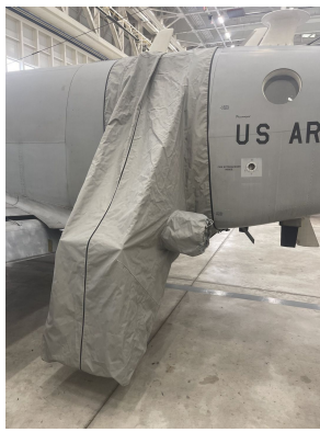
King Air Airstair Coor Cover