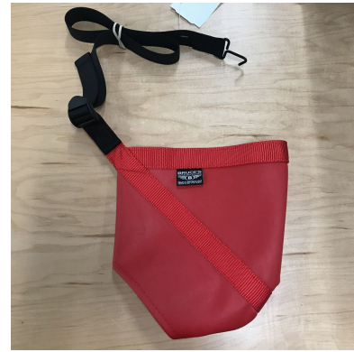
Prop Tie-Down, Various Models (secures with a hook to engine nacelle)