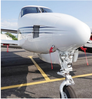
Beech King Air C90 Pitot Covers, Heat Exchanger Plugs

Engine Inlet Plugs are custom fit for your Beech King Air C90-1 intakes, made with heavy-duty vinyl material, and stuffed with a single block of sculpted urethane foam. Each plug has a zipper that allows the foam to be removed and dried if necessary. Engine plugs have warning flags that are visible from the cockpit or 'remove before flight' streamers sewn onto the face of the plugs. Most plugs are imprinted with the aircraft registration number in black for an extra charge. Storage bag NOT included. Engine plugs may be inserted after flight when the engine is still warm. Engine Inlet Plugs are commonly referred to as Cowl Plugs, Intake Plugs, Cowl Blocks, Engine Blocks, and Engine Bungs.