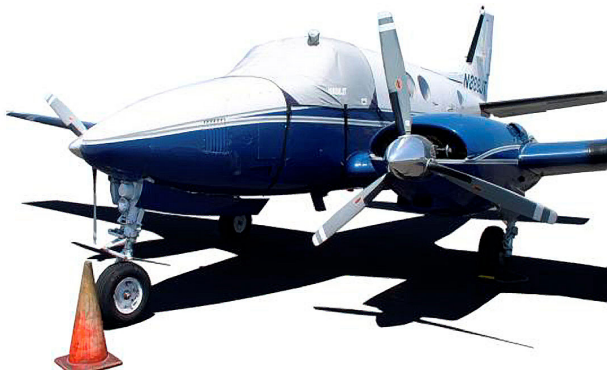
King Air Cockpit Cover, belly-strap type