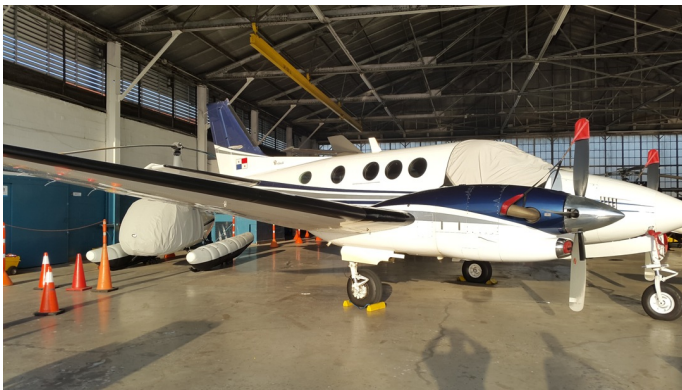
Raytheon Beech King Air Cockpit Cover, Prop Tie/Exhaust Covers, Inlet Plugs

This cover type is made from Silver Acrylic Sunbrella canvas and is 100% lined with a soft and smooth microfiber. Bruce's Custom Covers developed this material combination especially for aircraft protection. The outer material is medium weight and treated for water resistance, UV resistance and anti-static buildup. The inner lining is a very soft and smooth microfiber to prevent scratching. The material is very reflective, and tests show that the cabin interior temperature can be reduced to near-ambient temperature on the hottest of days. It is water, ice and snow repellent, yet breathable to allow moisture to escape from between the cover and the aircraft surface.