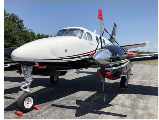
Beech C90A Prop Tie Downs/Exhaust Covers