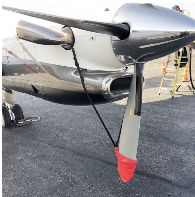
Beech King Air 350 Prop Tie-Downs

This cover type is made from Silver Acrylic Sunbrella canvas and is 100% lined with a soft and smooth microfiber. Bruce's Custom Covers developed this material combination especially for aircraft protection. The outer material is medium weight and treated for water resistance, UV resistance and anti-static buildup. The inner lining is a very soft and smooth microfiber to prevent scratching. The material is very reflective, and tests show that the cabin interior temperature can be reduced to near-ambient temperature on the hottest of days. It is water, ice and snow repellent, yet breathable to allow moisture to escape from between the cover and the aircraft surface.