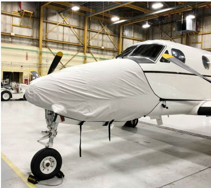
King Air 200 Nose Cover

This cover type is made from Silver Acrylic Sunbrella canvas and is 100% lined with a soft and smooth microfiber. Bruce's Custom Covers developed this material combination especially for aircraft protection. The outer material is medium weight and treated for water resistance, UV resistance and anti-static buildup. The inner lining is a very soft and smooth microfiber to prevent scratching. The material is very reflective, and tests show that the cabin interior temperature can be reduced to near-ambient temperature on the hottest of days. It is water, ice and snow repellent, yet breathable to allow moisture to escape from between the cover and the aircraft surface.