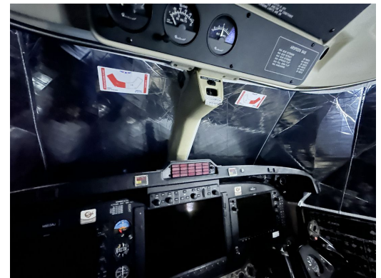
Beechcraft B200 Cockpit Heatshields