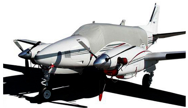
King Air Canopy Cover, Engine Plugs, Prop-Tie/Exhaust Covers