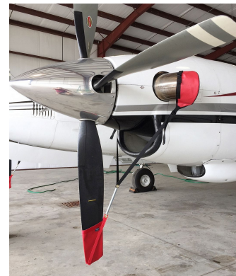
Beech King Air C90 Prop Tie/Exhaust Cover Set