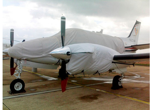
King Air C90 Canopy/Nose Cover, Engine Covers