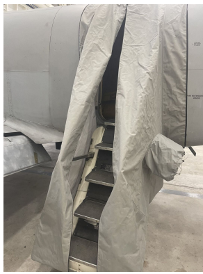
King Air Airstair Door Cover