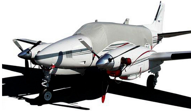
King Air Canopy Cover, Engine Plugs, Prop-Tie/Exhaust Covers

Travel Covers are made with Silver Solution-Dyed Polyester fabric and only lined over the windshield to save weight. The material is lightweight and more compact for easy stowage in the aircraft. The polyester material is water resistant, but only intended for occasional use outside. We also have an ultra lightweight material available for fitted hangar dust covers. For daily outdoor use, the non-travel Sunbrella Cover is the best choice.