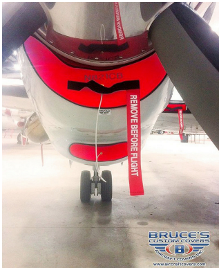
Engine and Oil Cooler Inlet Plugs