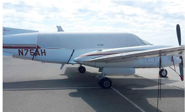
King Air 350 Canopy Cover