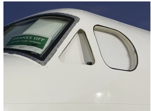
Beechcraft B200 Cockpit Heatshields