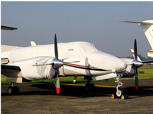
King Air 350 Canopy/Nose Cover, Engine Covers