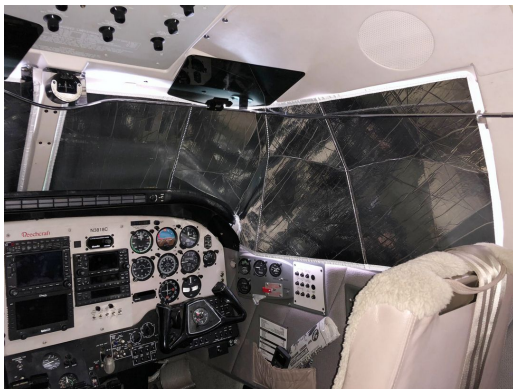
Beech King Air 90 & 100 (U-21, RU-21, T-44) Cockpit Heatshields

Cockpit Heatshields are interior sunshades for the aircraft's cockpit. The product is a unique composite of closed-cell foam with a silver mylar finish. The semi-rigid design is stiff enough to stand inside the window framing. The set folds up flat and is easily stored in the included storage sleeve. Some designs may require velcro and suction cups. A Heatshield is an excellent short-term remedy for cockpit overheating, but an external fabric cover is more effective for long-term protection.