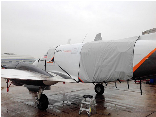
King Air Cargo/Jump Door Rain Cover