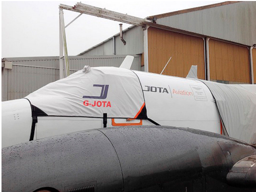
King Air Windshield/Cockpit Cover

Travel Covers are made with Silver Solution-Dyed Polyester fabric and only lined over the windshield to save weight. The material is lightweight and more compact for easy stowage in the aircraft. The polyester material is water resistant, but only intended for occasional use outside. We also have an ultra lightweight material available for fitted hangar dust covers. For daily outdoor use, the non-travel Sunbrella Cover is the best choice.