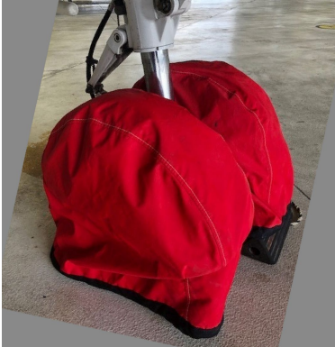
Beech King Air 300 Tire Covers (main gear)

ALL-YEAR USE MATERIAL - Made with Silver Acrylic Sunbrella canvas, the all-year use material is the best option for sun protection and cover longevity. This heavier more durable material is intended for all weather conditions, such as rain and snow or lots of sun.