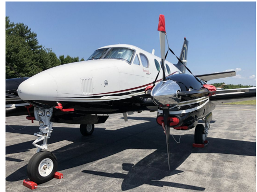
Beech C90A Prop Tie Downs/Exhaust Covers