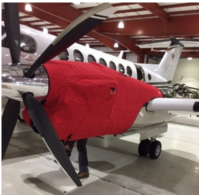
Beech King Air 200 Insulated Engine Cover

This cover type is made from Silver Acrylic Sunbrella canvas and is 100% lined with a soft and smooth microfiber. Bruce's Custom Covers developed this material combination especially for aircraft protection. The outer material is medium weight and treated for water resistance, UV resistance and anti-static buildup. The inner lining is a very soft and smooth microfiber to prevent scratching. The material is very reflective, and tests show that the cabin interior temperature can be reduced to near-ambient temperature on the hottest of days. It is water, ice and snow repellent, yet breathable to allow moisture to escape from between the cover and the aircraft surface.