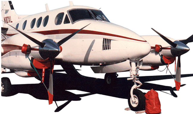
Pitot, Exhaust Covers, Engine Plugs &amp; Prop Ties

Engine Inlet Plugs are custom fit for your Beech King Air C90-1 intakes, made with heavy-duty vinyl material, and stuffed with a single block of sculpted urethane foam. Each plug has a zipper that allows the foam to be removed and dried if necessary. Engine plugs have warning flags that are visible from the cockpit or 'remove before flight' streamers sewn onto the face of the plugs. Most plugs are imprinted with the aircraft registration number in black for an extra charge. Storage bag NOT included. Engine plugs may be inserted after flight when the engine is still warm. Engine Inlet Plugs are commonly referred to as Cowl Plugs, Intake Plugs, Cowl Blocks, Engine Blocks, and Engine Bungs.