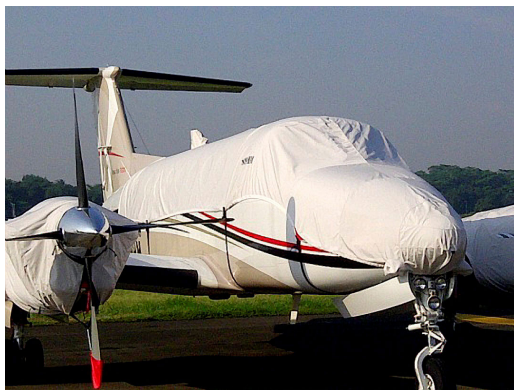
King Air 350 Canopy/Nose Cover, Engine Covers

Travel Covers are made with Silver Solution-Dyed Polyester fabric and only lined over the windshield to save weight. The material is lightweight and more compact for easy stowage in the aircraft. The polyester material is water resistant, but only intended for occasional use outside. We also have an ultra lightweight material available for fitted hangar dust covers. For daily outdoor use, the non-travel Sunbrella Cover is the best choice.