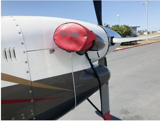
Beech King Air 350 Prop Tie-Downs/Exhaust Covers Combination

This cover type is made from Silver Acrylic Sunbrella canvas and is 100% lined with a soft and smooth microfiber. Bruce's Custom Covers developed this material combination especially for aircraft protection. The outer material is medium weight and treated for water resistance, UV resistance and anti-static buildup. The inner lining is a very soft and smooth microfiber to prevent scratching. The material is very reflective, and tests show that the cabin interior temperature can be reduced to near-ambient temperature on the hottest of days. It is water, ice and snow repellent, yet breathable to allow moisture to escape from between the cover and the aircraft surface.