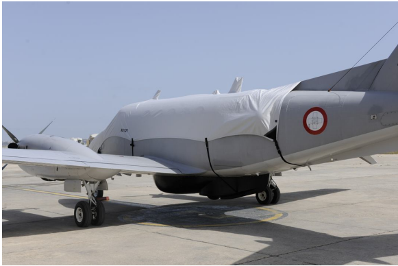
King Air 200 Canopy/Nose Cover

The material is very reflective, and tests show that the cabin interior temperature can be reduced to near-ambient temperature on the hottest of days. It is water, ice and snow repellent, yet breathable to allow moisture to escape from between the cover and the aircraft surface.