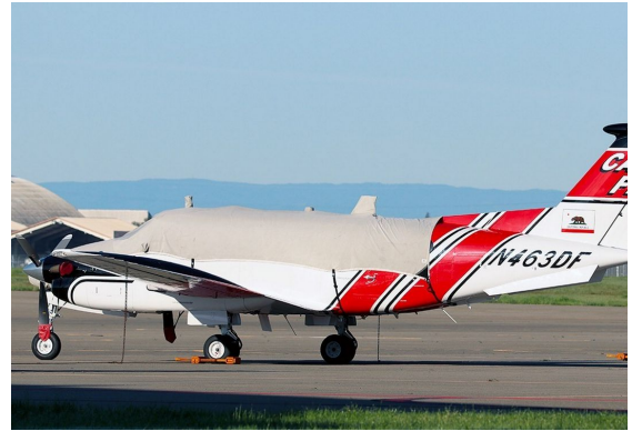
Beech King Air B200 Canopy/Nose Cover