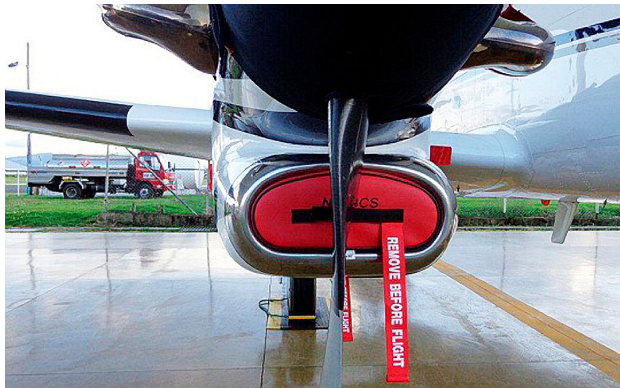
Beech King Air C90B Main Engine Inlet Plug

Engine Inlet Plugs are custom fit for your Beech King Air 90 & 100 (U-21, RU-21, T-44) intakes, made with heavy-duty vinyl material, and stuffed with a single block of sculpted urethane foam. Each plug has a zipper that allows the foam to be removed and dried if necessary. Engine plugs have warning flags that are visible from the cockpit or 'remove before flight' streamers sewn onto the face of the plugs. Most plugs are imprinted with the aircraft registration number in black for an extra charge. Storage bag NOT included. Engine plugs may be inserted after flight when the engine is still warm. Engine Inlet Plugs are commonly referred to as Cowl Plugs, Intake Plugs, Cowl Blocks, Engine Blocks, and Engine Bungs.